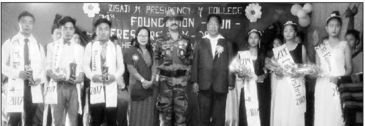
Zisaji Presidency College (ZPC) celebrated its 21 st Foundation Day cum Fresher's meet on 10 th July, 2017 at the College Auditorium.