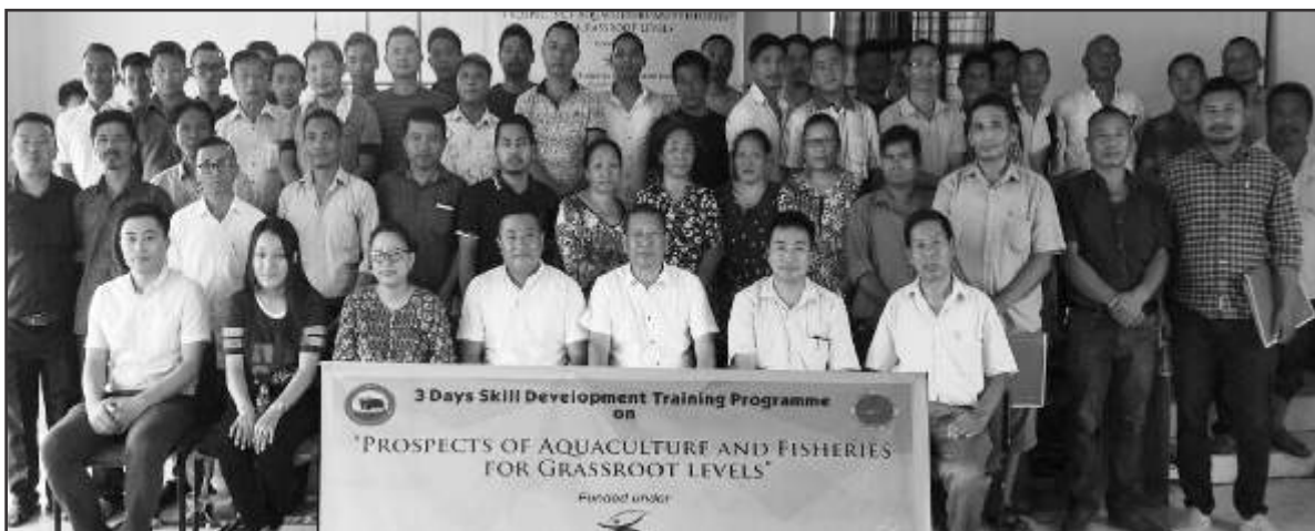
Trainees of the 3 days skill development on prospects of Aquaculture with resource persons at Brooder Fish Farm Dimapur on 18 th July, 2017.