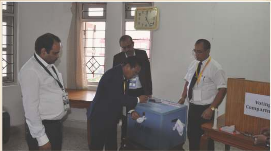
Elections to vote India's 14 th President took place on 17 th July, 2017 from 10:00 am to 5:00 pm at the Nagaland Assembly Secretariat, Kohima. Members of the Nagaland Legislative Assembly participated in the electoral process.