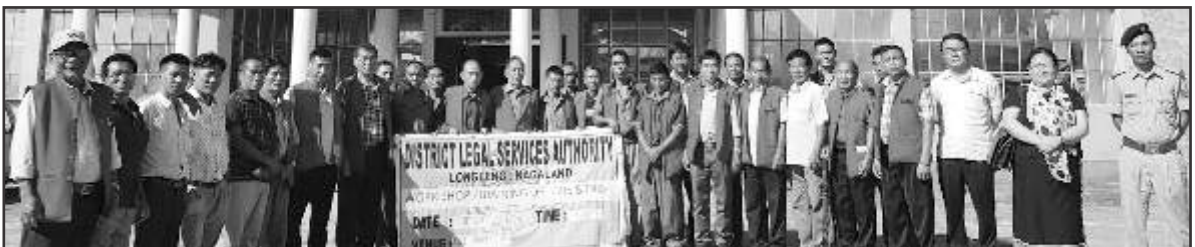
LDLSA team with DBs, GBS, ward Presidents and Secretaries during the workshop/training at the Customary Court, Longleng on 17 th July, 2017.

The advisory should be strictly complied by all concerned till the restoration work which has already been initiated by the concerned