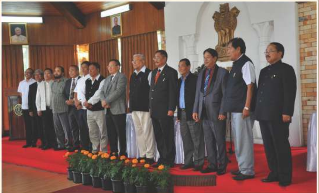
Nagaland Governor, P. B. Acharya and Chief Minister T.R. Zeliang with the Cabinet Ministers at Raj Bhavan, Kohima on 22 nd July, 2017 after the swearing in ceremony.