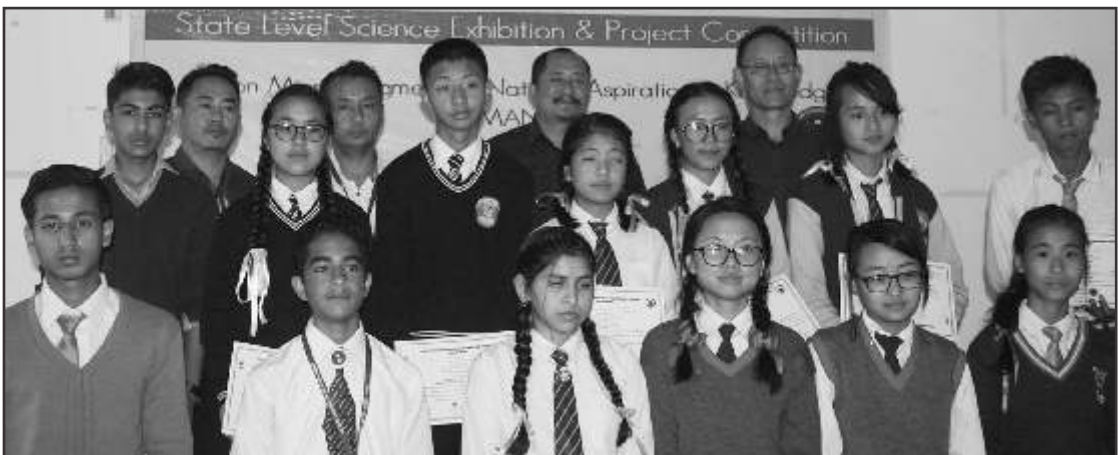
The state level INSPIRE Science and Project Competition, 2017 was held at SCERT, Kohima on 27 th July, 2017.