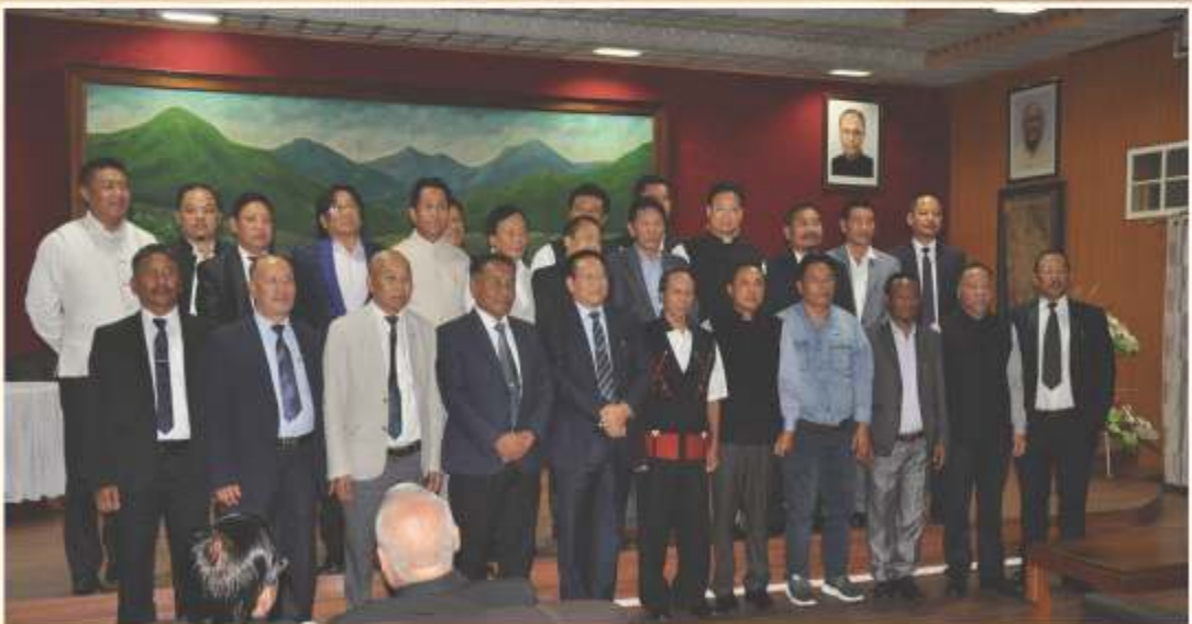
Chief Minister, Nagaland, T.R. Zeliang administered the oath of office and secrecy to 9 Advisors and 26 Parliamentary Secretaries on 25 th July, 2017 at the State Banquet Hall, Kohima.