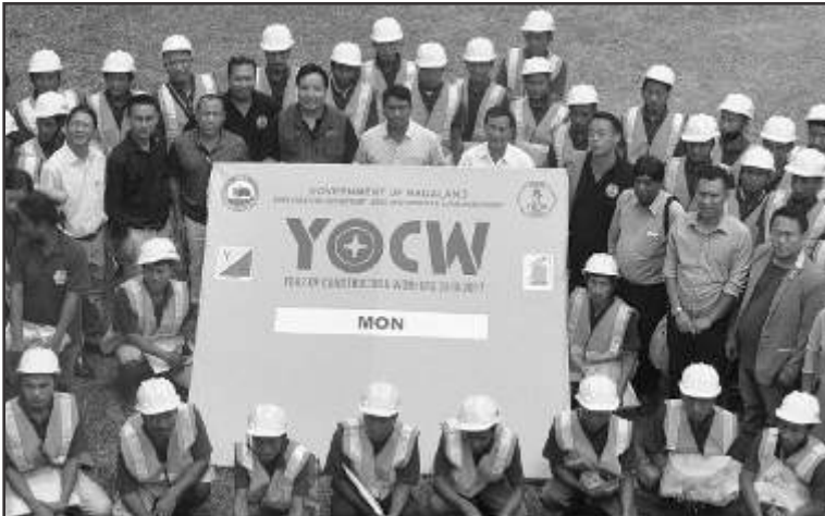
The commencement programme for Year of Construction workers 2017 for Mon district was held on 17 th July 2017 at ITI, Mon.

related matters and participants will be given Assistant Mason Certificate after completion of the training.