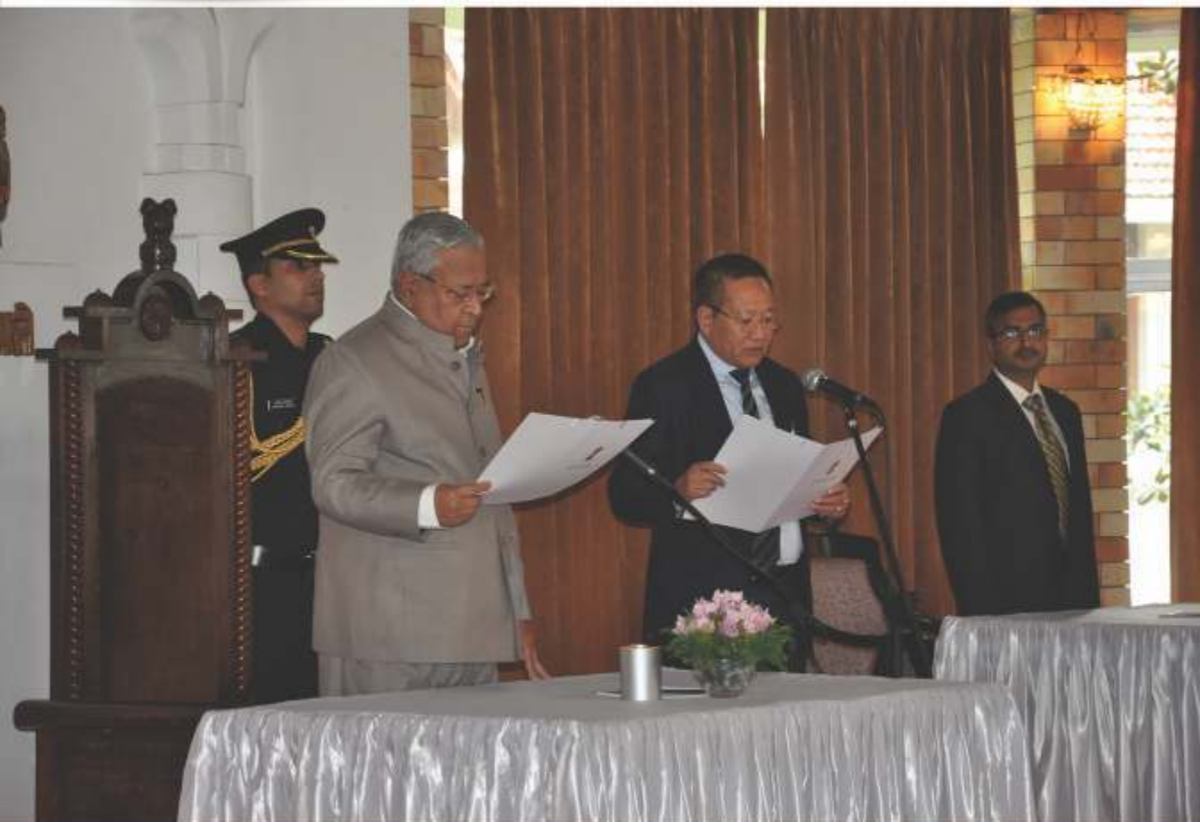
Nagaland Governor P.B. Acharya administering the oath of office to Chief Minister T.R. Zeliang on 19 th July 2017 at Durbar Hall, Raj Bhavan, Kohima.