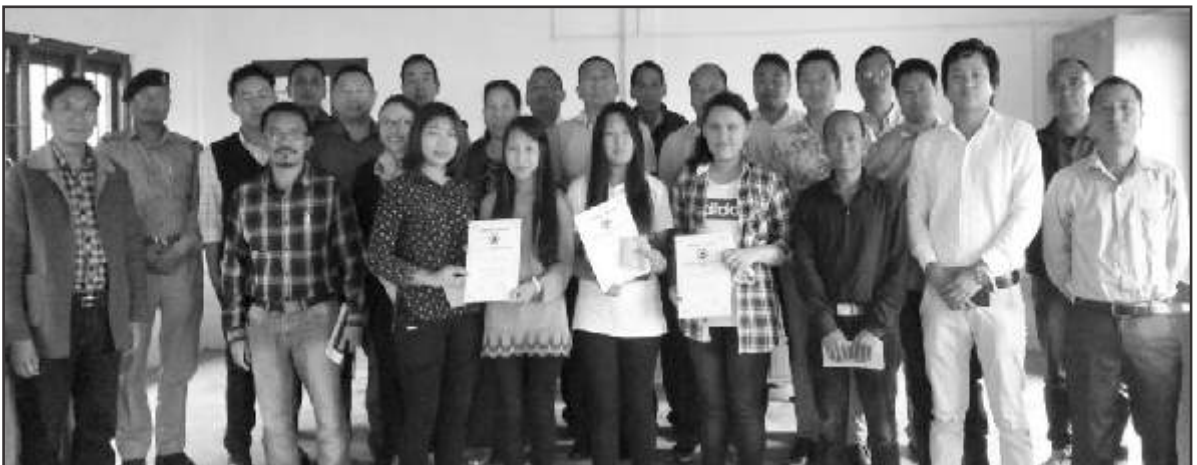
Felicitation programme for the meritorious HSLC and HSSLC examination, 2017 from GHSs & GHSSs held at Tseminyu on 10 th July, 2017