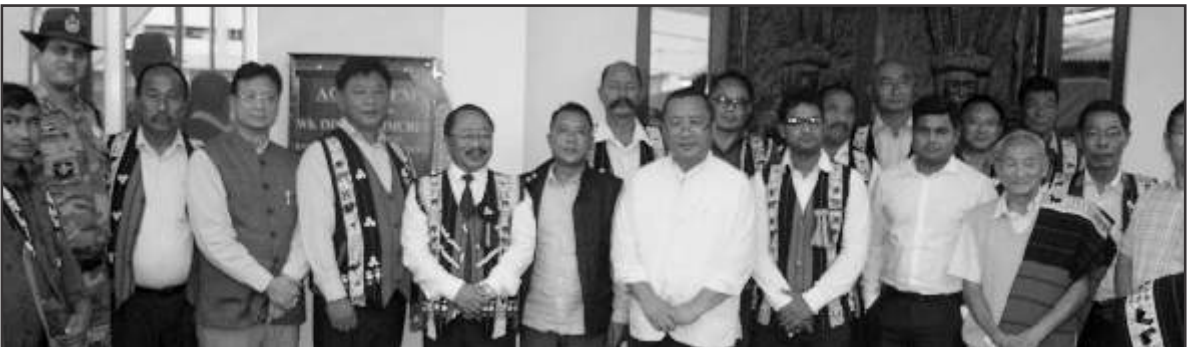
Minister of Forest, Environment & Climate Change, Nagaland, Imkong L Imchen, Parliamentary Secretaries and other officials at the inaugural of newly constructed office building of Ao Senden at Mokochung on 4 th July, 2017

A two room chamber of Mokochung Press club was inaugurated on 6 th July, 2017 by Parliamentary Secretary,