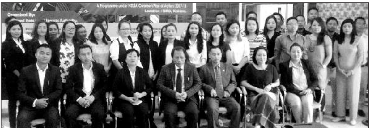
The three day Induction Training of Panel Lawyers on Lawyering Skills began at SIRD Kohima on 27 th July 2017.

Panel Lawyers of Nagaland State Legal Services Authority (NSLSA) from all