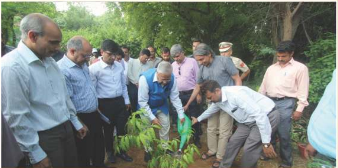
Governor, Nagaland, P.B. Acharya planted a sapling at the proposed 400 capacity hostel site for North East students in JNU on 26 th July 2017.