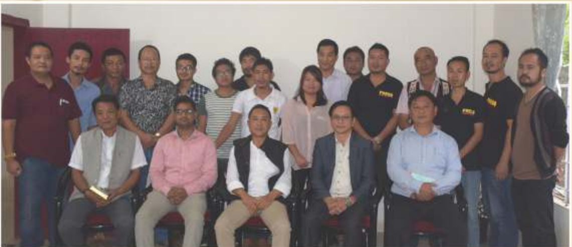
Parliamentary Secretary for IPR, Imtikumzuk along with other officials and members of the MPC during the inauguration of Mokokchung Press Club Chamber at DPRO office building, Mokokchung on 6 th July 2017.