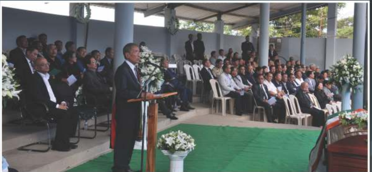
Former Chief Minister of Nagaland Dr. Shürhozelie Liezietsu speaking at the funeral service of late Kiyaniile Peseyie, former Minister and Nagaland Legislative Assembly Speaker at Centenary Ground, Jotsoma on 28 th September 2017.