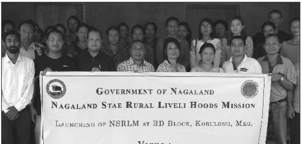
Officials and participants during the launching programme of Nagaland State Rural Livelihood Mission (NSRLM) for RD Block, Kobulong, Mokokchung on 21 st September 2017.

The programme was chaired by Area Coordinator, Kobulong block,