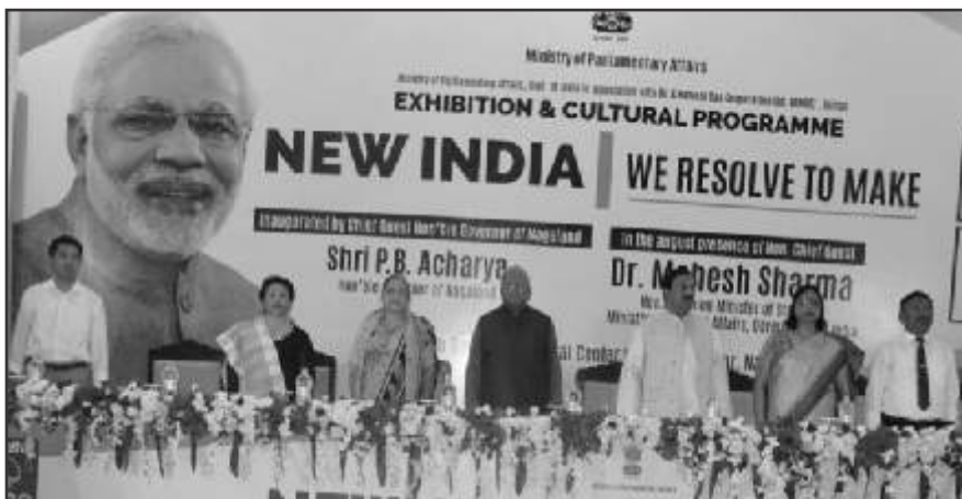
Governor, P.B. Acharya, Union Minister, Dr. Mahesh Sharma along with their lady wives and other officials during the program on New India held at NEZCC Dimapur on 14 th September 2017.

In his brief address, Acharya dubbed Nagaland as second to none with huge potentials in the field of tourism,