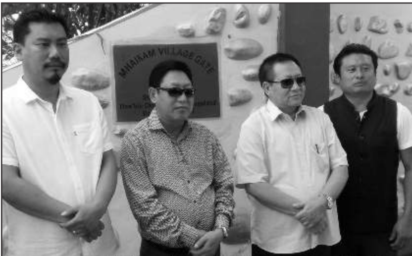
Chief Minister, T.R. Zeliang and his colleagues during the inaugural function of the Mhaikam village gate and rostrum inauguration on 23 rd September 2017.

performed by Baptist Youth Mhaikam. Short speeches were also delivered by Council Chairman, Lamlai Village and Ex- Chairman, Mhaikam village.