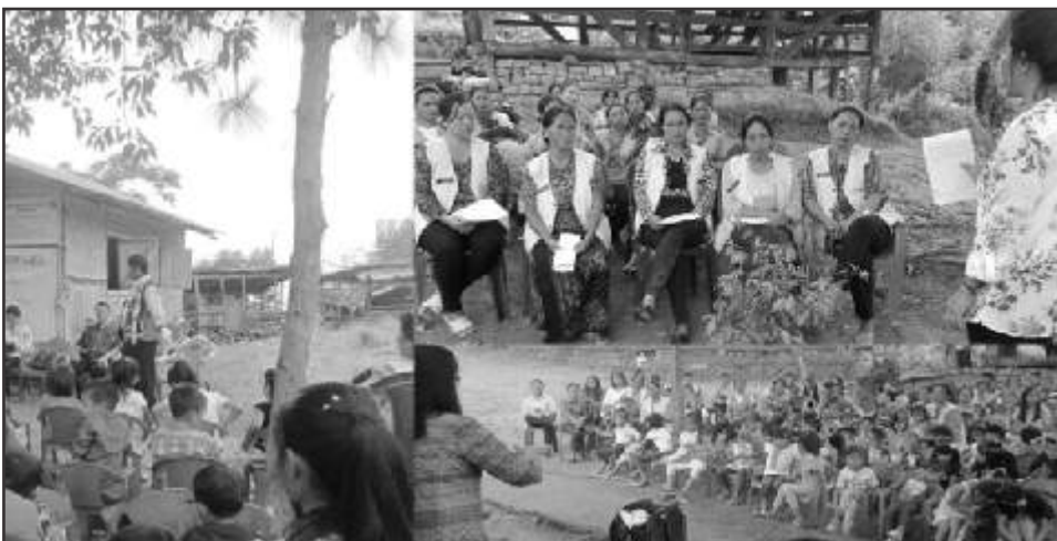
Participants of the National Nutrition Week celebration at Mokokchung on 7 th September, 2017.

The week was celebrated with focus on making people aware of the importance of eating proper nutritious food and the importance of nutrition from a very young age. Awareness Generation