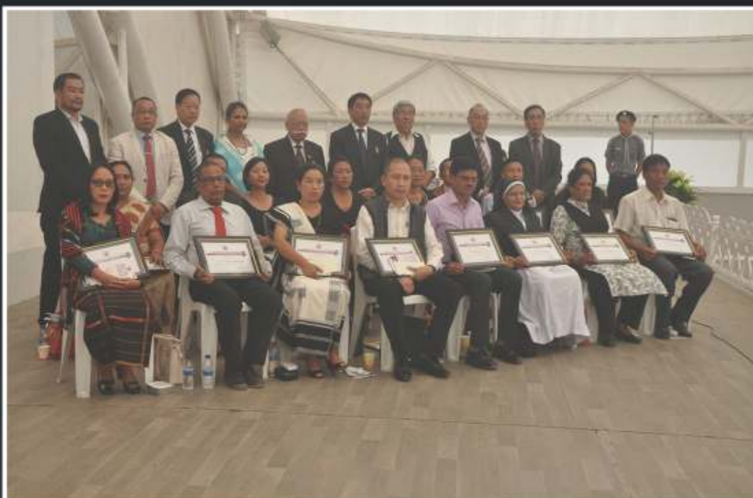
Minister for School Education and Parliamentary Affairs, Tokheho Yepthomi, Advisors, Ministers and School Education Officials along with the recipients of the State Teachers' Day Award 2017 during the state level Teachers' Day celebration on 5 th September, 2017 at NBCC Convention Hall, Kohima.