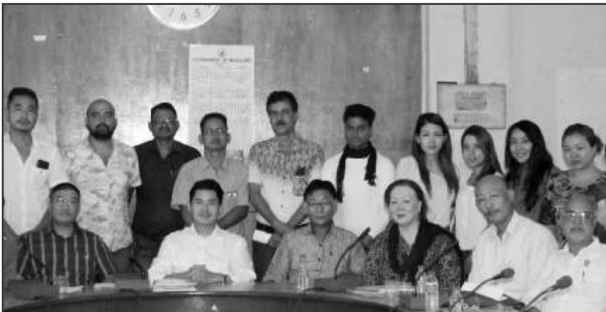
DC, Dimapur and President, SPCAs, Kesonyu Yhome, IAS, with SPCA team after the 2 nd general meeting at DC's Conference Hall, Dimapur on 7 th September, 2017.

The members of the committee interacted and discussed with the villagers, the various areas requiring attention and assistance. Under the 14 th Assembly Constituency, Southern Angami village, Mima village was adopted by the DPDB Village Adoption Committee.