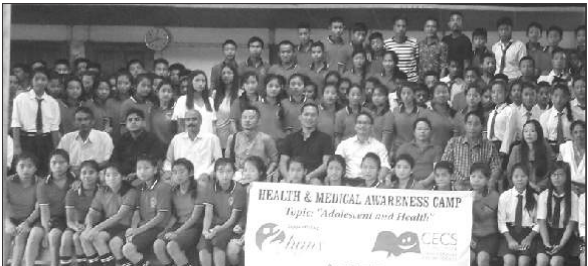
The resource persons along with the participating students during the Health and Medical Awareness Camp at Christian School Tamlu on 20 th September 2017.

Speaking on Consumer Protection and NALSA (Protection and enforcement of Tribal Rights) Scheme 2015, Panel Lawyer, PDLSA Echang informed that the Protection and Enforcement of Tribal Rights Scheme is aimed at ensuring access to justice to the tribal people in all its connotations - access to rights, benefits, legal aid, other legal services etc.