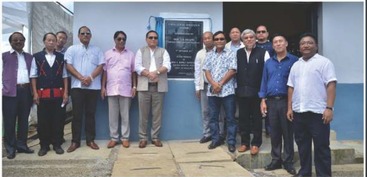
Chief Minister, T. R. Zeliang with other legislators and officials at the commissioning of 5MVA, 33/11 KV Sub-Station at Jalukie, Peren on 2 nd September, 2017.