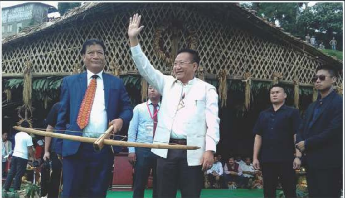
Nagaland Chief Minister, T. R. Zeliang gracing the second day of the two day 'Lao-ong Mo' festival at Mon town on 29 th September 2017.