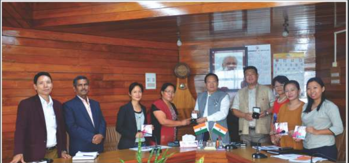
Nagaland Chief Minister, T.R. Zeliang chosen as the Chief Ambassador for the Beti Bachao Beti Padhao (BBBP) campaign, being felicitated at a ceremonial programme held at CMO Conference Hall, Secretariat on September 25, 2017.