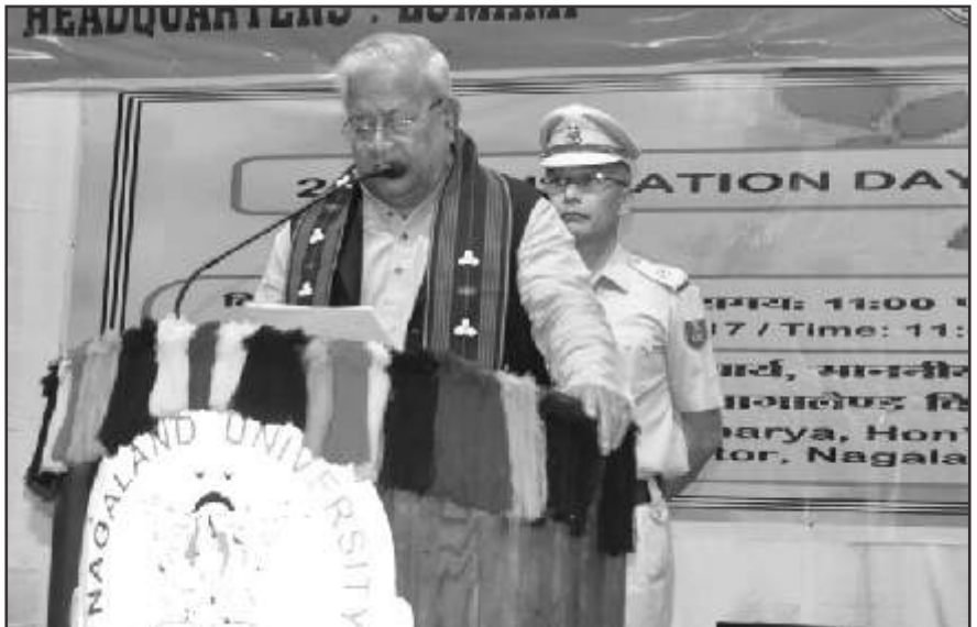
Governor of Nagaland and Arunachal Pradesh, and Chief Rector of Nagaland University, P.B. Acharya speaking at the 24 th Nagaland University Foundation day at NU Headquarters, Lumami on 6 th September 2017.

Governor of Nagaland and Arunachal Pradesh, P. B. Acharya graced the 24 th Foundation day of the establishment of Nagaland University at Lumami Headquarters on 6 th September,