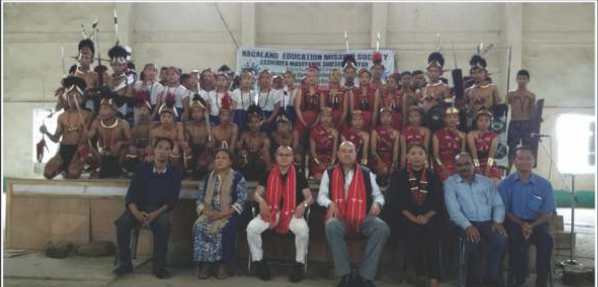
Kala Utsav officials along with the participating students during the district level Kala Utsav Competition 2017 held at GHSS Auditorium, Longleng on 14 th September, 2017.