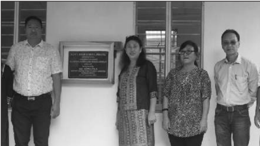
Joint Director, School Education, Rowainla with other officials during the inauguration of a newly constructed building at GHS Dilong, Mokokchung on 12 th September 2017.

building and added that with the improvement in the infrastructure of the school, both teachers and students must re-dedicate themselves so that the school would excel in academic results as well as in other aspects.