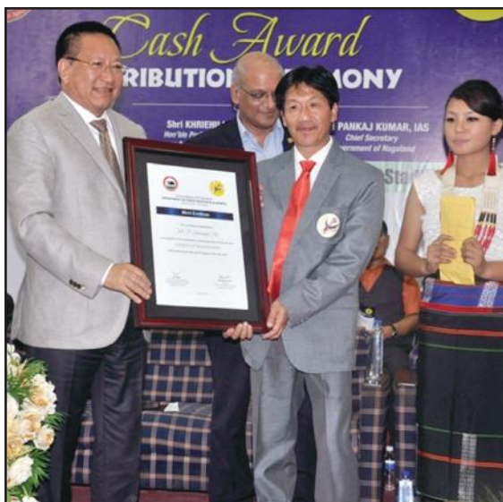
Chief Minister of Nagaland, T.R. Zeliang at the cash award distribution ceremony at Indira Gandhi Stadium, Kohima on 9th August, 2016.