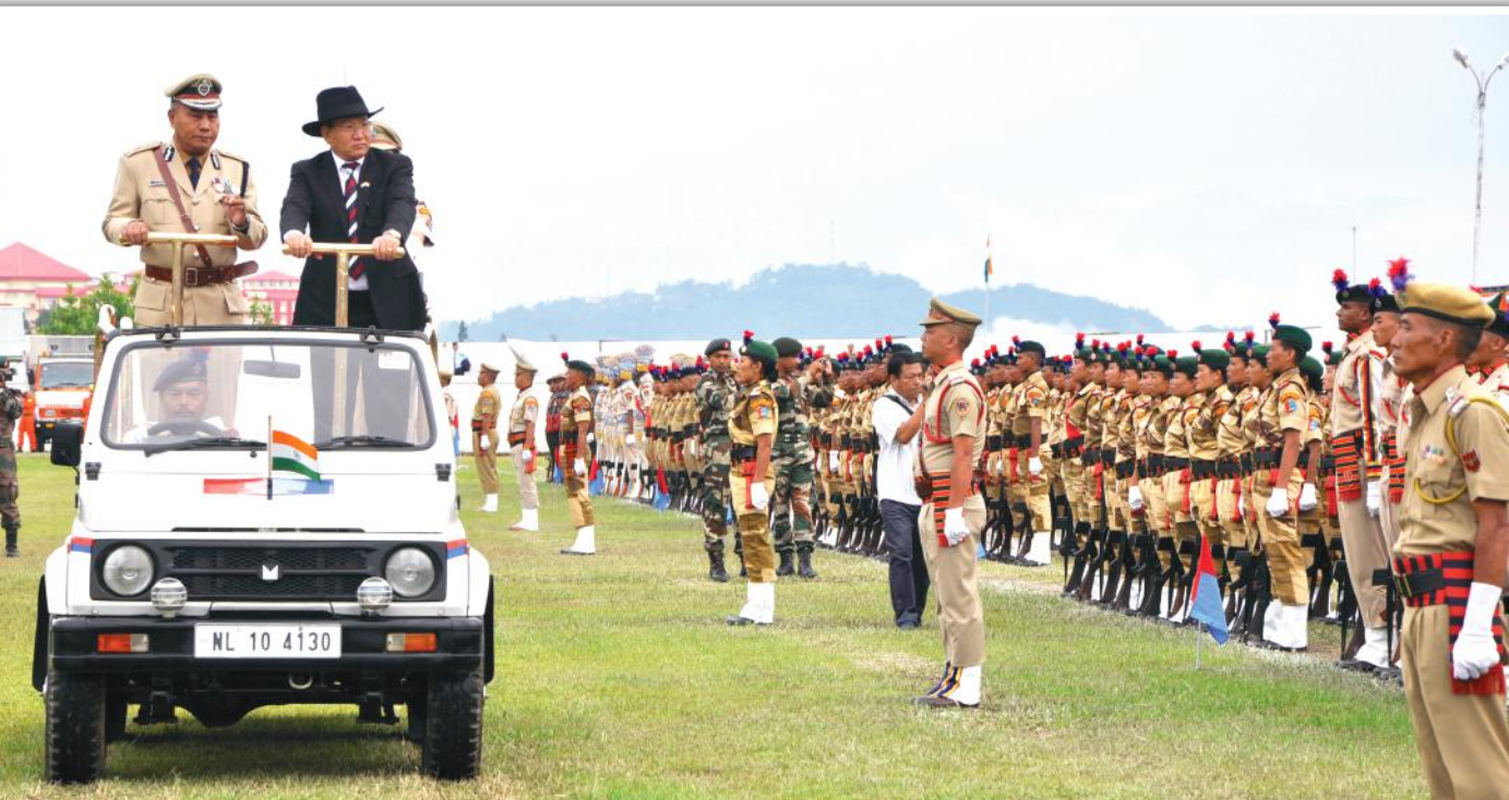
Chief Minister of Nagaland, T.R. Zeliang inspecting the Parade Contingents at Secretariat Plaza, Kohima during the 70th Independence Day celebration on 15th August 2016.