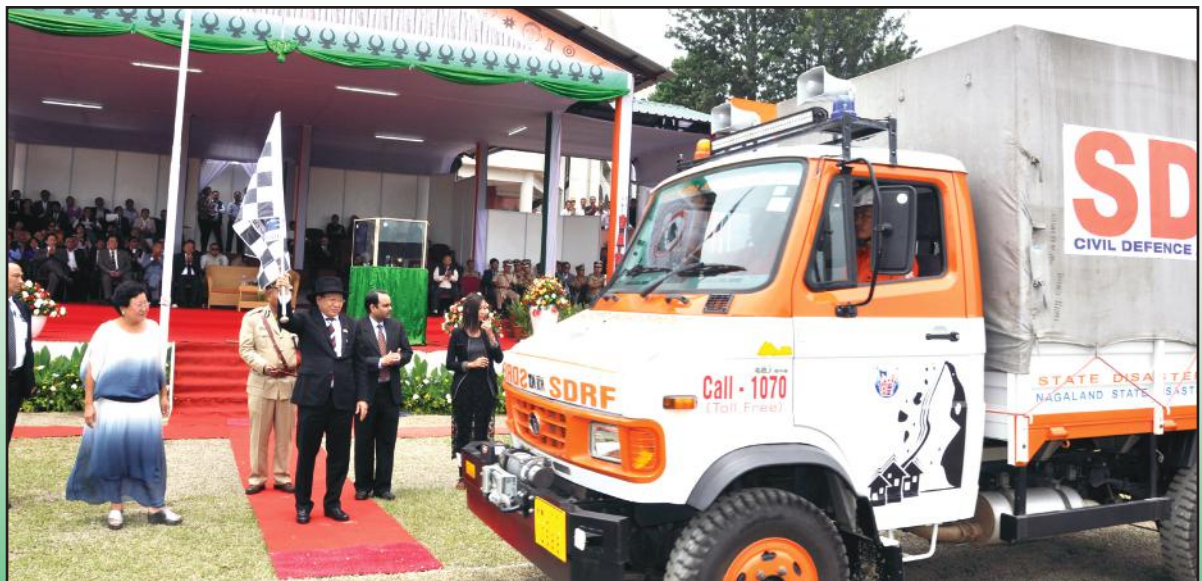
Chief Minister, T.R. Zeliang flagging off SDRF Rescue Operation Vehicles on the occasion of 70th Independence Day 2016 at Secretariat Plaza, Kohima.