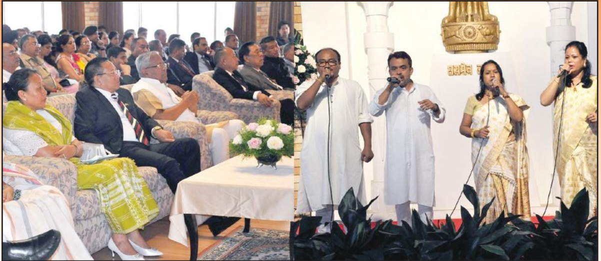
Nagaland Governor P.B. Acharya, Chief Minister T.R. Zeliang and their lady wives witnessing the 'Aazadi 70 years; Yaad Karo Qurbaani' by Song & Drama Division, Ministry of Information & Broadcasting at Raj Bhavan, Kohima on 15th August 2016.