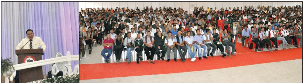
Chief Minister of Nagaland, T.R. Zeliang addressing the State Level Watershed conference and culmination of IWMP Batch-1 on 11 August 2016 at NBCC conventional hall Kohima.

Earlier the Chief Minister released a book titled 'Best practices and success stories of IWMP'. Altogether 247 villages from all over Nagaland attended the programme and various prizes were awarded to individuals with certificate, citations and cash.