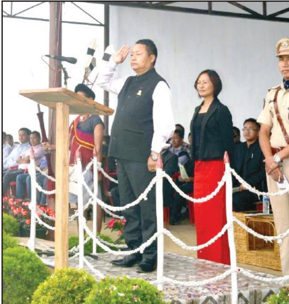
Parliamentary Secretary for Agriculture, Dr. Benjongliba Aier taking salute on the occasion of 70th Independence Day celebration at Pughuboto.

out the Independence Day message where he stated that the state achieved 6.14% growth in agriculture under 11th plan. He stated that the Department aims to achieve the Agriculture growth rate target of 6.50% for food security during 12 plan. Dr. also mentioned that during 2016-17, drip & sprinkler irrigation system will be provided in selected horticulture projects in keeping with the theme "More Crop per Drop" under Pradhan Mantri Krishi Sinchayee Yojana (PMKSY).