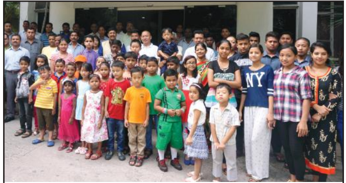
Nagaland House staff celebrating the 70th Indian Independence Day at Nagaland House - 29 Dr. A.P.J. Abdul Kalam Road New Delhi.

Nagaland House Staff celebrated the 70th Indian Independence Day at Nagaland