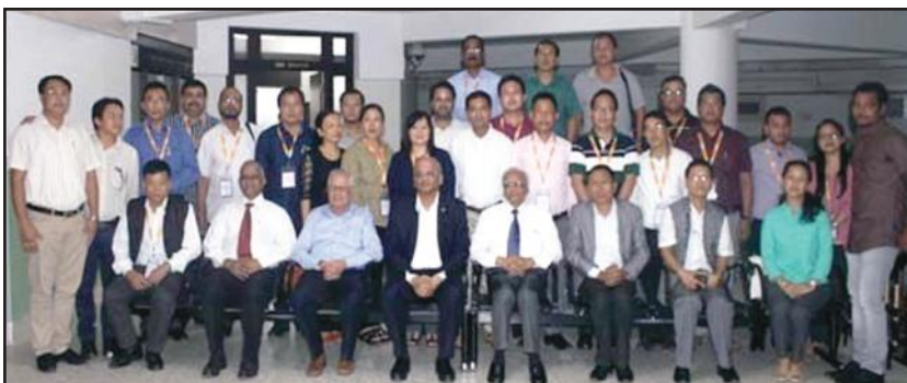
Pankaj Kumar, IAS, Chief Secretary, Government of Nagaland along with participants of Champions Skill Enhancement Programme of North Eastern States.

and Kiphire. To strengthen infrastructure for the Police, construction of the Commissioner of Police, Dimapur and IGP (Int.) Kohima is being taken up during 2016-2017. Initiatives such as installation of 23 CCTV Cameras in the New Market area Dimapur on 29th March 2016 will help and control the crime in