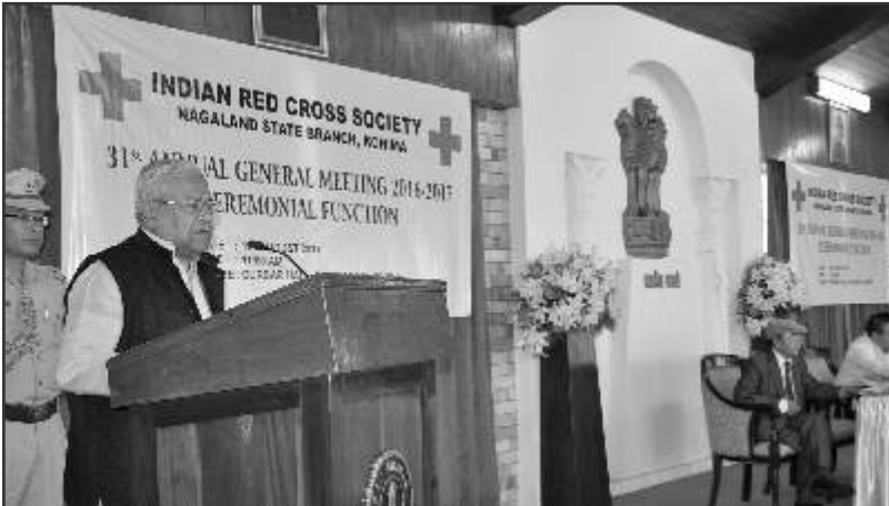
Governor of Nagaland P.B. Acharya addressing the 31 st Annual General Meeting of the IRCSN at the Durbar Hall, Raj Bhavan, Kohima on 19 th August, 2017.

Annual General Meeting of the Indian Red Cross Society, Nagaland State Branch (IRCSN) was held on 19 th August, 2017 at the Durbar Hall, Raj Bhavan, Kohima.