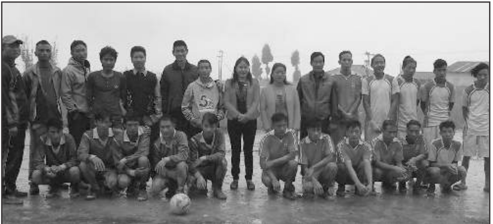
The top three winning teams of the Metemneo Volleyball Tournament at Shamator on 8 th August 2017.