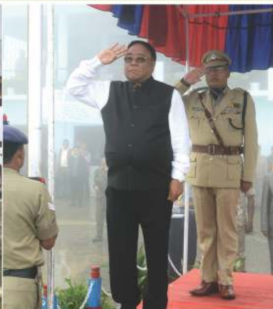
Minister, NH, Political Affairs, G. Kaito Aye gracing the Independence Day celebrations at Zunheboto on 15 th August 2017.