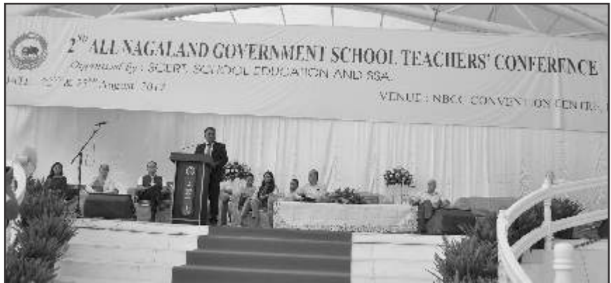
Parliamentary Secretary, Economics & Statistics and SCERT, Er. Kropol Vitsu speaking at the valedictory programme of All Nagaland Government School Teachers Conference on 23 rd August 2017.

The inaugural function of the two-day 2 nd All Nagaland Government School Teachers' Conference was held at NBCC Convention