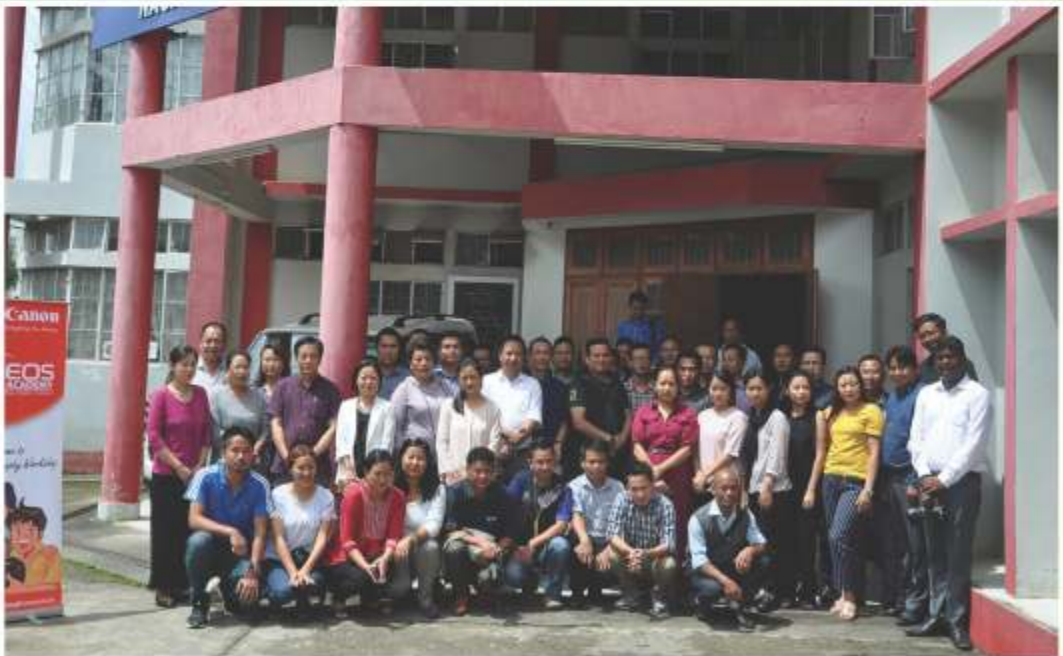
Participants of the one day workshop on DSLR Photography at the Directorate of IPR on 4 th August 2017.