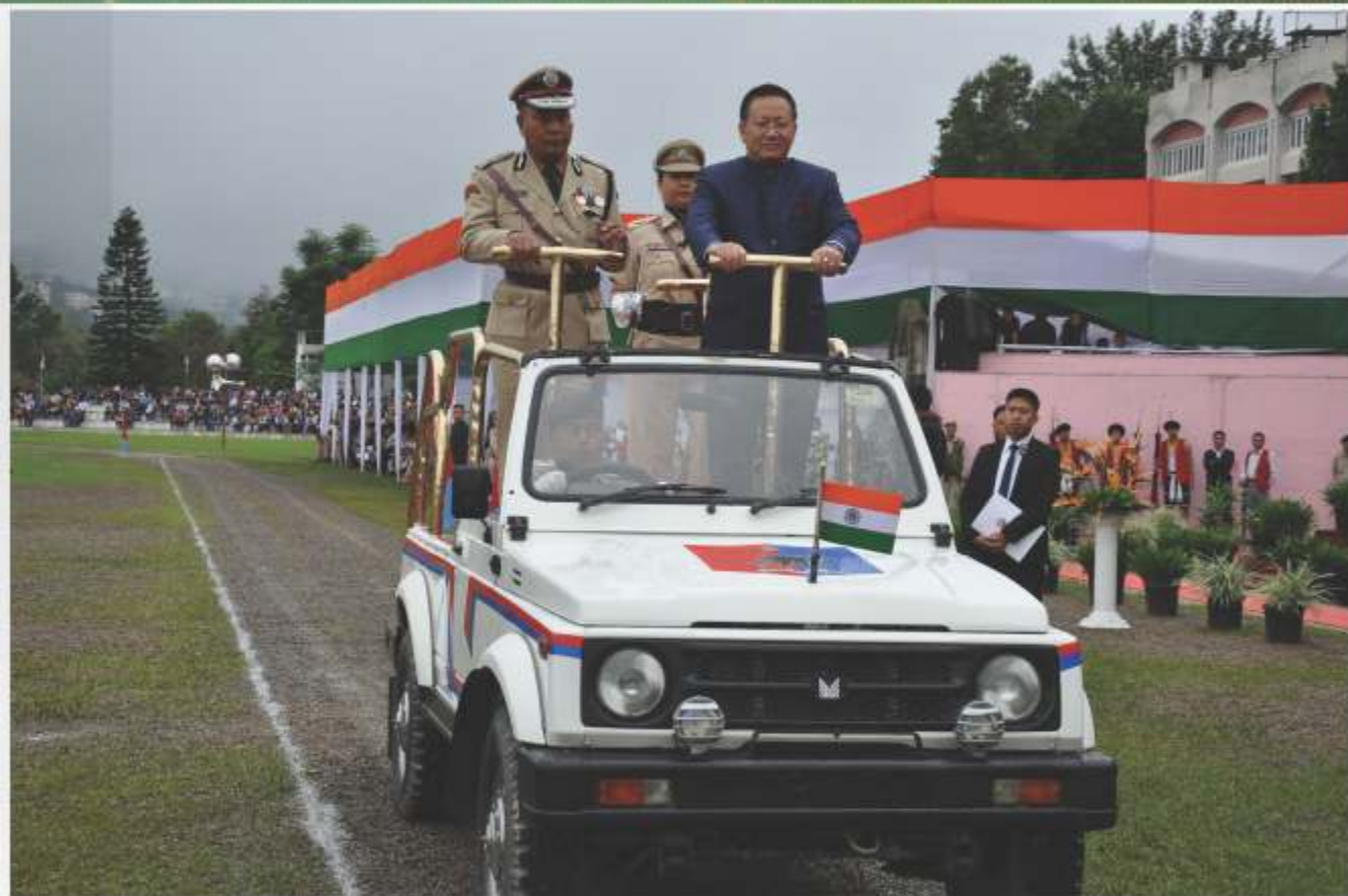
Chief Minister, T.R. Zeliang inspecting the parade at the Independence Day Celebration at Nagaland Secretariat Plaza, Kohima on 15 th August 2017.