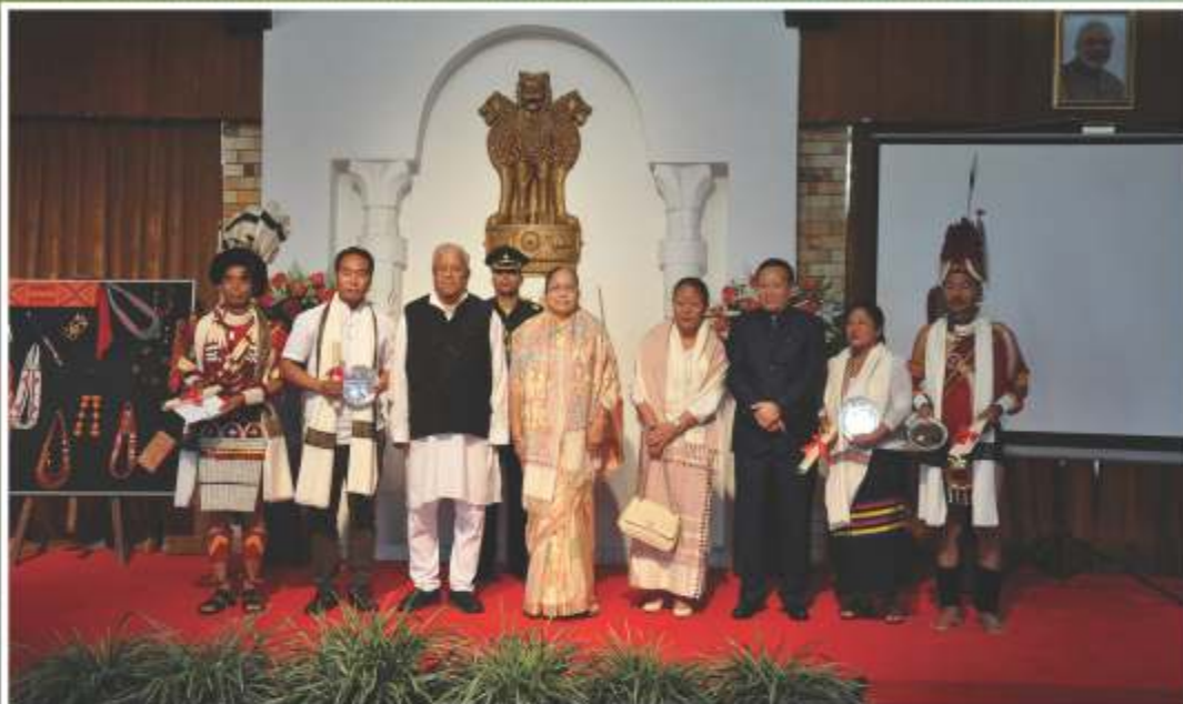
Nagaland Governor, P.B. Acharya; CM, T.R. Zeliang and their wives with the recipients of Governor's Award for Distinction in Art, Music, Literature 2017 at the Durbar Hall Raj Bhavan Kohima on the occasion of Independence Day 15 th August 2017.