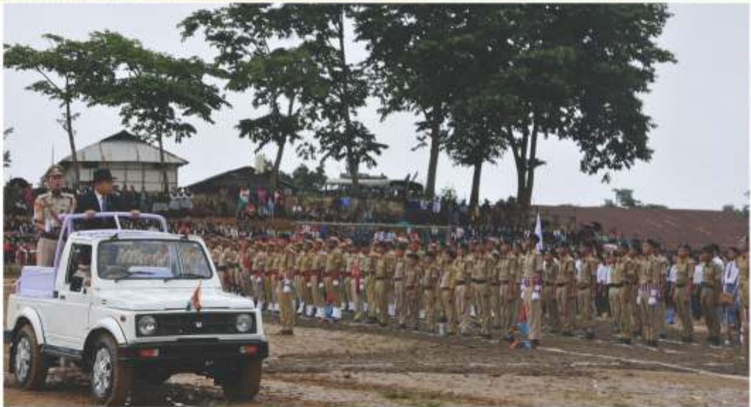
Minister, Environment & Forest, Climate Change, Neiba Kronu gracing the Independence Day celebration at Phek on 15 th August 2017.