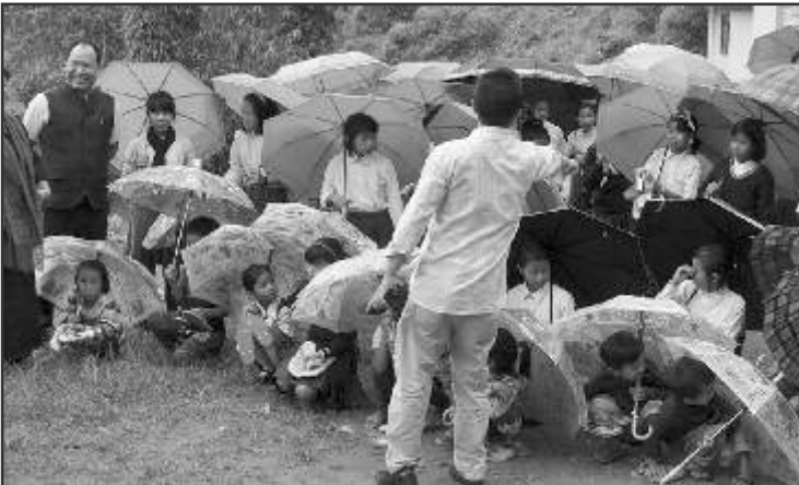
Members of Rotary Club of Kohima visited Schools on the occasion of National Deworming Day on 10 th August 2017.

slippers and snacks to all the students of Kruoliezou Primary School and to class A and B students of Bayavu Middle School, Kohima.