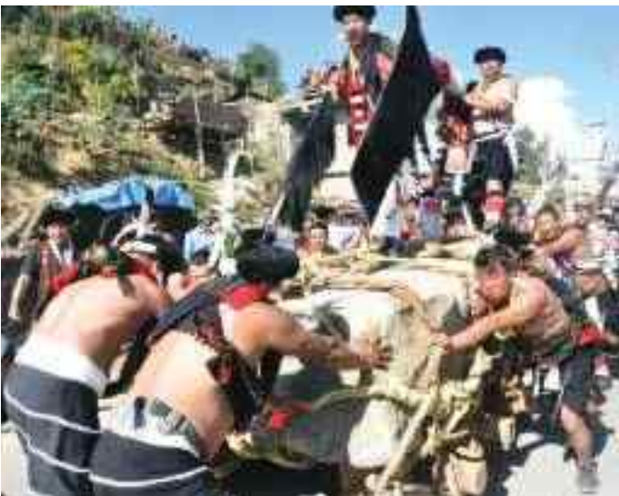
The 25 th Anniversary-cum-Stone Pulling Ceremony coinciding with the 19 th Hornbill Festival was held at Northern Angami Centre, Chiephobozou on 5 th December 2018.