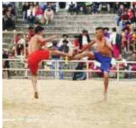
Sumi Kick-fight Akikiti being displayed at Kisama Amphitheatre at the Hornbill Festival, Kisama on 6 th December 2018.