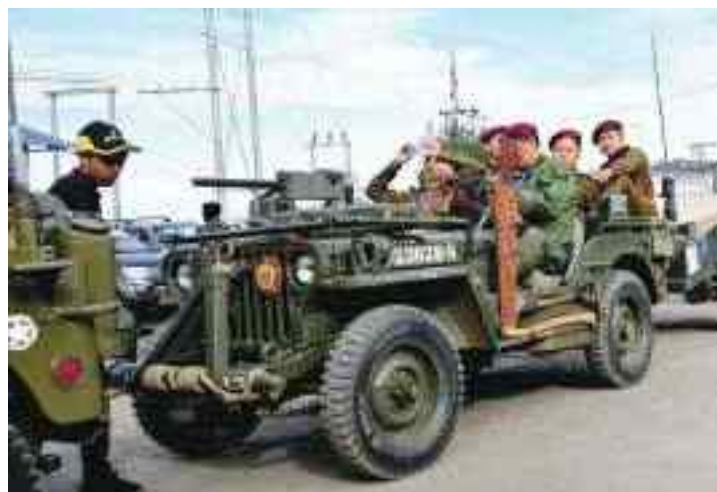
Winner of the World War II Peace Rally at Naga Heritage Village, Kisama on 6 th December 2018.