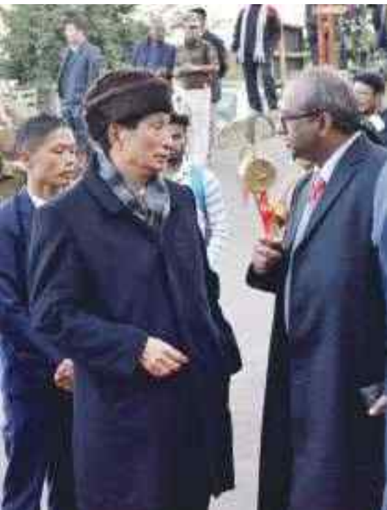
Former Chief Minister and Governor, Dr. S. C. Jamir at the Hornbill Festival at Kisama on 1 st December 2018.