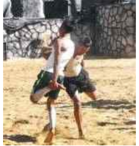
Participants in action during the Cock Fight at the main arena, Kisama on 8 th December 2018.