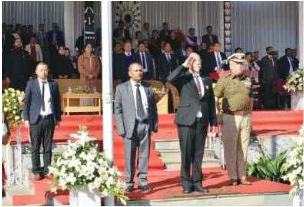
Chief Minister, Neiphiu Rio taking salute on the occasion of the 55 th Statehood Day celebrations at the Secretariat Plaza, Kohima on 1 st December 2018.