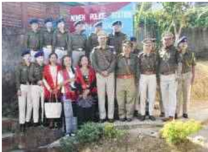
A full fledged Women Police Station was inaugurated at Wokha on 1 st December 2018.