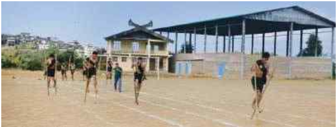
The 1 st State Level Indigenous Games competition was held at IG Stadium, Kohima on 13 th December 2018.