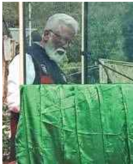
Governor of Mizoram, Kummanam Rajasekhar addressing the gathering during the Cultural Connect event at Kisama on 6 th December 2018.