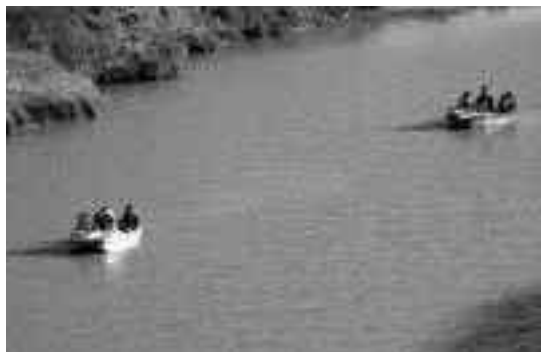
Various activities were held at the 1 st People's Festival at Khezhakeno, as part of the Hornbill Festival held from 1 st to 10 th December 2018.

The Hornbill Off Road Challenge 2018 was held at Zarü river, Mima Village on 4 th December 2018. Altogether 10 participants took part in the event which was organised by Nagaland Adventure and Motor