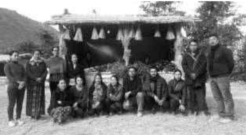
Traditional Evening Park at Kigwema local ground as part of the Hornbill Festival on 3 rd December 2018.