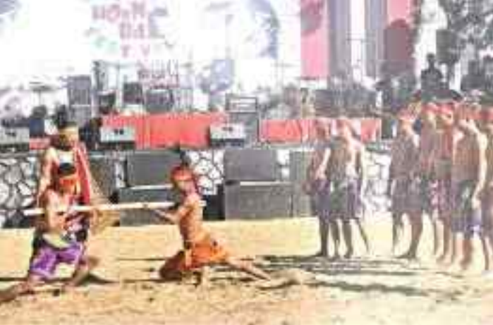
A traditional game being played by the Garo tribe at Kisama on 9 th December 2018.