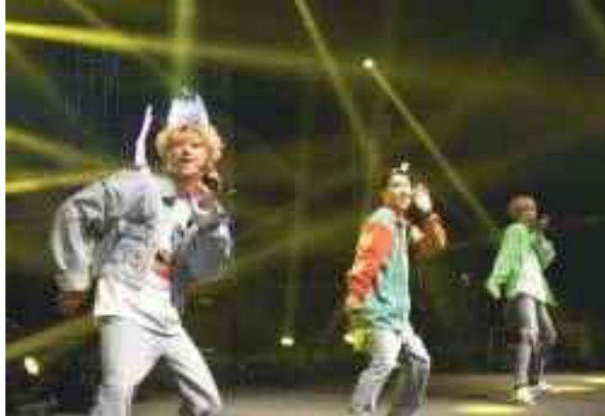
K-Pop MONT performing at the Hornbill International Music Festival at Agri Expo, Dimapur on 3 rd December 2018.