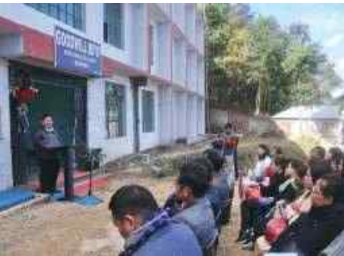
Minister, HE & TE, Temjen Imna Along speaking at the inaugural of the 100 bedded Goodwill Boys Hostel at Kohima College on 11 th December 2018.