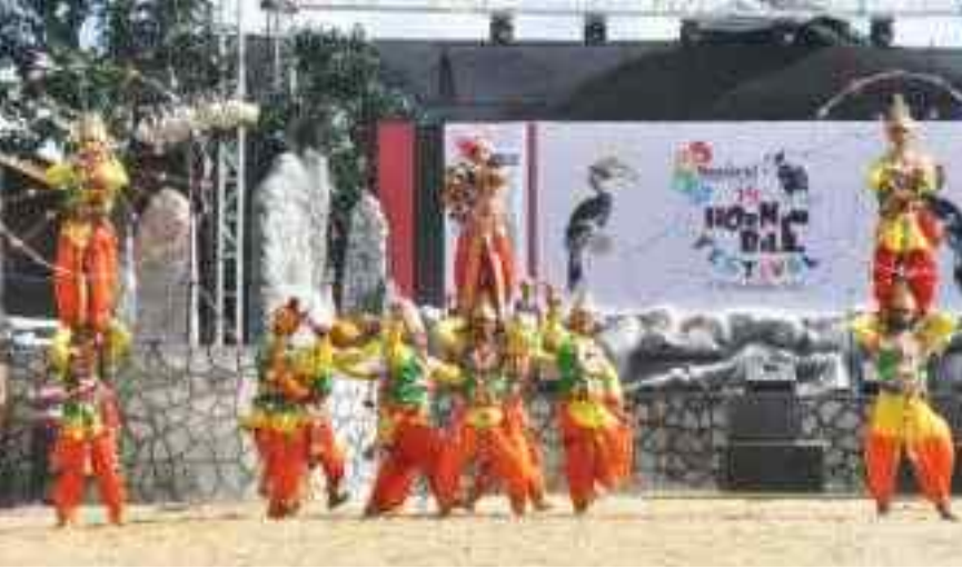
Baredi Dance performed by the cultural troupe from Madhya Pradesh during the cultural extravaganza at Kisama on 2 nd December 2018.