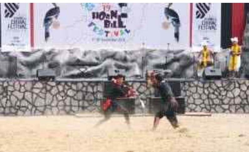
Thang-ta martial art performed by Manipur troupe during the cultural extravaganza at Kisama on 2 nd December 2018.