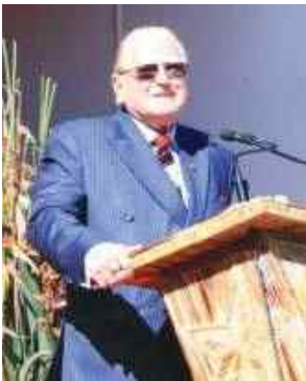
ED Member of Legislative Council, Australia, Rev. Fred Nile delivering a speech during the cultural extravaganza, Hornbill Festival on 4 th December 2018.