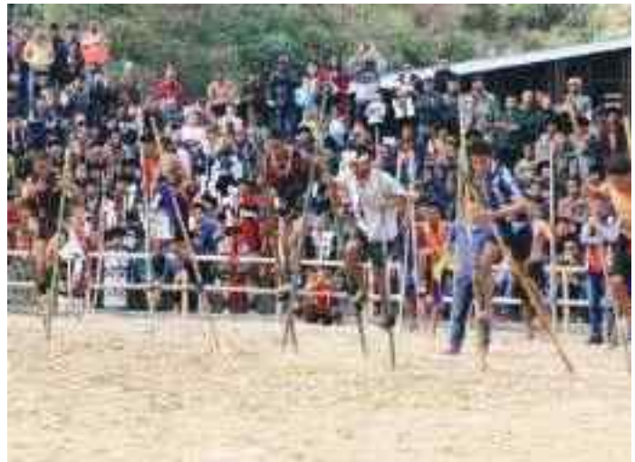
Participants from different tribes partaking in the Stilt Bamboo Race at main arena, Kisama on 5 th December 2018.