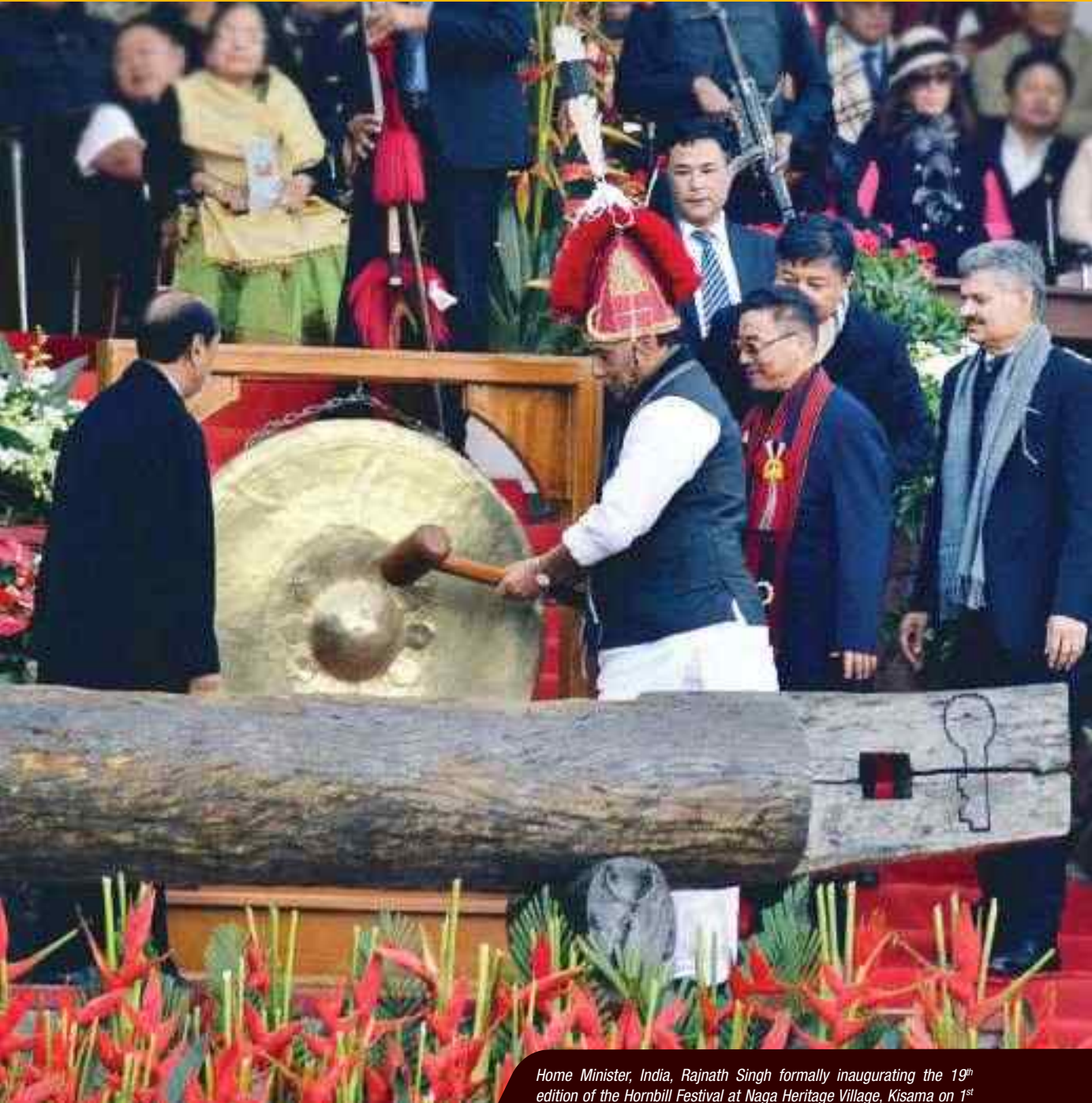
Home Minister, India, Rajnath Singh formally inaugurating the 19 th edition of the Hornbill Festival at Naga Heritage Village, Kisama on 1 st December 2018.