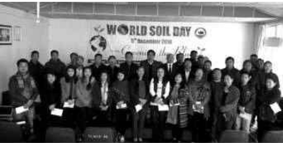
Department of Soil and Water Conservation observed the World Soil Day on 5 th December 2018 at the Directorate conference hall, Kohima.

Department of Soil & Water Conservation observed World Soil Day on 5 th December 2018 at the Directorate conference hall. It focused attention on the importance of healthy soil and to advocate sustainable management of soil resources. The day was formally observed as part of global awareness raising platform for sustainable development and reducing greenhouse gas emission.