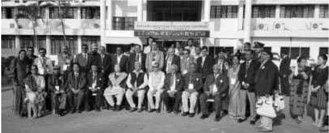
Governor, P. B. Acharya and officials during the Silver Jubilee Convention and National Conference VIBCON at ICAR-NRC on Mithun, Medziphema on 13 th December 2018.

ICAR-National Research Centre on Mithun and Indian Society of Veterinary Immunology and Biotechnology held the silver jubilee convention and national conference VIBCON on 'Innovative Biotechnology Approaches for Improving Animal Health and Productivity' at ICAR-NRC on Mithun Medziphema on 13 th December 2018.