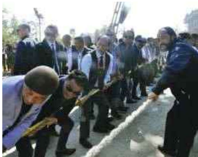
Chief Minister, Neiphiu Rio, Deputy CM, Y. Patton and other legislators and officials taking part in the Stone Pulling Ceremony.