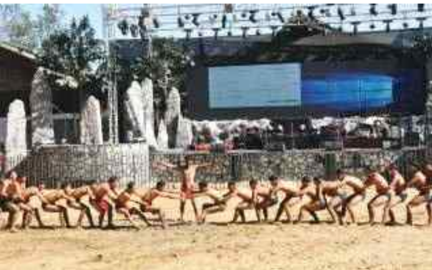
The Sumi cultural troupe demonstrating the Ikha Sunhei Ikha Tashe (Tug of War) indigenous game at Kisama on 10 th December 2018.