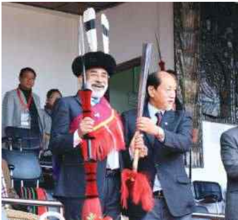
Union Minister, Tourism, K.J. Alphons was presented with traditional Naga dao and spear by Chief Minister, Neiphiu Rio at the Hornbill Festival on 5 th December 2018.