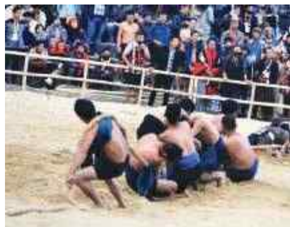
Ao and Khamniungan men enagaging in the final round of Tug of War competition at Kisama on 6 th Decemeber 2018.