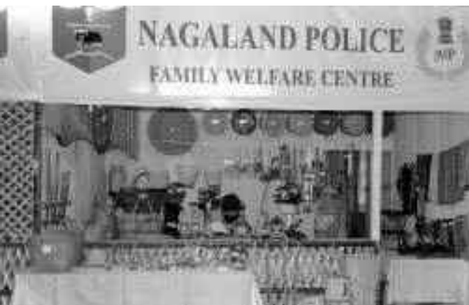
Nagaland Police Welfare Centre at the Naga Heritage Village, Kisama.

Among the hundreds of stalls at the Heritage Village, Kisama, one stall stood out and made a difference in the lives of many. The Nagaland Police Welfare Centre stall, set up under the initiative of Nagaland Police showcased a number of handmade products ranging from hand woven baskets to colourful ladies jewellery and collectible souvenirs made by the jawans themselves from various battalions spread across the state. The money earned from the sale of the items displayed goes to the Nagaland Police Welfare Fund which in turn is used to help the families and children of Nagaland Police personnel in times of need. The Nagaland Police Welfare Fund has made a huge difference in the lives of many police personnel by providing financial aid.