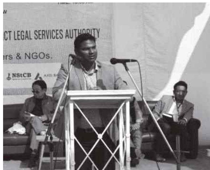
DC Dimapur, Sushil Kumar Patel, IAS speaking at the Mega Legal Services camp at DDSC stadium Dimapur on 15 th December 2018.

Highlights of the program included short play on Legal Awareness by Hill Theatre and special song by Living Bread. More than 40 departments including the banks and service providers put up their stalls and offered services and assisted the citizens.