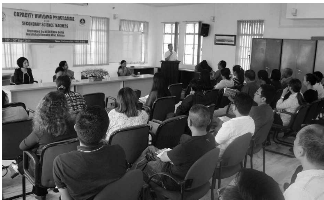
Five- Day Capacity Building Programme for Secondary Science Teachers of selected schools underway at NBSE Conference Hall, Kohima on 16 th September 2019.

the occasion as the Guest Speaker. He exhorted the science teachers to extract the most from the training and urged them to be sincere and creative