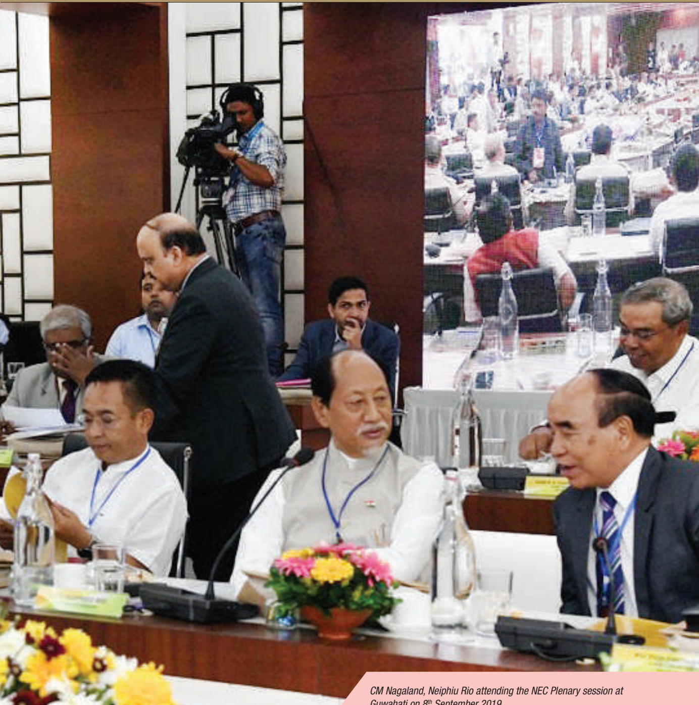
CM Nagaland, Neiphiu Rio attending the NEC Plenary session at Guwahati on 8 th September 2019.