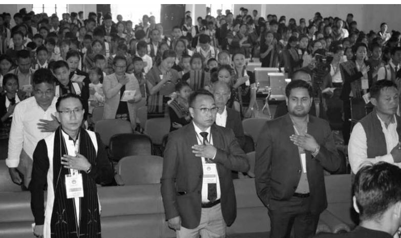
The Lotha Students' Union organized the 2 nd Cultural-cum-Literacy festival at Town Hall, Wokha on 23 rd September 2019.