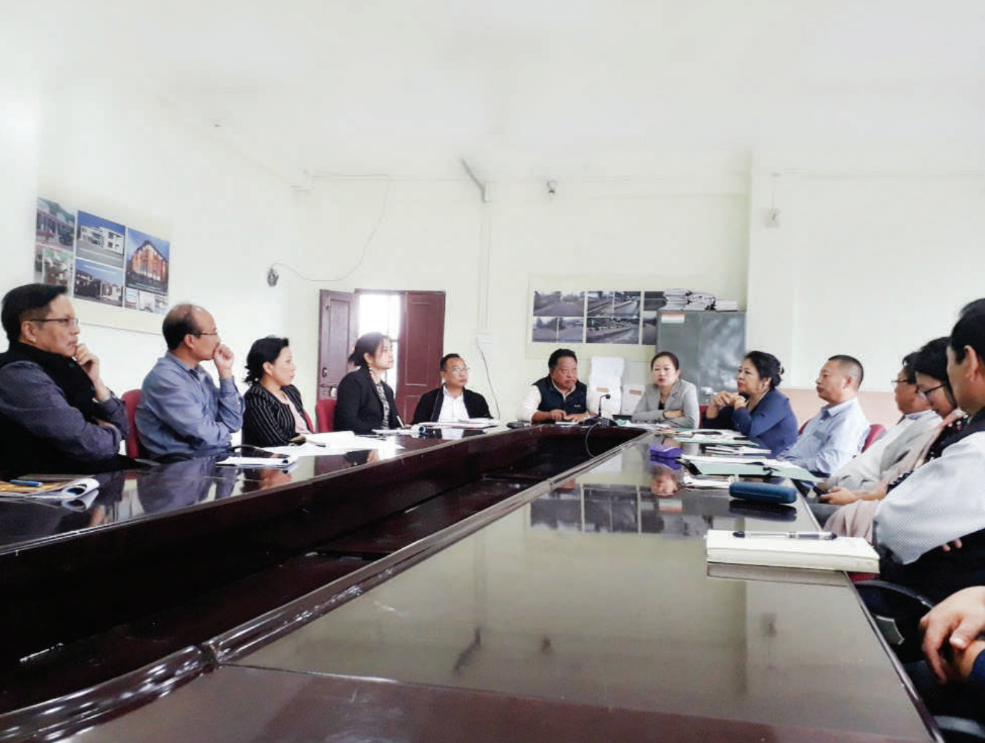
The 3 rd meeting of the Inter-Department committee on “Swachhata Hi Seva” was held in the Conference Room of Urban Development Directorate, Kohima on 26 th September 2019.