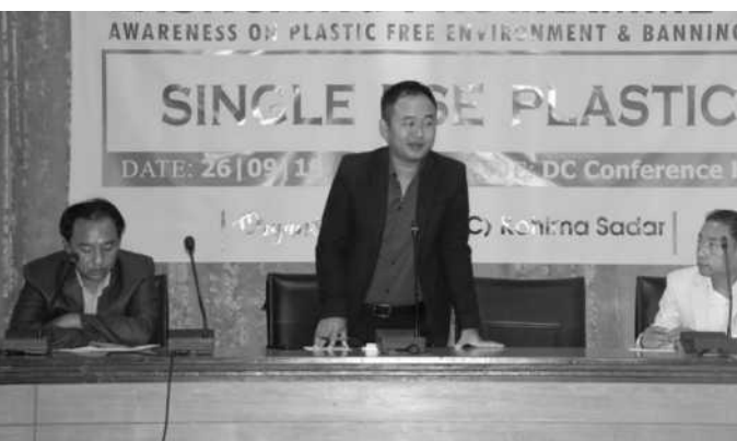
SDO(C) Kohima Sadar, Longasen Lotha speaking at the Awareness Programme on Plastic Free Environment and ban of single use plastic at DC's Conference Hall, Kohima on 26 th September 2019.

An awareness programme, organized by the office of the SDO(C), Kohima Sardar for the three villages under Kohima Sardar jurisdiction, on plastic free environment and banning of single use plastic