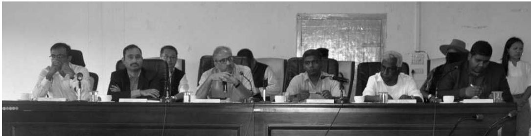
Multi-Disciplinary Committee Team meeting with the Heads of Offices at DC's Conference Hall, Mon on 10 th September 2019.