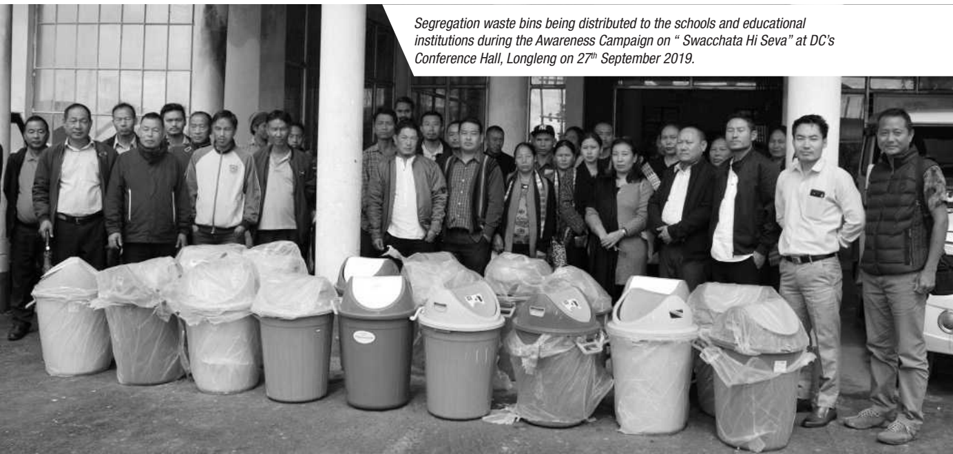
Segregation waste bins being distributed to the schools and educational institutions during the Awareness Campaign on "Swachhata Hi Seva" at DC's Conference Hall, Longleng on 27 th September 2019.

EAC Longleng HQ, Ihoilung Chuilo, Nodal Officer, Swachhata Hi Seva spoke on cleanliness is Service. He spoke on harmful chemical contains of plastic in the food, contamination of ground water by plastics, degradable age of various types of plastic and facts and figures of plastic waste in our country and its effect to the environment. Ihoilung also asserted that mankind has created a huge gap with our nature and it's high time to protect our mother nature. Therefore, he appealed to the gathering to create maximum awareness to the community and extend