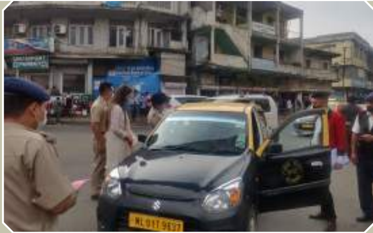
To stop the spread of COVID-19 in the State, COVID-19 vaccination drive at Naginimora, anti-COVID-19 campaign at Shamator, and enforcement drive on wearing of face mask at Kohima, were carried out in April 2021.