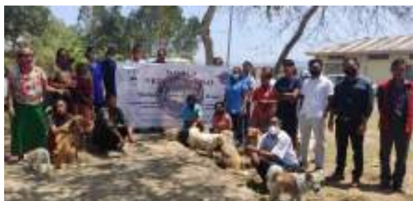
Anti-rabies vaccination was carried out on World Veterinary Day at Wokha on 24 th April 2021.