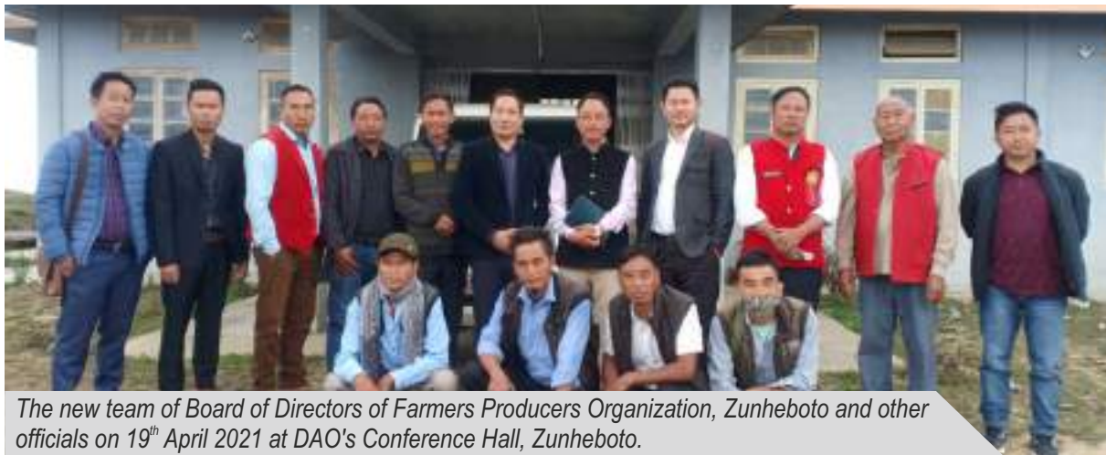
The new team of Board of Directors of Farmers Producers Organization, Zunheboto and other officials on 19 th April 2021 at DAO's Conference Hall, Zunheboto.