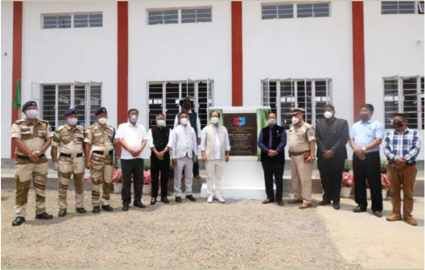
Chief Minister, Neiphiu Rio along with Deputy Chief Minister, Y. Patton and other officials during the inauguration of 11 th NAP (IR) Battalion Headquarter, Aboi, Mon on 29 th April 2021.