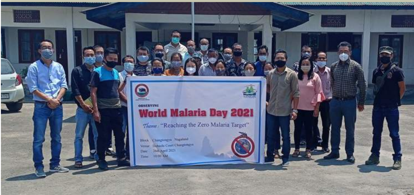
Resource persons and participants during the World Malaria Day which was observed under the theme 'Reaching the Zero Malaria Target' at Dobashi Court, Changtongya on 26 th April 2021.