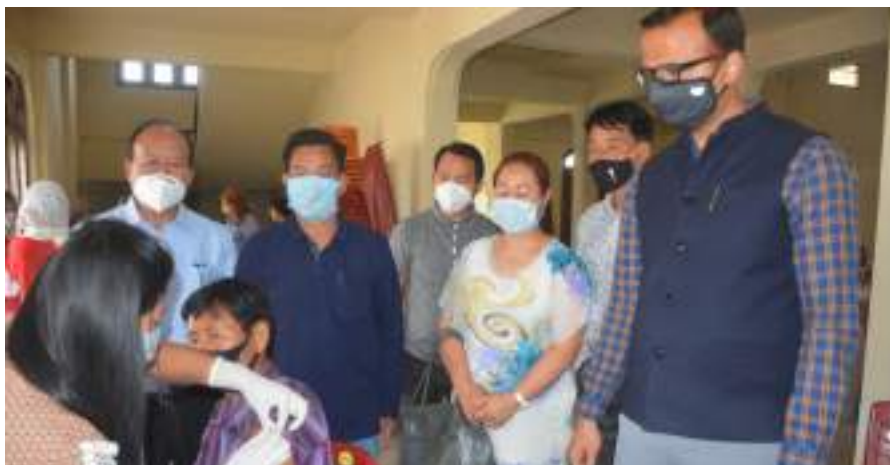
A beneficiary receiving Covishield vaccine in the presence of DC & Chairman, Tuensang District Task Force (DTF) and DTF members at Tuensang on 13 th April 2021.