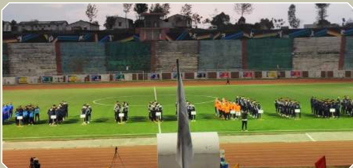
Players lined up during the inaugural programme of the 21 st Dr. T. Ao Inter-district Football Championship 2021 held at Indira Gandhi Stadium, Kohima on 12 th April 2021.