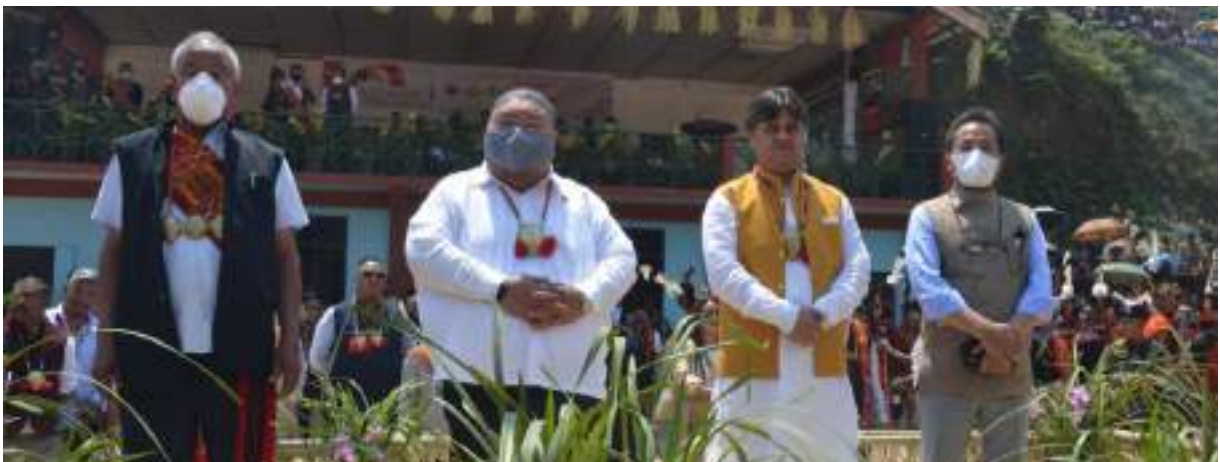
Minister of Higher Education and Tribal Affairs, Temjen Imna Along, who was the Special Guest at the Konyak Aoleang Festival along with other dignitaries during the celebration at Local Ground, Mon on 6 th April 2021.