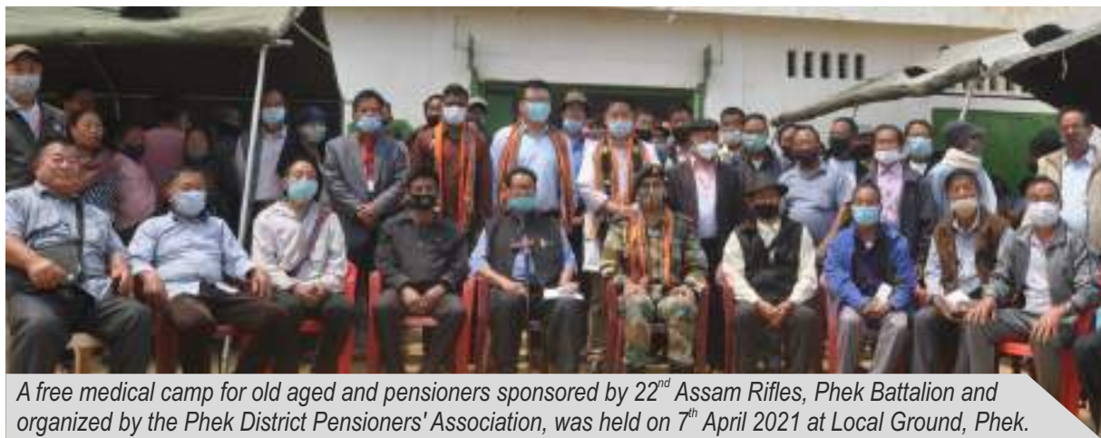
A free medical camp for old aged and pensioners sponsored by 22 nd Assam Rifles, Phek Battalion and organized by the Phek District Pensioners' Association, was held on 7 th April 2021 at Local Ground, Phek.

A one-day free medical camp for old aged and pensioners under the theme 'Op Sadbhavana' was conducted on 7 th April 2021 at Local Ground, Phek town. The medical camp was sponsored and conducted by the 22 nd Bais Bahadur Assam Rifles (AR), Phek Battalion and organized by the Phek District Pensioners' Association (PDPA).