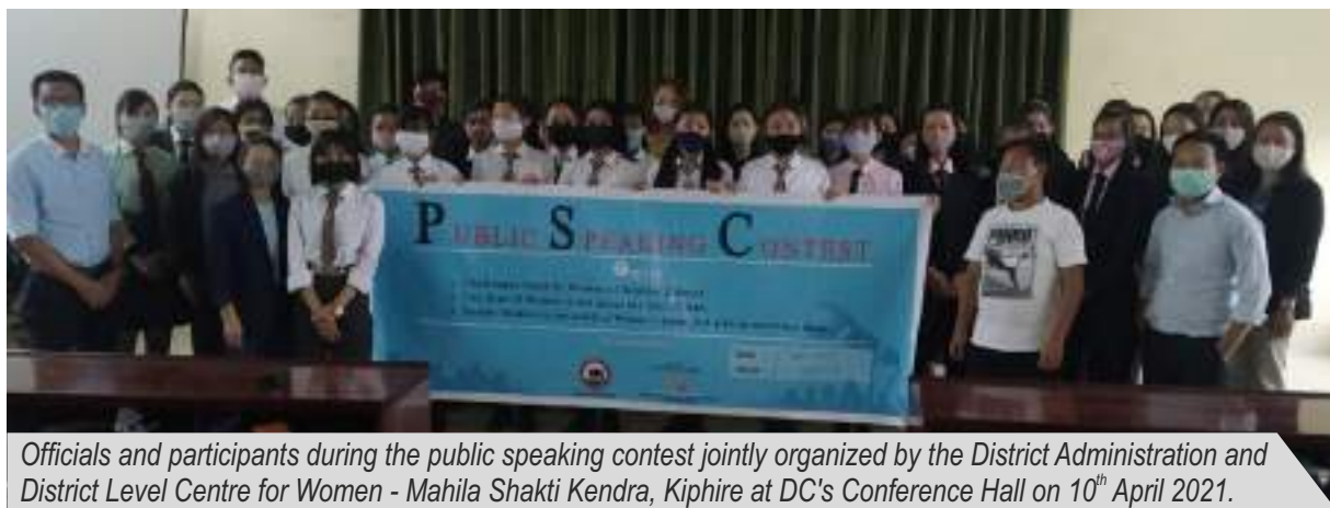
Officials and participants during the public speaking contest jointly organized by the District Administration and District Level Centre for Women - Mahila Shakti Kendra, Kiphire at DC's Conference Hall on 10 th April 2021.