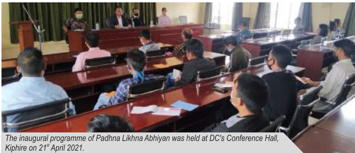
The inaugural programme of Padhna Likhna Abhiyan was held at DC's Conference Hall, Kiphire on 21 st April 2021.

The inaugural programme of Padhna Likhna Abhiyan was conducted at Deputy Commissioner's (DC) Conference Hall, Kiphire on 21 st April 2021.