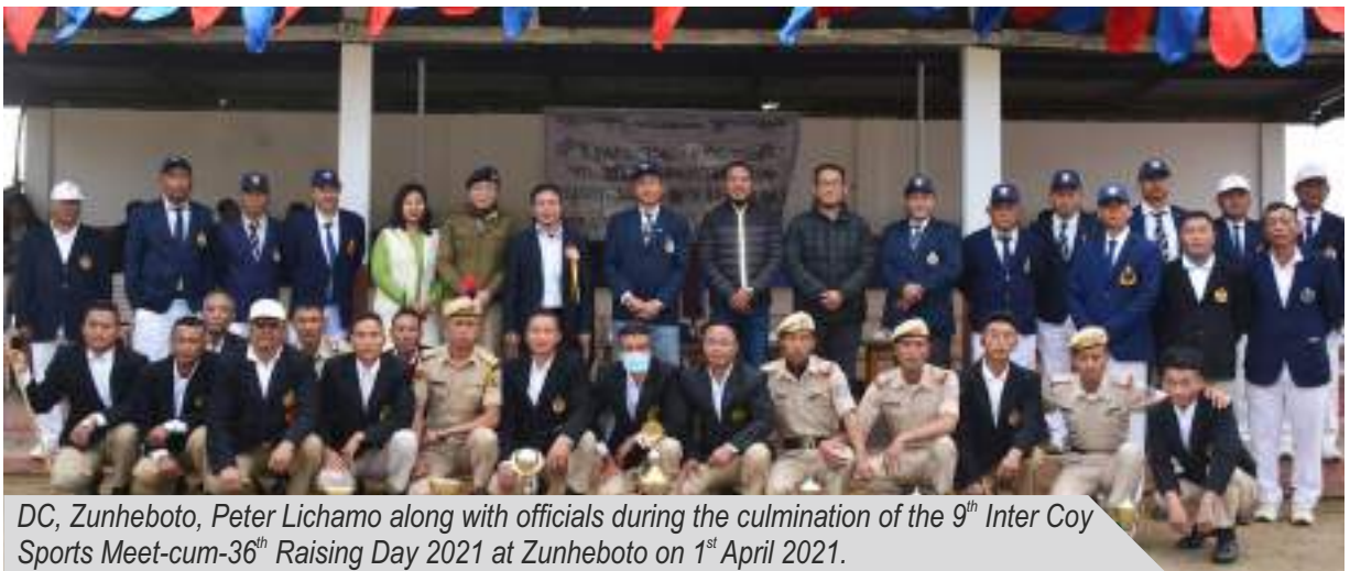
DC, Zunheboto, Peter Lichamo along with officials during the culmination of the 9 th Inter Coy Sports Meet-cum-36 th Raising Day 2021 at Zunheboto on 1 st April 2021.

The 8 th NAP, Dynamic Eight Battalion, Naltoqa, Zunheboto District culminated its 9 th Inter Coy Sports Meet-cum-36 th Raising Day 2021 on 1 st April 2021 with Deputy Commissioner (DC), Zunheboto, Peter Lichamo gracing the closing ceremony as Guest of Honour.