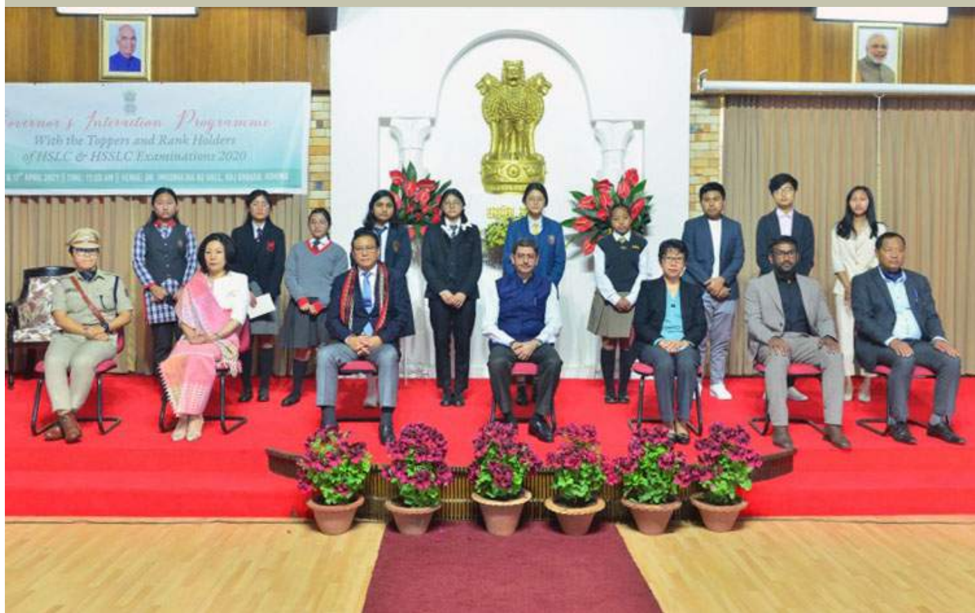
Governor, R N Ravi and other officials with rank holders and toppers of the High School Leaving Certificate (HSLC) Examination, 2020 during an interaction programme held at Dr. Imkongliba Ao Hall, Raj Bhavan, Kohima on 16 th April 2021.