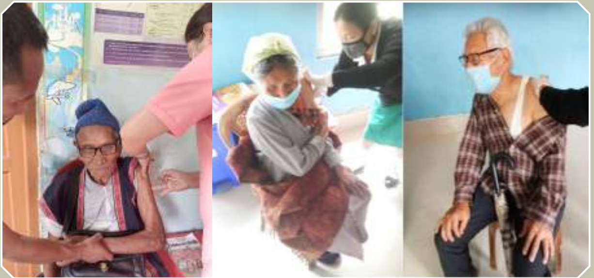
A 101 year old man getting the first dose of COVID-19 vaccine at Tiru, Mon, and elderly persons taking the COVID-19 vaccine at Kohima on 18 th April 2021.