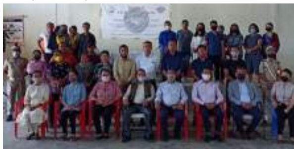
Officials and participants during the World Veterinary Day celebration at Drill Hall, 4 th NAP Thizama, Kohima on 24 th April 2021.