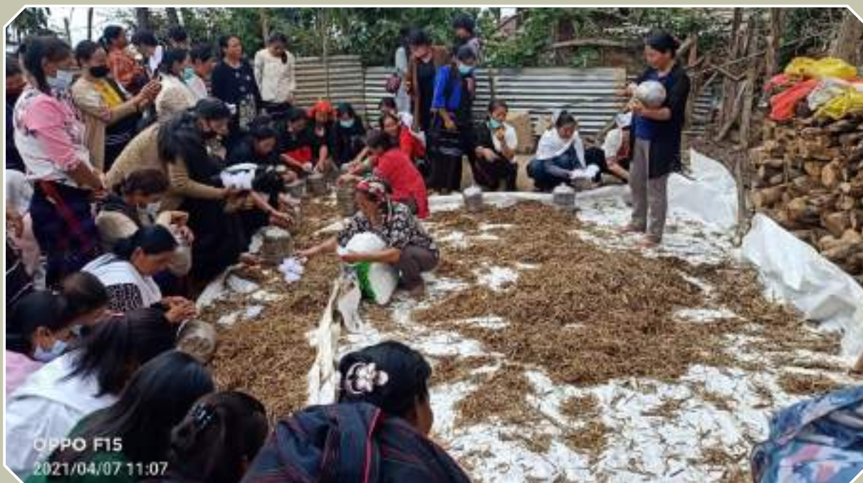
Training on mushroom farming was imparted to around 100 women at Noklak on 7 th April 2021.