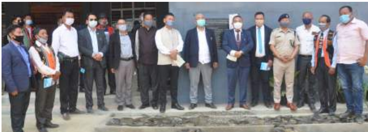
Minister for Planning & Co-ordination, Land Revenue and Parliamentary Affairs, Neiba Kronu along with officials during the inauguration of the first VDB building at Kutsapo village, Phek on 27 th April 2021.

Phek was inaugurated at Kutsapo village on 27 th April 2021 by Minister for Planning & Co-ordination, Land Revenue and Parliamentary Affairs, Neiba Kronu.