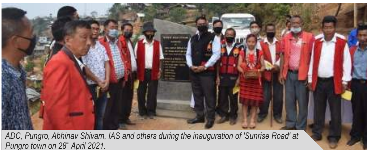
ADC, Pungro, Abhinav Shivam, IAS and others during the inauguration of 'Sunrise Road' at Pungro town on 28 th April 2021.

The 'Sunrise Road' at Pungro town was inaugurated on 28 th April 2021 by ADC, Pungro, Abhinav Shivam, IAS.