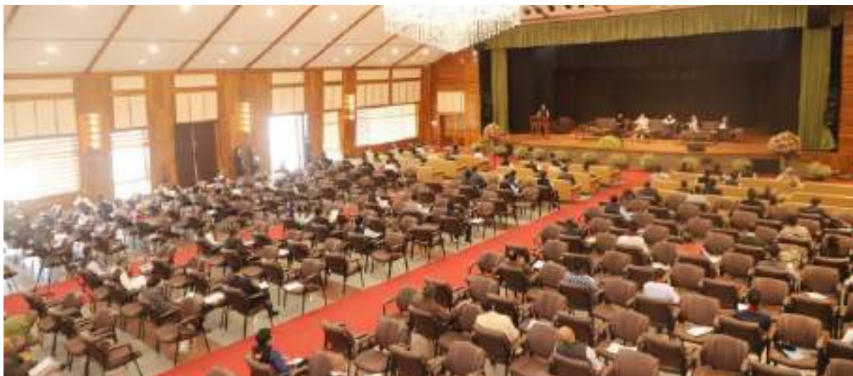
The consultative meeting with Civil Society Organisations and Tribal Hohos on Register for Indigenous Inhabitants of Nagaland (RIIN) was held at the Chief Minister's Residential Complex, Kohima on 16 th April 2021.