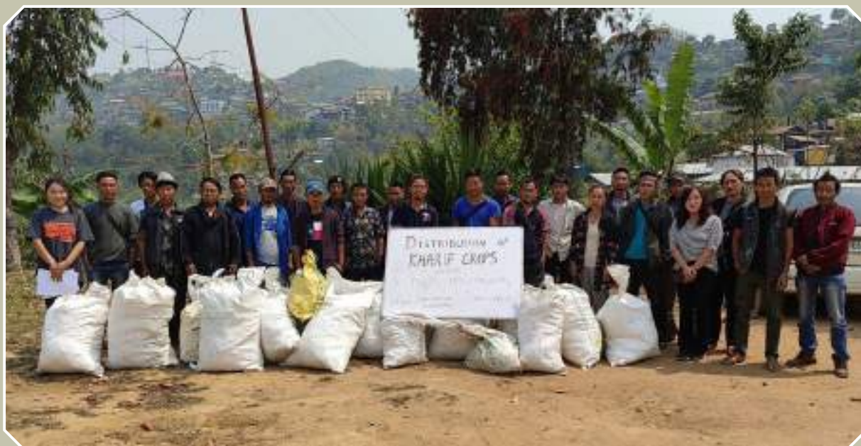
Kharif seeds were distributed to the project villages under FOCUS-Nagaland at the District Agriculture Officer's Office, Longleng on 29 th March 2021.