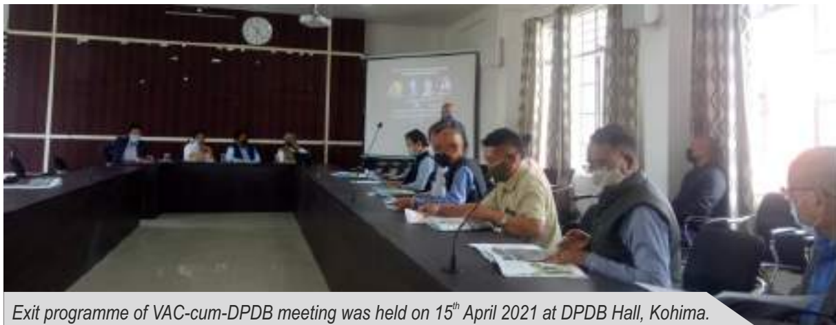
Exit programme of VAC-cum-DPDB meeting was held on 15 th April 2021 at DPDB Hall, Kohima.