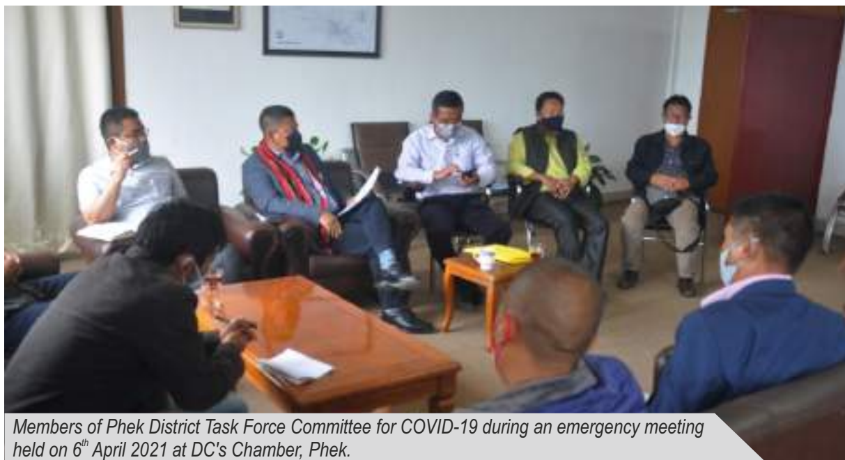
Members of Phek District Task Force Committee for COVID-19 during an emergency meeting held on 6 th April 2021 at DC's Chamber, Phek.

The Phek District Task Force Committee for COVID-19 held an emergency meeting on 6 th April 2021 at Phek Deputy Commissioner's (DC) Chamber.