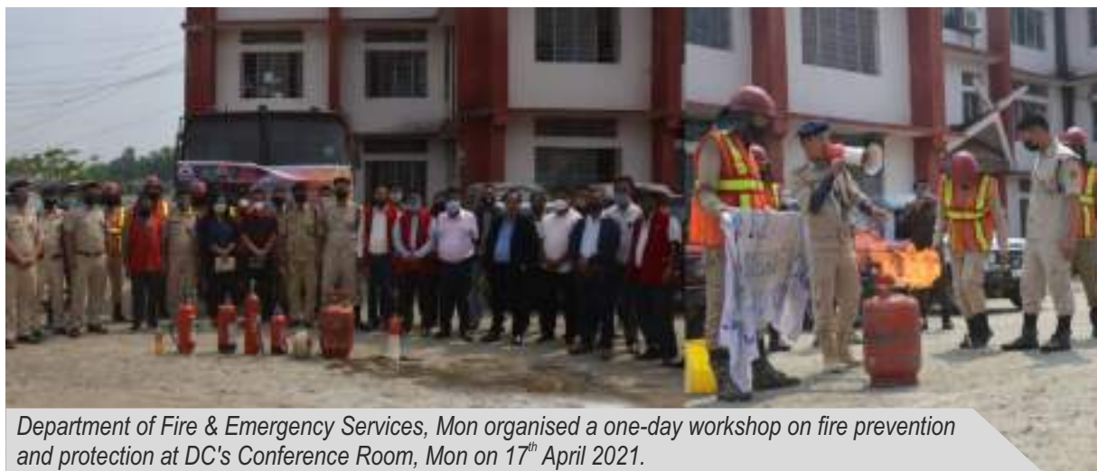
Department of Fire & Emergency Services, Mon organised a one-day workshop on fire prevention and protection at DC's Conference Room, Mon on 17 th April 2021.

Department of Fire & Emergency Services, Mon on 17 th April 2021 organised a one day workshop on fire prevention and protection at the Conference Room of the Office of Deputy Commissioner (DC), Mon as part of the Fire Service Week, being observed nationwide from 14 th - 20th April 2021 with the theme, 'Maintenance of Fire Safety Equipment is Key to Mitigate Fire Hazards.'