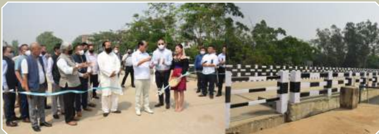
Chief Minister, Neiphiu Rio inaugurating the RCC T- Beam Bridge over Dhansiri River, Dimapur on 13 th April 2021.