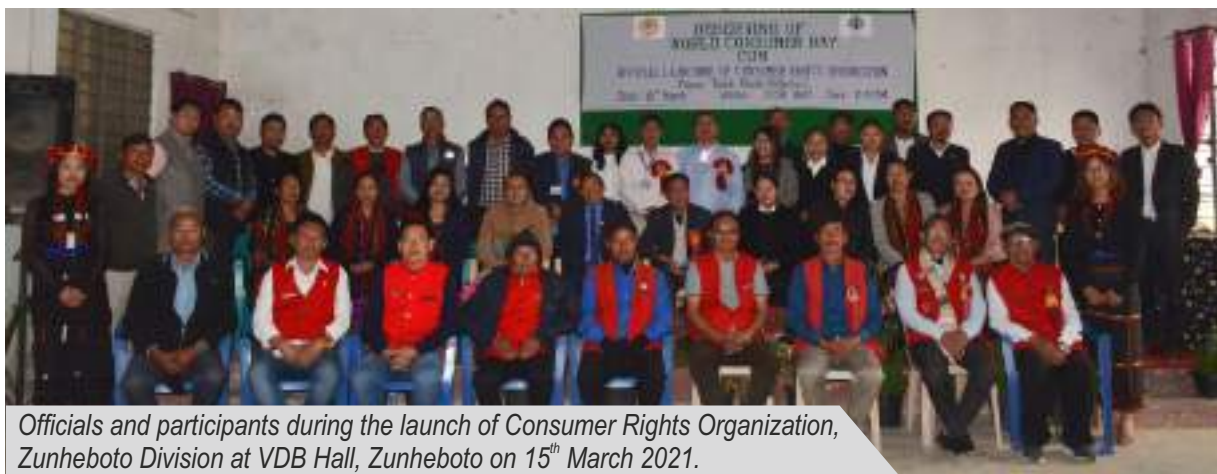
Officials and participants during the launch of Consumer Rights Organization, Zunheboto Division at VDB Hall, Zunheboto on 15 th March 2021.