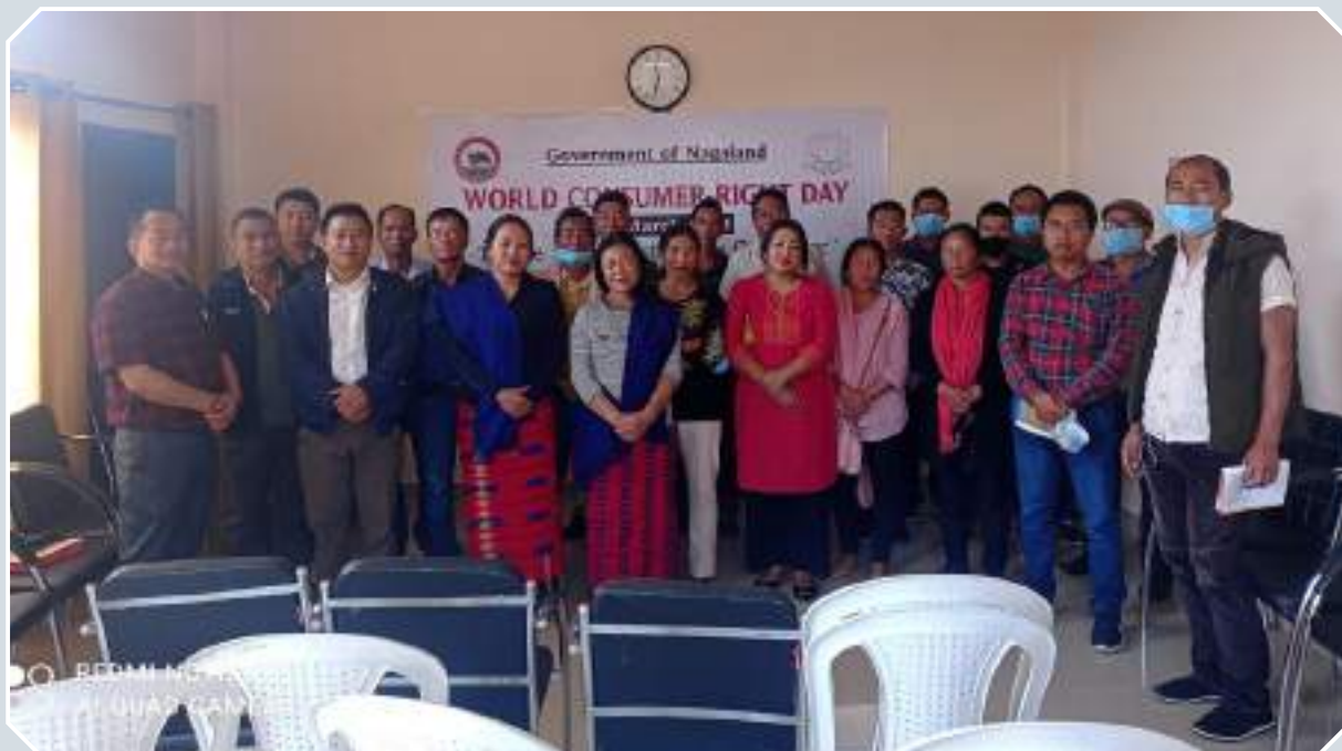
Participants of World Consumer Rights Day which was observed at Changtongya town on 15 th March 2021.