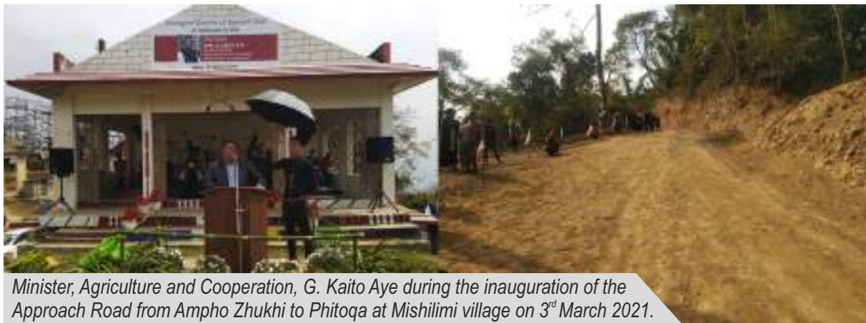
Minister, Agriculture and Cooperation, G. Kaito Aye during the inauguration of the Approach Road from Ampho Zhukhi to Phitoqa at Mishilimi village on 3 rd March 2021.

Minister for Agriculture and Cooperation, G. Kaito Aye inaugurated the Approach Road from Ampho Zhukhi to Phitoqa at Mishilimi village on 3 rd March 2021.