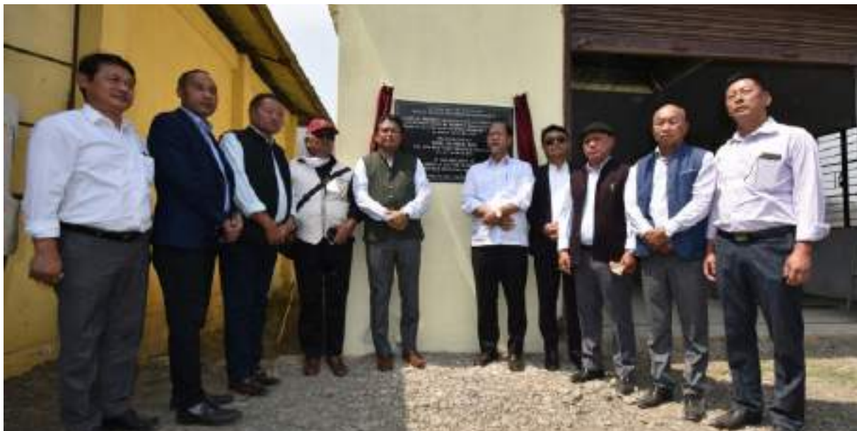
Chief Minister, Neiphiu Rio along with his colleagues and officials during the commissioning of the new water supply project for Kohima town at Water Treatment Plant Site, Mima on 26 th March 2021.

beneficiaries to take care of the Water Treatment Plant.