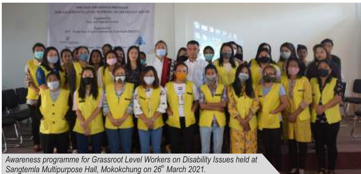
Awareness programme for Grassroot Level Workers on Disability Issues held at Sangtemla Multipurpose Hall, Mokokchung on 26 th March 2021.

The Advisor expressed his gratitude to the District Administration headed by the Deputy Commissioner, police forces, public leaders from various organizations and the people from the District. He also expressed his condolences to the bereaved family members.