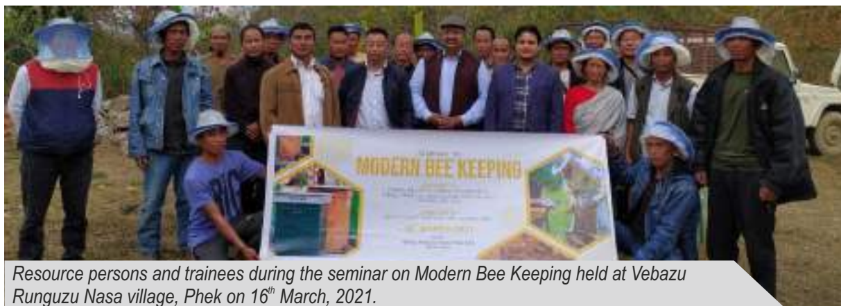
Resource persons and trainees during the seminar on Modern Bee Keeping held at Vebazu Runguzu Nasa village, Phek on 16 th March, 2021.