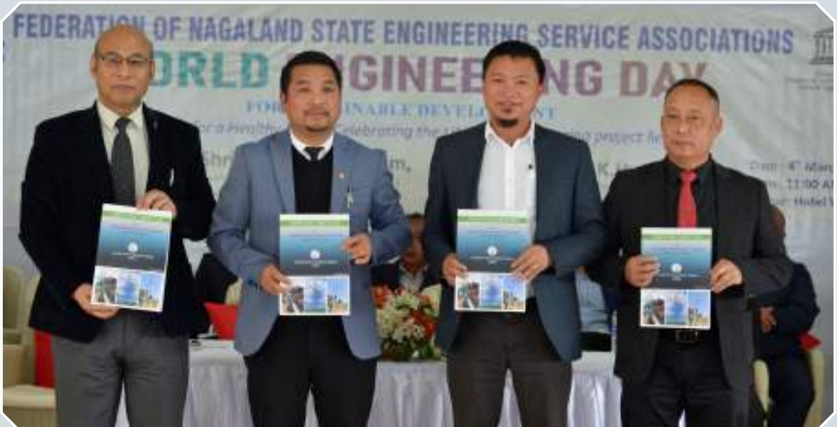
Minister, Public Works Department (Housing and Mechanical), Tongpang Ozukum along with officials during the release of the Vision Document 2021 for 'Sustainable Development of Nagaland State Power Sector' on World Engineering Day on 4 th March 2021.