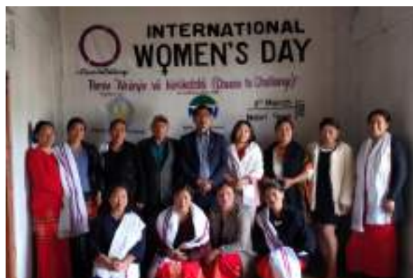
International Women's Day celebrated at Meluri under the theme 'Choose to Challenge' on 8 th March 2021.

International Women's Day was celebrated at Meluri sub-division, organised by Pochury Mother's Association, sponsored by the North East Network, under the theme "Choose to challenge" on 8 th March 2021.