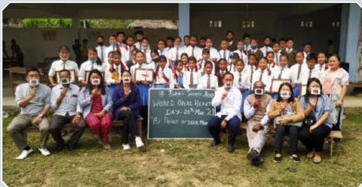
Students and participants during the World Oral Health Day celebration at St. John School, Aboi on 20 th March 2021.