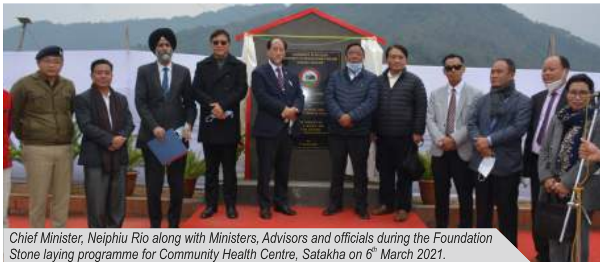
Chief Minister, Neiphiu Rio along with Ministers, Advisors and officials during the Foundation Stone laying programme for Community Health Centre, Satakha on 6 th March 2021.

Chief Minister (CM), Neiphiu Rio laid the Foundation Stone for Community Health Centre