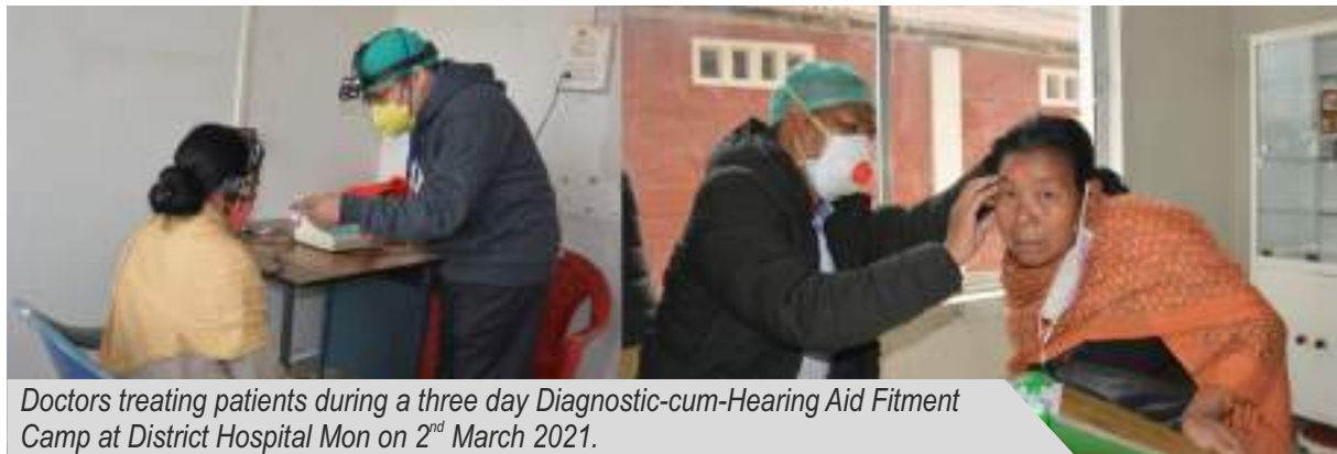
Doctors treating patients during a three day Diagnostic-cum-Hearing Aid Fitment Camp at District Hospital Mon on 2 nd March 2021.