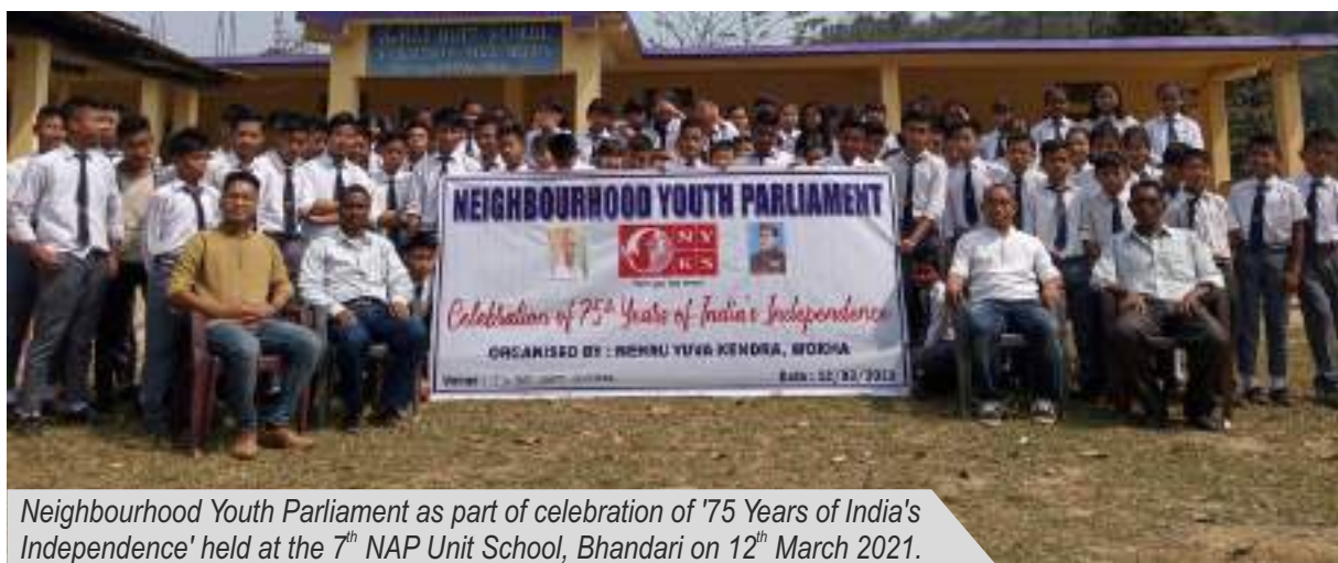
Neighbourhood Youth Parliament as part of celebration of '75 Years of India's Independence' held at the 7 th NAP Unit School, Bhandari on 12 th March 2021.

Neighbourhood Youth Parliament as part of celebration of '75 Years of India's Independence,' organised by Nehru Yuva Kendra, Wokha was held at the 7 th NAP Unit School, Bhandari on 12 th March 2021.