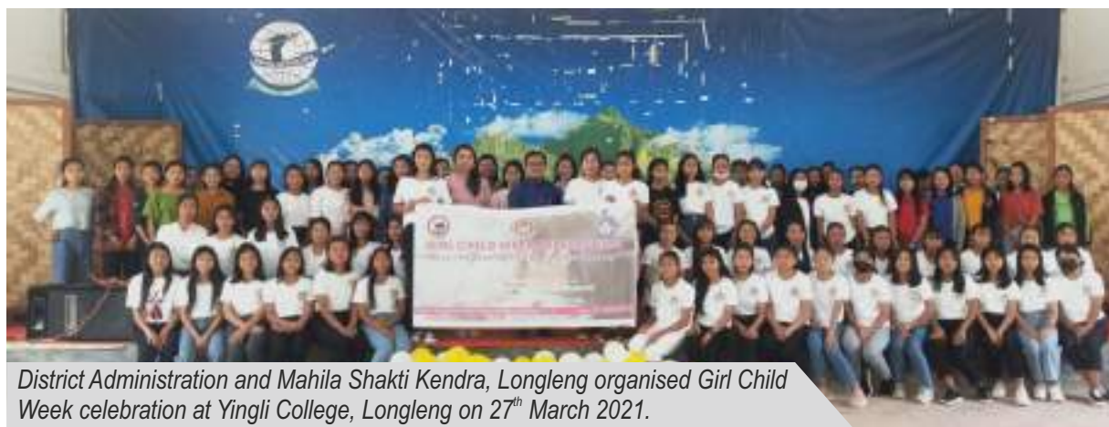
District Administration and Mahila Shakti Kendra, Longleng organised Girl Child Week celebration at Yingli College, Longleng on 27 th March 2021.

District Administration and Mahila Shakti Kendra, Longleng conducted Girl Child Week celebration under Beti Bachao Beti Padhao (BBBP) on the theme 'Empowering Girls for a Brighter Tomorrow' at Yingli College, Longleng on 27 th March 2021.