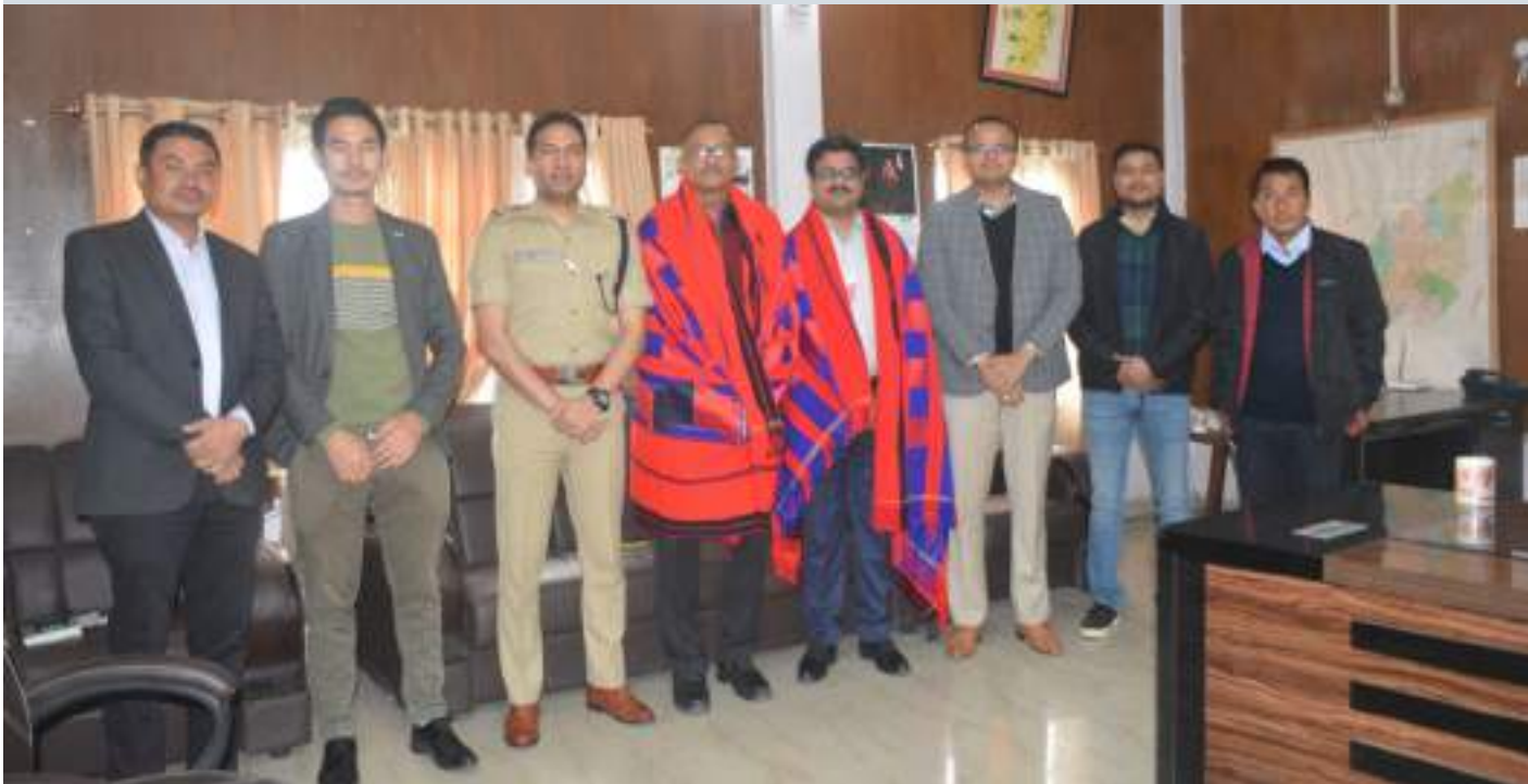
The General Observer and the Expenditure Observer for bye-election of 51-Noksen Assembly Constituency with Deputy Commissioner (DC), Tuensang, Kumar Ramnikant, IAS and other officials at a meeting in DC's Office Chamber, Tuensang on 30 th March 2021.