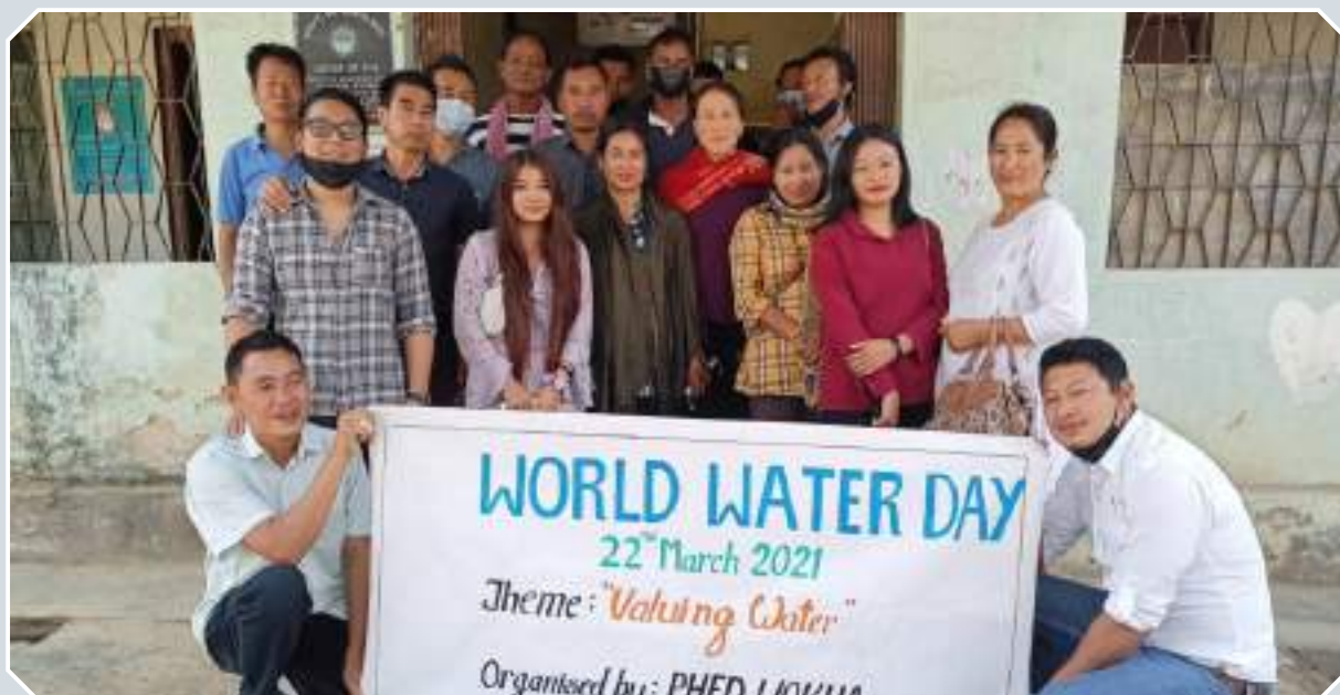
Participants during the commemoration of World Water Day under the theme, 'Valuing Water' which was organized by Public Health Engineering Department, Wokha on 22 nd March 2021.