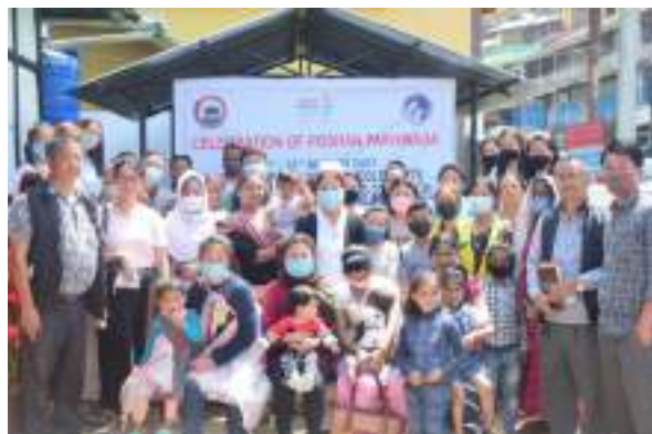
Social Welfare Department with Health & Family Welfare Department conducted Poshan Pakhwada Camp at Sub-Centre Salangtem Ward, Mokokchung on 22 nd March 2021.