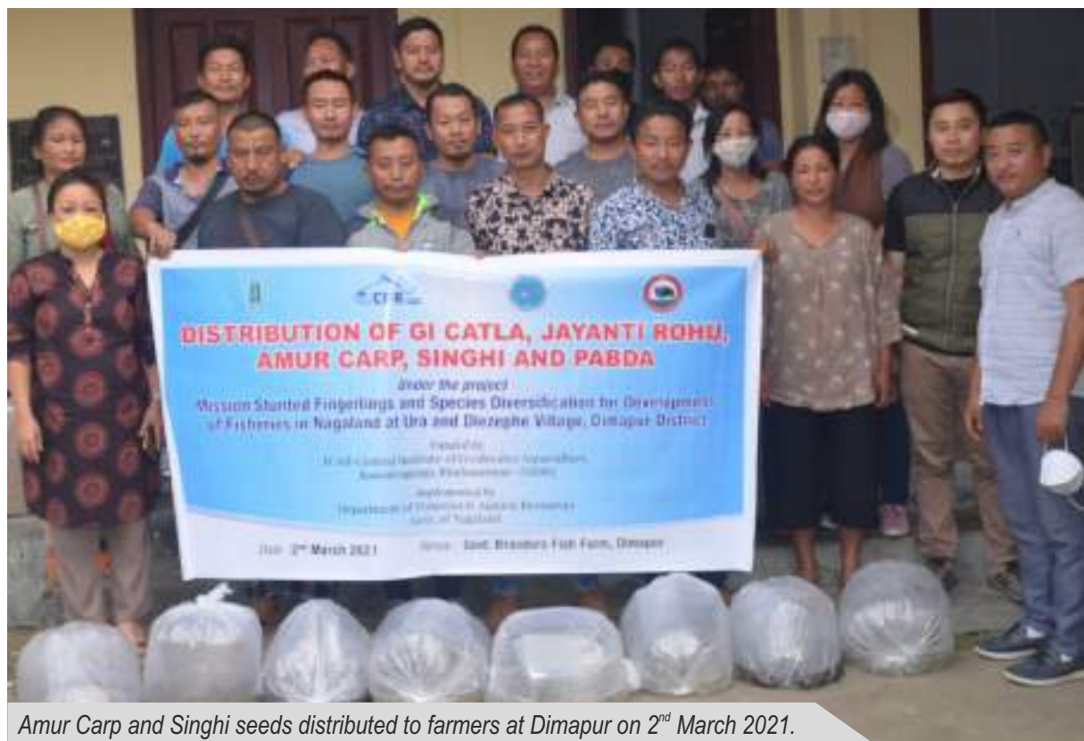
Amur Carp and Singhi seeds distributed to farmers at Dimapur on 2 nd March 2021.

The Department of Fisheries & Aquatic Resources in collaboration with Indian Council of Agricultural Research-Central Institute of Fresh Water Aquaculture (ICAR-CIFA), Bhubaneswar,