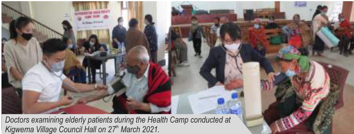
Doctors examining elderly patients during the Health Camp conducted at Kigwema Village Council Hall on 27 th March 2021.