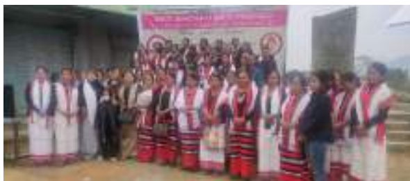
International Women's Day celebrated at Tening on 8 th March 2021.

retired DPO, Department of Social Welfare on 8 th March 2021.