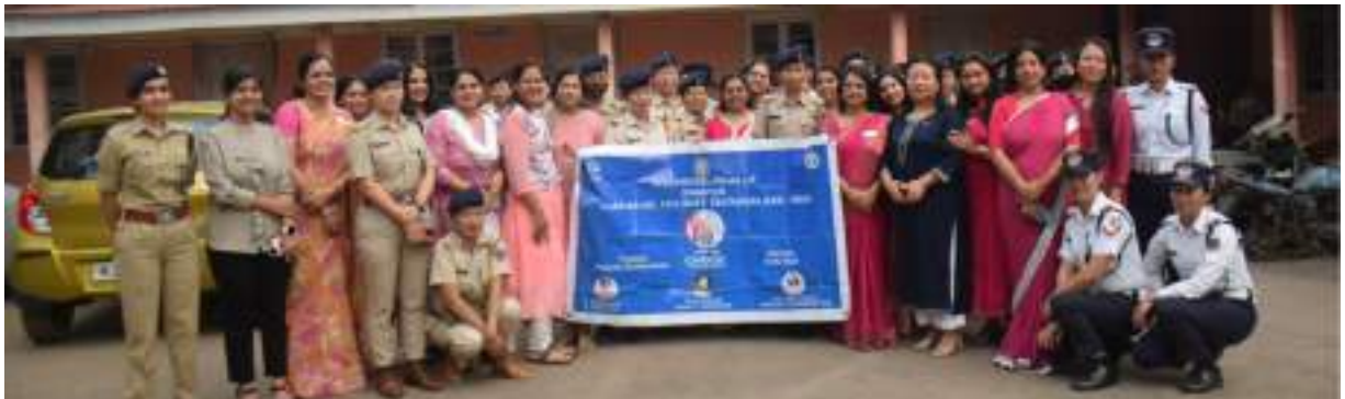
The Dimapur Police organized a health awareness camp for women police personnel on the occasion of International Women's Day at DCP Zone II Office, Dimapur on 8 th March 2021.

Altogether, 22 women from 11 wards, SHGs and women organisations attended the class. On the final day, Deputy Commissioner, Kiphire, Wati Aier, NCS encouraged the trainees to take the opportunity and apply what they have learnt as a small step towards a sustainable livelihood. The training incorporated both modern and traditional methods of baking and recipes.