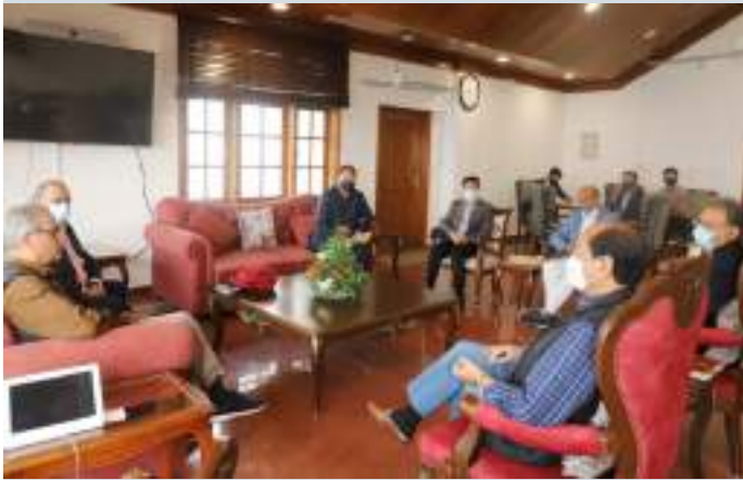
Chief Minister (CM), Neiphiu Rio with members of the Press Council of India Sub-Committee during a meeting at CM's Residential Office, Kohima on 23 rd March 2021.