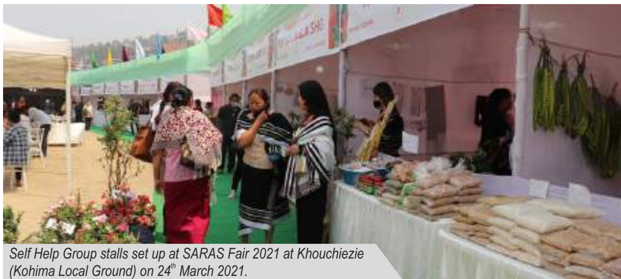
Self Help Group stalls set up at SARAS Fair 2021 at Khouchiezie (Kohima Local Ground) on 24 th March 2021.