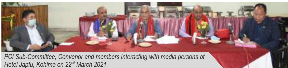
PCI Sub-Committee, Convenor and members interacting with media persons at Hotel Japfu, Kohima on 22 nd March 2021.