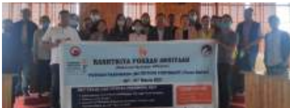
ADC, Peren, Mhathung Tsanglao along with Social Welfare Department officials and others during the closing function of Poshan Pakhwada 2021 at DC's Conference Hall, Peren on 31 st March 2021.

CDPO, Namhuhieng spoke on major activities to be conducted during Poshan Pakhwada and encouraged the participants to play an active role for implementing the activities which will help in sensitising the mass towards adoption of nutritional behaviour.