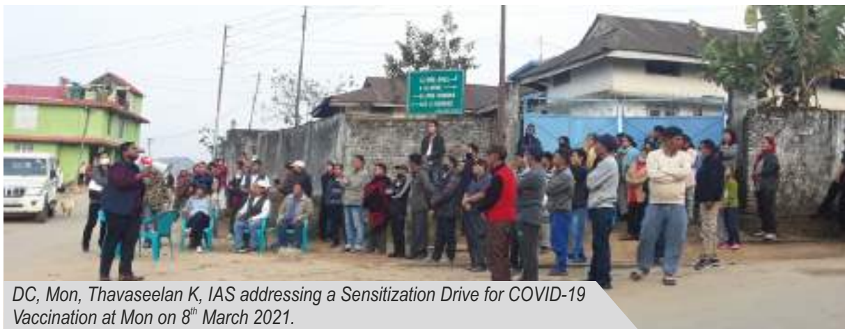
DC, Mon, Thavaseelan K, IAS addressing a Sensitization Drive for COVID-19 Vaccination at Mon on 8 th March 2021.

As part of the sensitisation drive for the phase three of Covishield vaccination in Mon organised by District Administration, Mon and Department of Health & Family Welfare, Mon, Deputy Commissioner (DC), Mon, Thavaseelan K, IAS on 8 th March 2021 visited Wagiem Ward to address a gathering of members from the Ward Council and other elders.