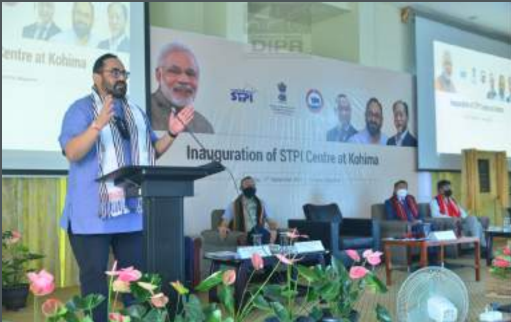
Union Minister of State, Electronics & Information Technology, Skill Development & Entrepreneurship, Government of India, Rajeev Chandrasekhar speaking at the inaugural function of the Software Technology Parks of India at the Directorate of Information Technology & Communication, Kohima on 17 th September 2021.