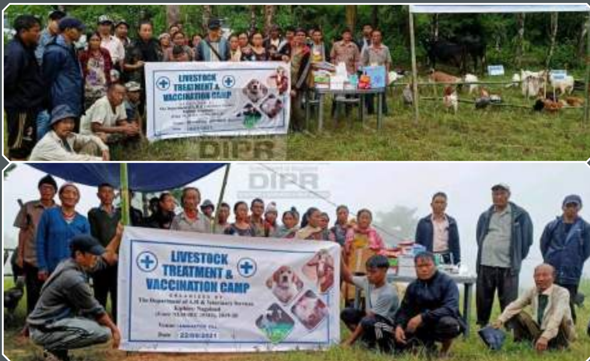
The Department of Animal Husbandry & Veterinary Services, Kiphire organized a livestock treatment and vaccination camp at Murasha and Amahator village, Kiphire on 18 th and 22 nd September 2021, respectively.