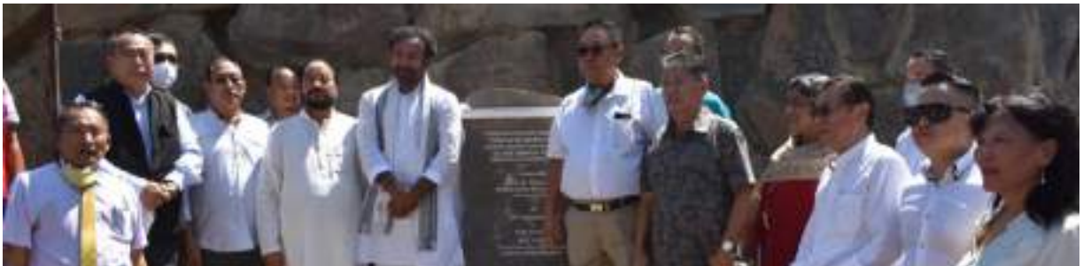
Union Minister for Culture, Tourism and Development of North Eastern Region, G. Kishan Reddy with Deputy Chief Minister, Nagaland, Y. Patton and others after unveiling the commemorative plaque for road project at Sovima, Dimapur on 25 th September 2021.

Union Minister for Culture, Tourism and Development of North Eastern Region (DoNER), G. Kishan Reddy unveiled the commemorative plaque of road from NH -29, Sovima Village Gate to Thahekhu village, Dimapur on 25 th September 2021.