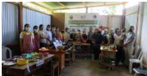
Participants during the cooking competition held as part of Rashtriya Poshan Maah celebration at CDPO's Office, Phek on 10 th September 2021.

Women SHG Federation Phek Block, Phek Town AWW, Kuphulu SHG Ketsapo and Ketsapo Village AWW.