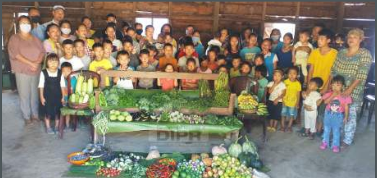
Officials, Anganwadi workers and participants during a programme organized by ICDS Project as part of Poshan Maah celebration at Phek on 14 th September 2021.