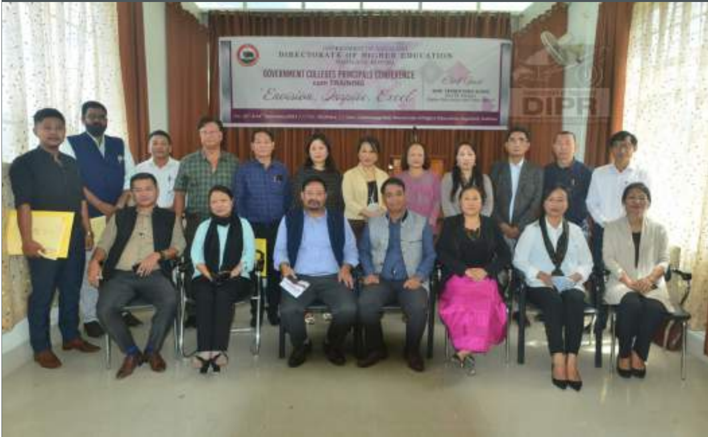
Principals of Government Colleges with officials during the Government Colleges Principals Conference-cum-Training held under the theme 'Envision, Inspire, Excel,' at the Directorate of Higher Education, Kohima on 23 rd and 24 th September 2021.