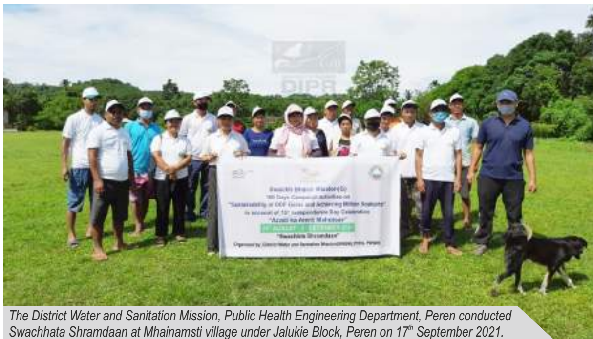
The District Water and Sanitation Mission, Public Health Engineering Department, Peren conducted Swachhata Shramdaan at Mhainamsti village under Jalukie Block, Peren on 17 th September 2021.

During the event the village members, WATSAN committee, village councils, women leaders and youth organisations sensitized the