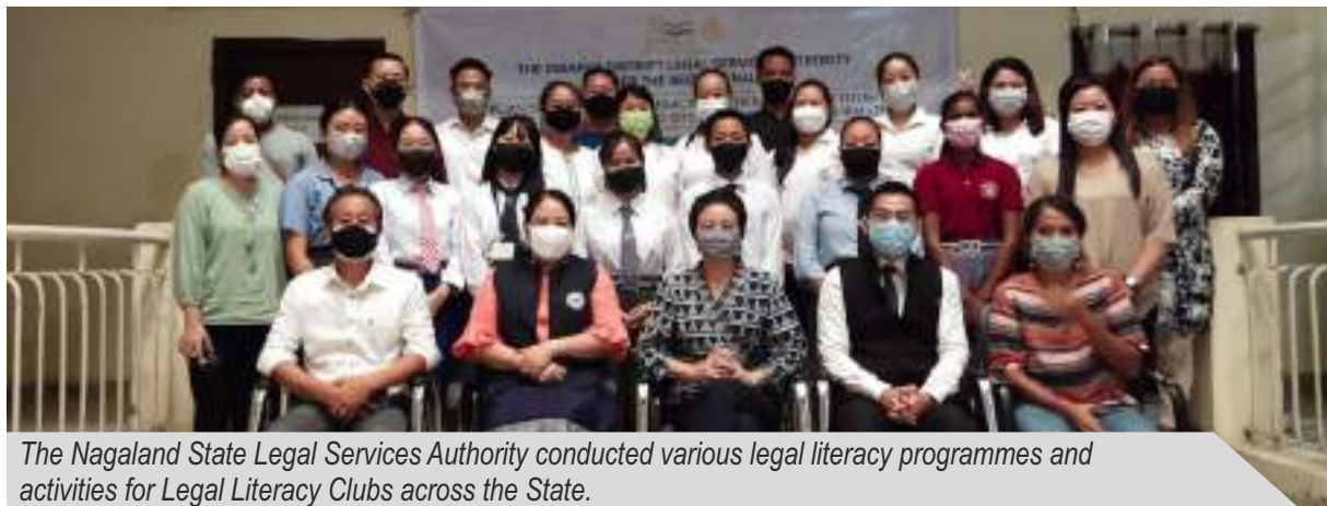
The Nagaland State Legal Services Authority conducted various legal literacy programmes and activities for Legal Literacy Clubs across the State.

The Nagaland State Legal Services Authority (NSLSA) under the aegis of the National Legal Services Authority conducted various legal literacy programmes and activities for Legal Literacy Clubs (LLCs) during the last few days.