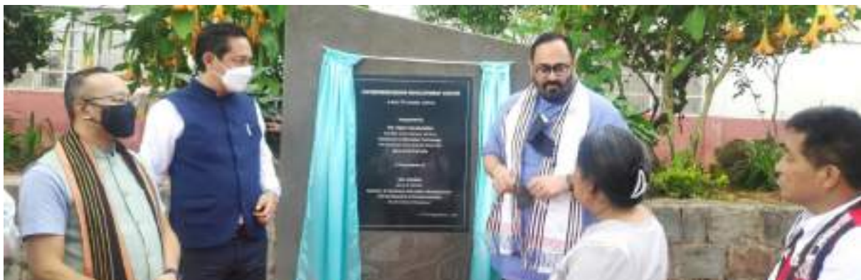
Union Minister of State, Electronics & Information Technology, Skill Development & Entrepreneurship, Government of India, Rajeev Chandrasekhar after inaugurating the Entrepreneurship Development Centre at Industrial Training Institute, Kohima on 17 th September 2021.

Union Minister of State, Electronics & Information Technology, Skill Development & Entrepreneurship, Government of India, Rajeev Chandrasekhar on his visit to Industrial Training Institute, Kohima on 17 th September 2021 inaugurated the Entrepreneurship Development Centre.