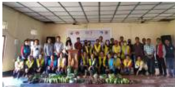
Ghathashi ICDS, Department of Social Welfare held the closing programme of Poshan Maah on 30 th September 2021.

Ghathashi ICDS, Department of Social Welfare celebrated Poshan Maah from 1 st to 30 th September 2021. The closing programme was held at Ghathashi Town Hall under the theme, 'Converging towards a healthy walk through life.'