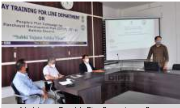
A training on People's Plan Campaign on Gram Panchayat Development Plan was held at DPDB's Hall, Kohima on 28 th September 2021.

A one-day training on People's Plan campaign on Gram Panchayat Development Plan with the line departments was held at DPDB's Hall, Kohima on 28 th September 2021.