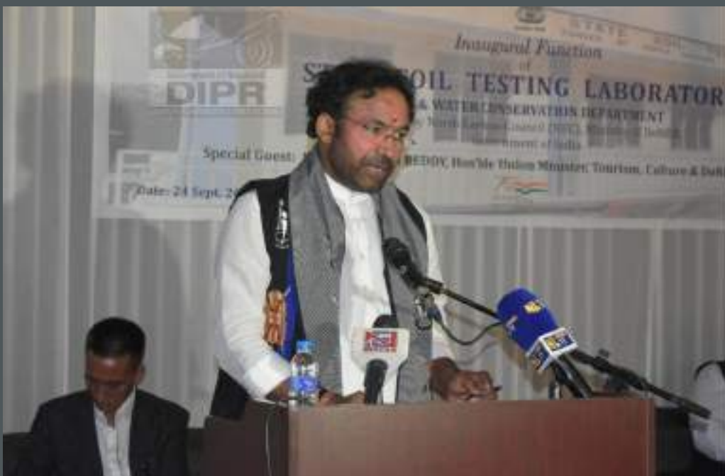
Union Minister for Tourism, Culture and Development of North Eastern Region, Government of India, G. Kishan Reddy speaking at the inaugural function of the State Soil Testing Laboratory at Directorate of Soil & Water Conservation, Kohima on 24 th September 2021.