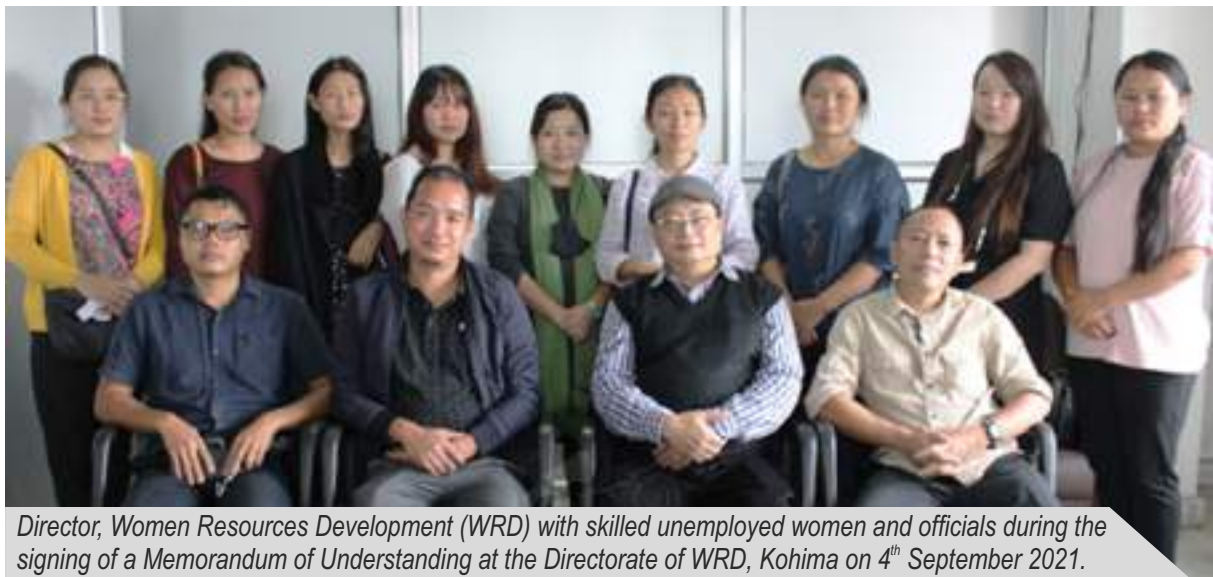
Director, Women Resources Development (WRD) with skilled unemployed women and officials during the signing of a Memorandum of Understanding at the Directorate of WRD, Kohima on 4 th September 2021.

started during 2019-20, where trainees from Multi Training Centres (MTCs) of the Department as well as other skilled unemployed women tailors and weavers were given the opportunity to enable sustainable livelihood as well as for enhancement of Myki apparels and accessories production output. Since then, every year, various skilled unemployed women individuals are being engaged in these activities.