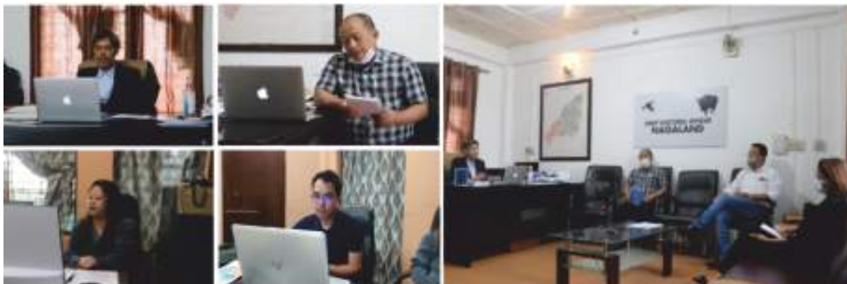
Training on Special Summary Revision of Electoral Roll 2022 was conducted through virtual mode on 24 th September 2021.

The Office of the Chief Electoral Officer (CEO), Nagaland organized a one day training programme through virtual mode on 24 th September 2021 for Electoral Registration Officers (EROs), Assistant Electoral Registration Officers (AEROs) and Assistant Election Officers (AEOs) in connection with conduct of Special Summary Revision of Electoral Roll with reference to 01.01.2022 as the qualifying date.