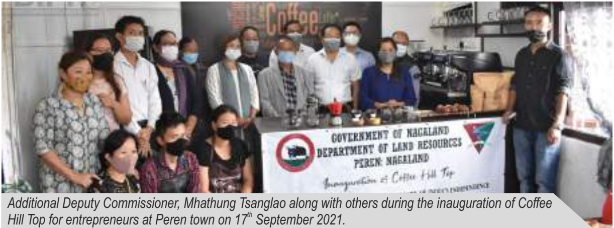
Additional Deputy Commissioner, Mhathung Tsanglao along with others during the inauguration of Coffee Hill Top for entrepreneurs at Peren town on 17 th September 2021.

Additional Deputy Commissioner, Mhathung Tsanglao inaugurated Coffee Hill Top for entrepreneurs under the initiative of Land Resources Department (LRD), Government of Nagaland at Peren town on 17 th September 2021.