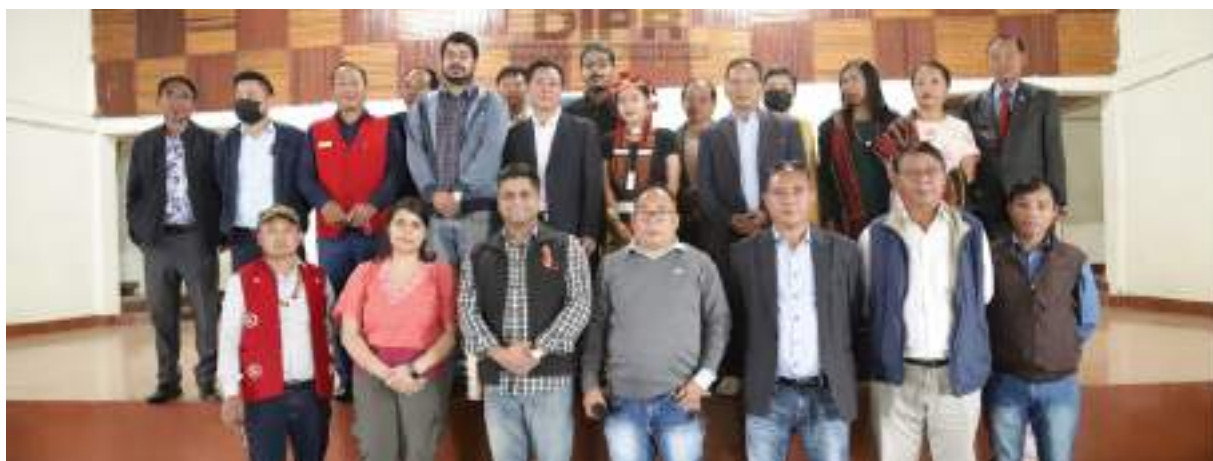
Deputy Commissioner, Zunheboto, Peter Lichamo along with officials and others during the 1 st Farmer's Market Meet 2021 at Town Hall, Zunheboto on 22 nd September 2021.

successfully materialising their project and also holding such an event at the district. He added that potential for rich agriculture farming and organic products were always seen but after seeing the huge stocks of organic products and also keen participation from the farmers it was now clear that the vision of self-sustainable agri farming is definitely achievable. He also encouraged the farmers to continue with the traditional agriculture farming.