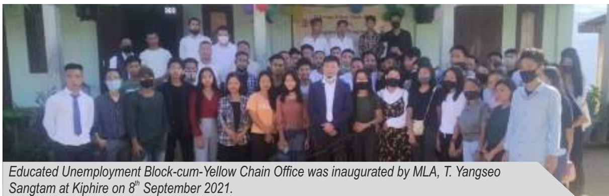
Educated Unemployment Block-cum-Yellow Chain Office was inaugurated by MLA, T. Yangseo Sangtam at Kiphire on 8 th September 2021.

During the programme he encouraged all the educated youths to take up skill development as he said, in the present scenario many talented youths are