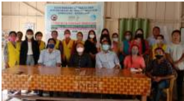
Rashtriya Poshan Maah, under the theme 'Converging towards a healthy walk through life' was launched at EBRC Hall, Longleng on 3 rd September 2021.