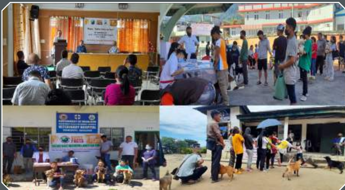
The Department of Animal Husbandry & Veterinary Services, Nagaland observed the 15 th World Rabies Day under the theme, 'Rabies: Facts, not Fear' in various parts of the State on 28 th September 2021.