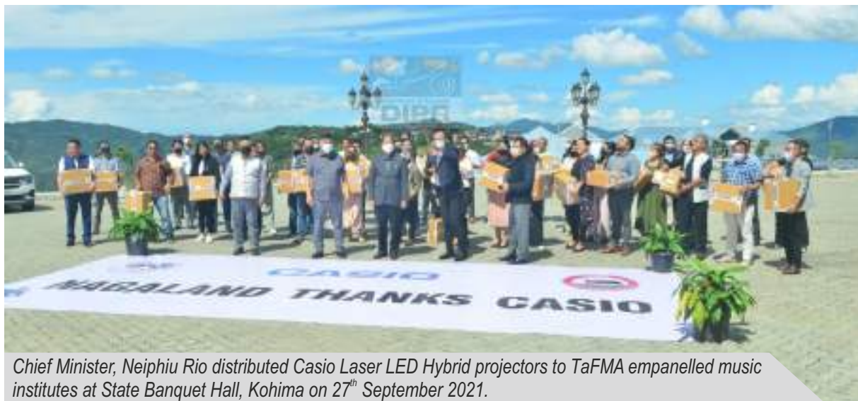
Chief Minister, Neiphiu Rio distributed Casio Laser LED Hybrid projectors to TaFMA empanelled music institutes at State Banquet Hall, Kohima on 27 th September 2021.

Casio Laser LED Hybrid projectors were distributed to TaFMA empanelled music institutes, TaFMA district partners and selected community based NGOs by Chief Minister, Neiphiu Rio on 27 th