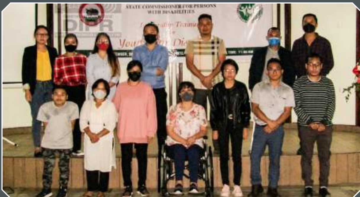
The Office of the State Commissioner for Persons with Disabilities conducted a leadership training for youth with disabilities at Kohima on 24 th September 2021.