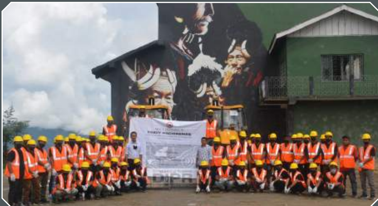
Officials and trainees during the skill training on heavy machineries for economic development of Nagaland for Junior Excavator Operators, which was conducted at Parade Ground, Tuensang.