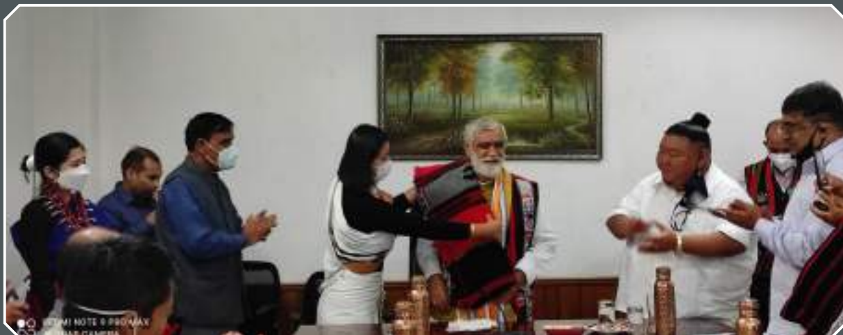
Department of Environment, Forest & Climate Change felicitating Union Minister of State, Environment, Forest & Climate Change, Consumer Affairs and Food & Public Distribution, Ashwini Kumar Choubey at Hotel Vivor, Kohima on 20 th September 2021.