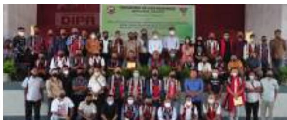
Officials and participants at the culmination programme of Pradhan Mantri Krishi Sinchayee Yojana - Watershed Development Component which was held at Town Hall, Mokokchung on 27 th September 2021.

Organized by the Department of Land Resources, Mokokchung, Nagaland, the culmination programme of Pradhan Mantri Krishi Sinchayee Yojana - Watershed Development Component (PMKSY-WDC), erstwhile Integrated Watershed Management Programme (IWMP), Batch V and VI (Project IX, X and XI) under Mokokchung district was held at Town Hall, Mokokchung on 27 th September 2021.