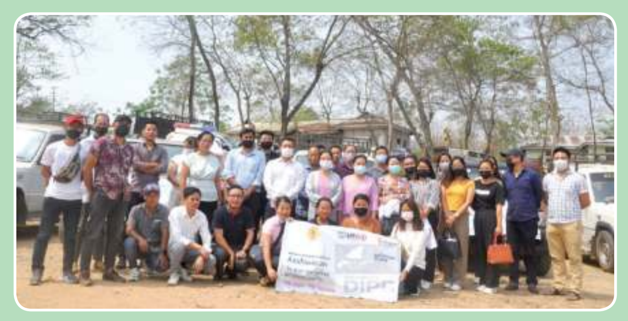
World Tuberculosis Day-cum-launching of Piramal Swasthya (Nagaland) was held at Community Health Centre Jalukie, Peren on 24th March 2022.