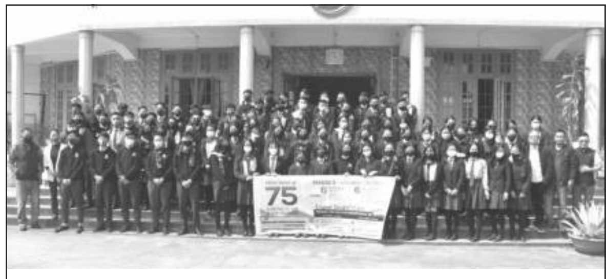
District Level Committee for third phase of New India @75 awareness on HIV, TB, and blood donation was held at Northfield School Auditorium, Kohima on 1<sup>st</sup> March 2022.

District Level Committee for New India @ 75 activities concluded the third phase of New India @75 awareness on HIV, TB, and blood donation with Northfield School students at Northfield School Auditorium, Kohima on 1st March 2022.