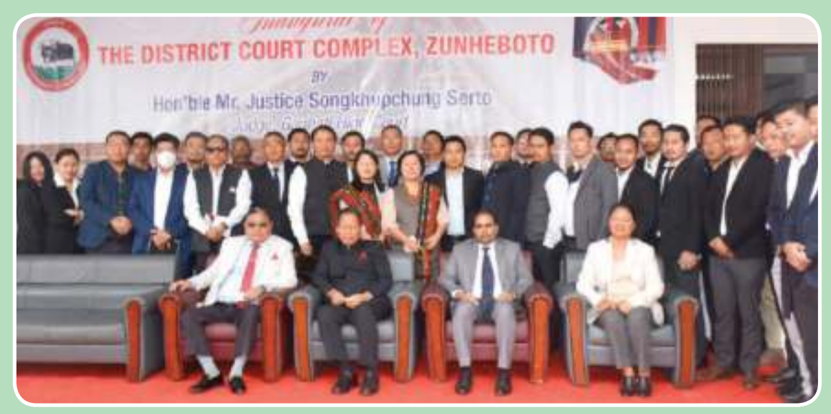
Judge, Gauhati High Court, Justice Songkhupchung Serto and others during the inauguration of the new District Court Complex at Zunheboto on 26th March 2022.