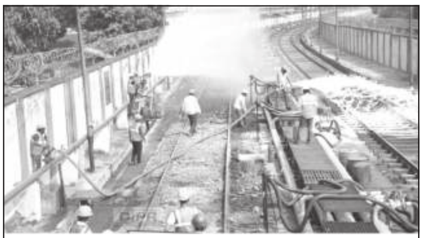
An off-site disaster drill in conjunction with the 51<sup>st</sup> National Safety Day organised at IOCL oil depot at Kevijau Colony, Dimapur on 4<sup>th</sup> March 2022.

The drill started at 9:00 am, wherein, in the event of leakage and fire, the situation was dealt with within the Oil Depot, and simultaneously the people of the nearby community were evacuated as part of the emergency drill.