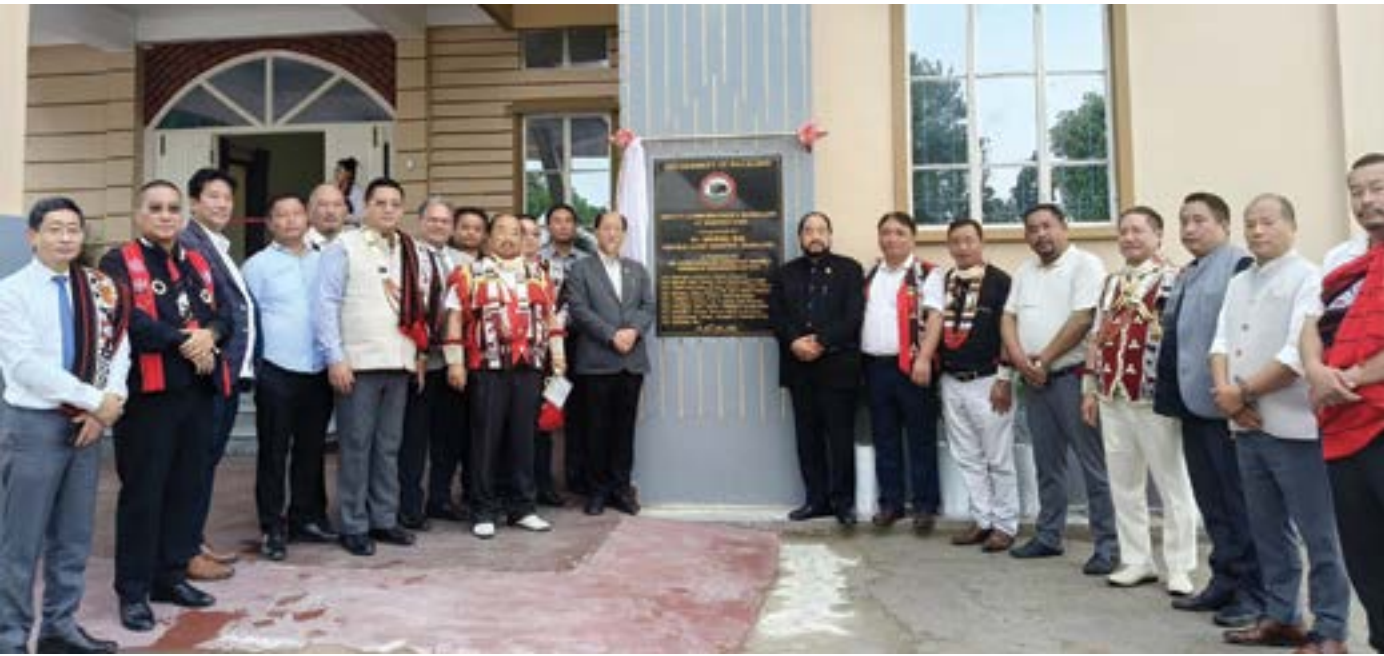
Chief Minister, Dr. Neiphiu Rio along with his colleagues during the inauguration of the Deputy Commissioner's Bungalow at Mokokchung on 2 nd May 2025.