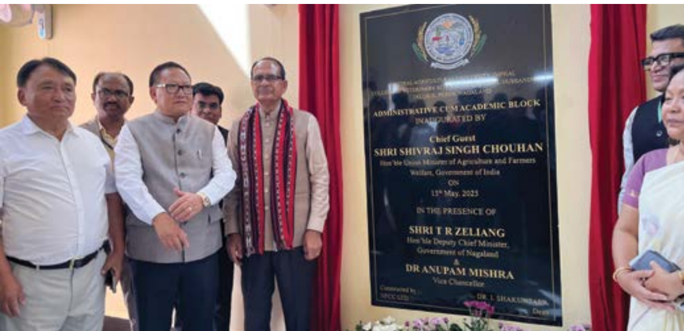
Union Minister for Agriculture and Farmers' Welfare, Government of India, Shivraj Singh Chouhan, along with Deputy Chief Minister, T. R. Zeliang and other officials, during the inaugural ceremony of Administrative-cum-Academic Block and Farmers' Fair at the College of Veterinary Sciences & Animal Husbandry, Jalukie, Peren on 15 th May 2025.