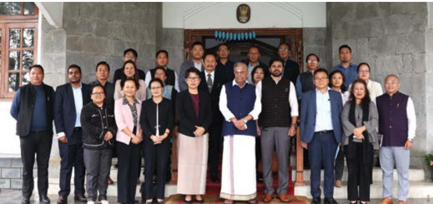
Governor, La Ganesan with the officials of the Department of School Education during a review meeting with the department, held at Raj Bhavan, Kohima on 13 th May 2025.