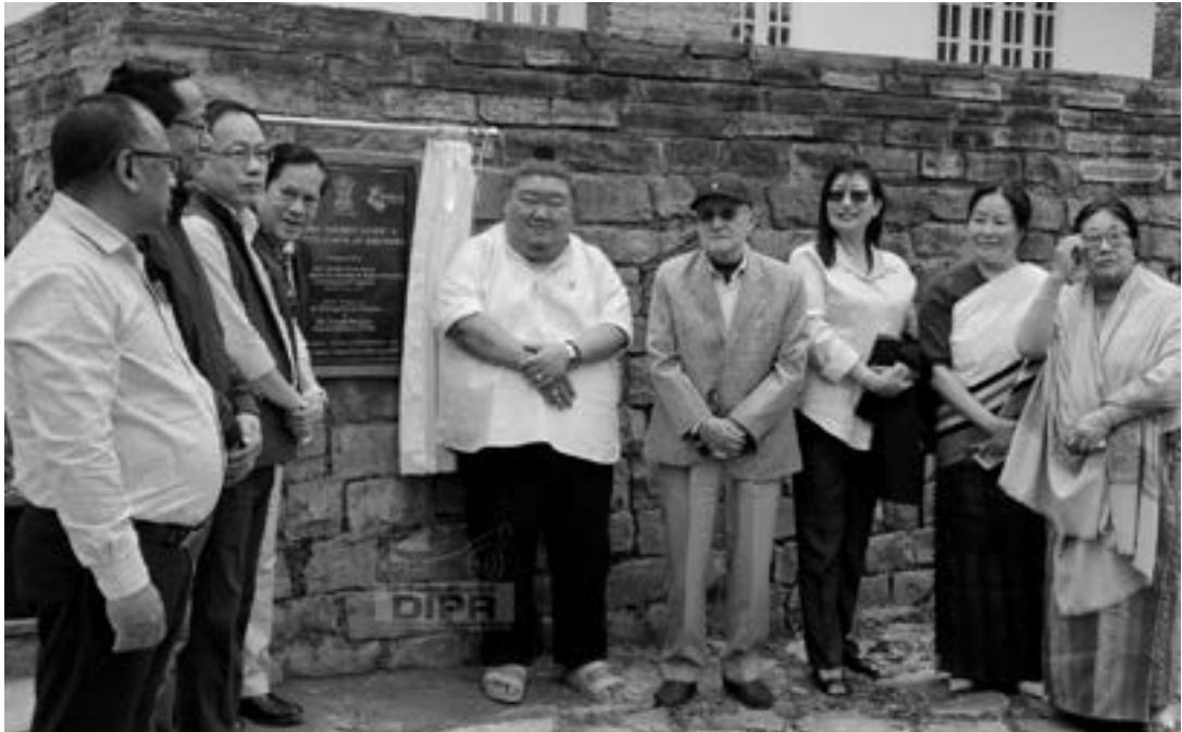
Minister, Tourism and Higher Education, Temjen Imna and other dignitaries at the Enopen Tourist Resort & Services Block inauguration at Khonoma village, Kohima on 15 th May 2025.

The ceremony was also attended by North East Council members, Tenzing Norbu Thongdok and Longki Phangcho.