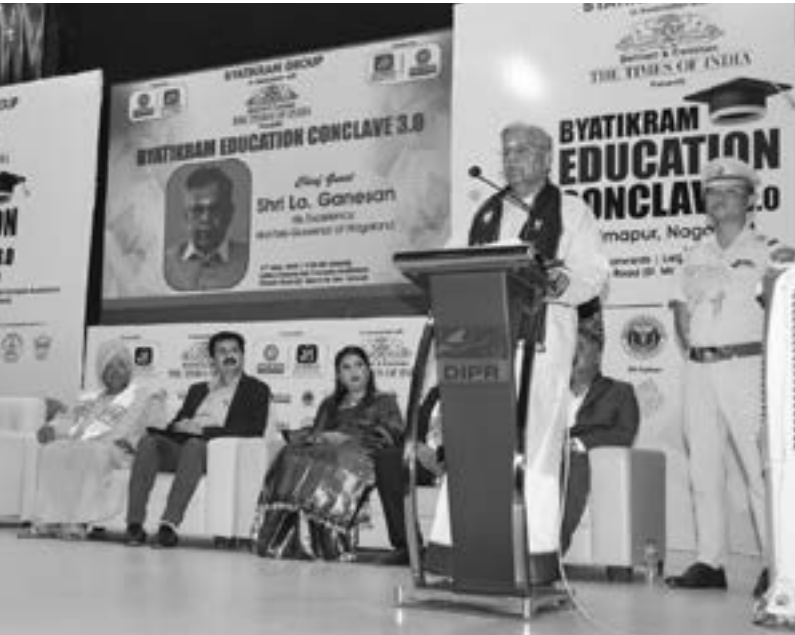
Governor, La Ganesan addressing during the Byatikram Education Conclave 3.0 held at St. Mary's Higher Secondary School, Dimapur on 17 th May 2025.

The Byatikram Education Conclave 3.0 was successfully held at St. Mary's Higher Secondary School, Dimapur on 17 th May 2025 Dimapur, bringing together educators, students, and distinguished dignitaries for a day of inspiration and celebration of academic excellence.