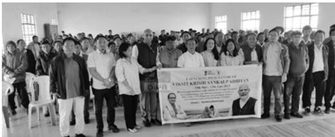
Officials and participants during the launching of Viksit Krishi Sankalp Abhiyan at Council Hall, Tesophenyu village, Tseminyu on 29 th May 2025.

Viksit Krishi Sankalp Abhiyan was also launched at Tuensang, Wokha, Mokokchung and Phek, with interactive sessions being facilitated between farmers, scientists and government officials.