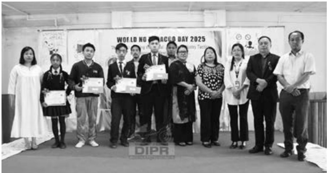
Officials and participants during the 'World No Tobacco Day 2025' observed at the auditorium of Dr. Neilhoushu Kire Government Higher Secondary School, Seikhazou, Kohima on 31 st May 2025.

2025 in line with the World No Tobacco Day 2025, at the auditorium of Dr. Neilhoushu Kire Government Higher Secondary School,