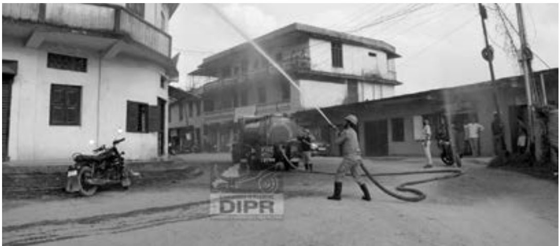
Personnel from Fire & Emergency Services displaying their skills during a Mock Drill Exercise on Preparedness for Civil Defence Exercise at Mon on 7 th May 2025.

During the exercise, Home Guards, Civil Defence & State Disaster Response Force and Fire & Emergency Services personnel demonstrated how first aid has to be administered and evacuation of casualties and injured persons during emergencies. Department of Health & Family Welfare