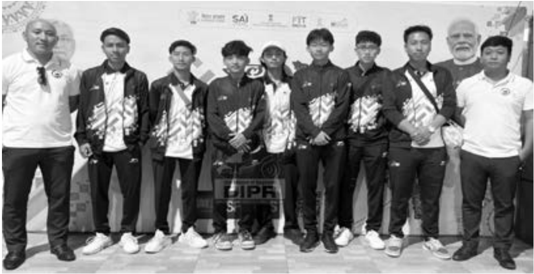
Nagaland contingent officially participated in the Esports category at the Khelo India Youth Games 2025, held at Patna, Bihar on 6 th and 7 th May 2025.