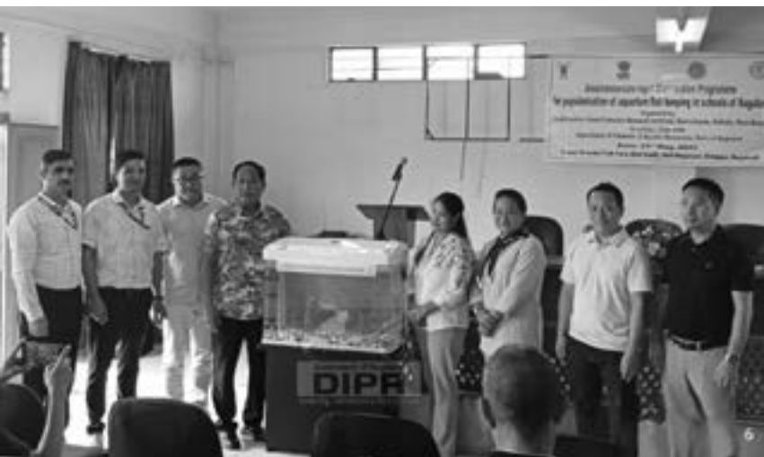
Additional Director, Fisheries & Aquatic Resources (F&AR), Lotimenba with officials from ICAR-Central Inland Fisheries Research Institute, Kolkata and F&AR Department, Nagaland during an 'Awareness-cum-Input Distribution' programme held at Dimapur on 29 th May 2025.

In a major step towards popularizing aquarium fish keeping in educational institutions, the ICAR-Central Inland Fisheries Research Institute (CIFRI), Kolkata, in collaboration with the Department of Fisheries & Aquatic Resources (F&AR), Government of Nagaland, organized an "Awareness-cum-Input Distribution Programme" on 29 th May 2025. The initiative was to target schools across Nagaland, aiming to instill environmental awareness