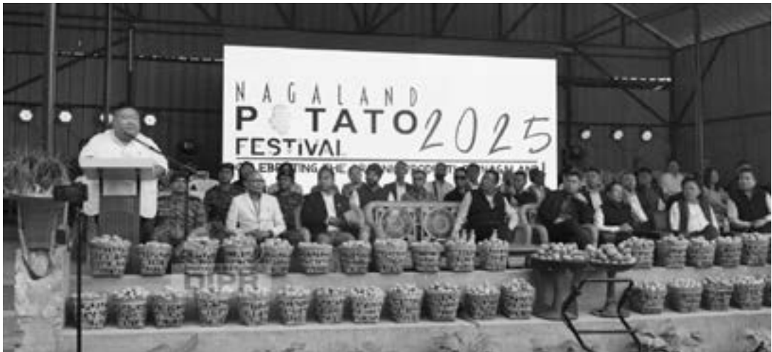
Minister, Tourism and Higher Education, Temjen Imna Along speaking at the 2 nd Edition of the Nagaland Potato Festival 2025 held at Jakhama Local Ground, Kohima on 9 th May 2025.

The festival not only highlighted the growing organic farming movement in Nagaland but also underscored the vital role of grassroots entrepreneurship in driving economic growth and self-sufficiency across the state.