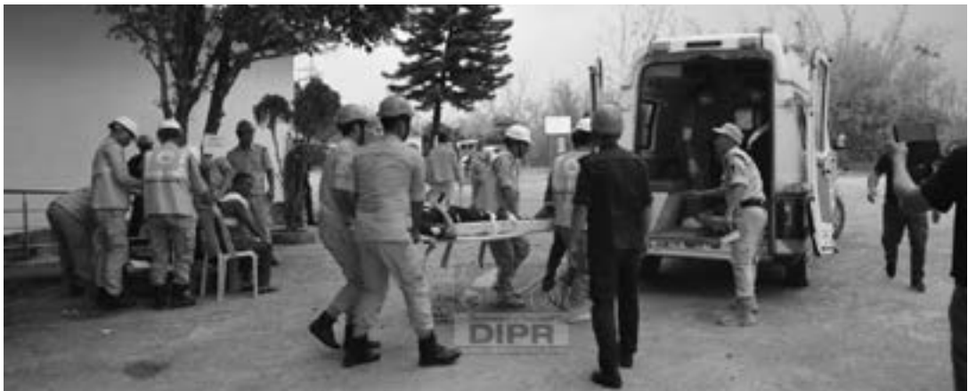
Peren district conducted Civil Defence Mock Drill under the code name 'Operation Abhyaas' at the Deputy Commissioner's Office Complex, Peren on 7 th May 2025.

A district-level civil defence mock drill, code-named "Operation Abhyaas"