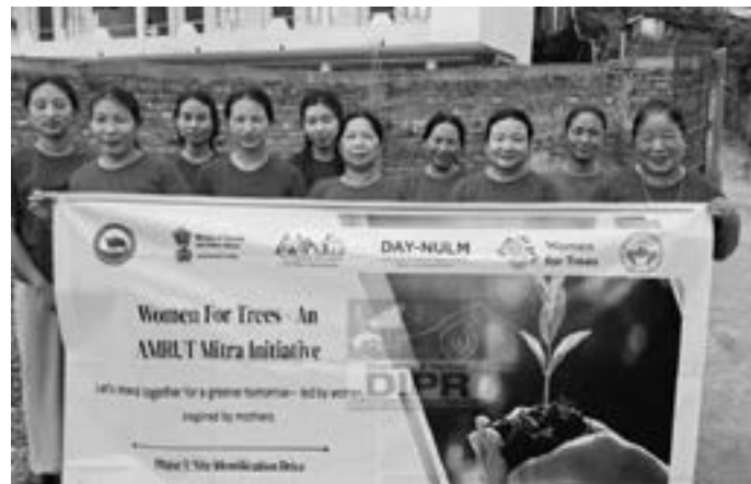
Participants at the Women for Tree, an AMRUT Mitra initiative, under the DUDA, Longleng with the SHG Konchula of Longleng town, Muli Ward on 23 rd May 2025.