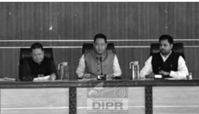
The monthly Mokokchung DPDB meeting was held at the Deputy Commissioner's Office, Mokokchung on 14 th May 2025.

The monthly meeting of Mokokchung District Planning and Development Board (DPDB)-cum-felicitations, and introduction of new DPDB Chairman and new Deputy Commissioner & Vice Chairman DPDB, Mokokchung was held on 14 th May 2025, at the DC's Conference Hall, Mokokchung.