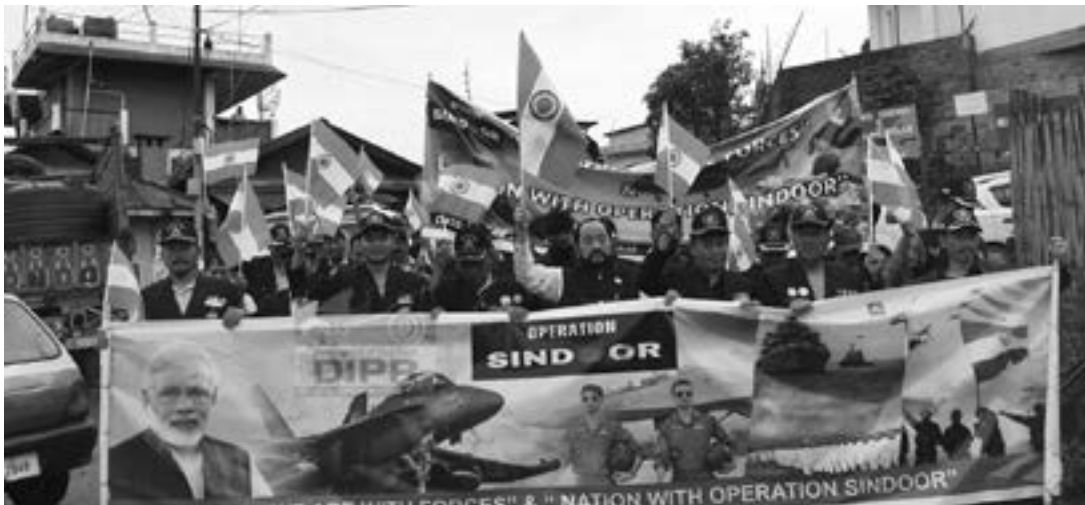
Deputy Chief Minister, and Minister in-charge of Home and Border Affairs, Yanthungo Patton leading the crowd at the Tiranga Rally, reigniting the spirit of nationalism, at Wokha on 15 th May 2025.

In a powerful display of nationalism and solidarity, citizens of Wokha, led by Deputy Chief Minister, Yanthungo Patton organized a Tiranga rally in Wokha town on 15 th May 2025, extending their support for Operation Sindoor.