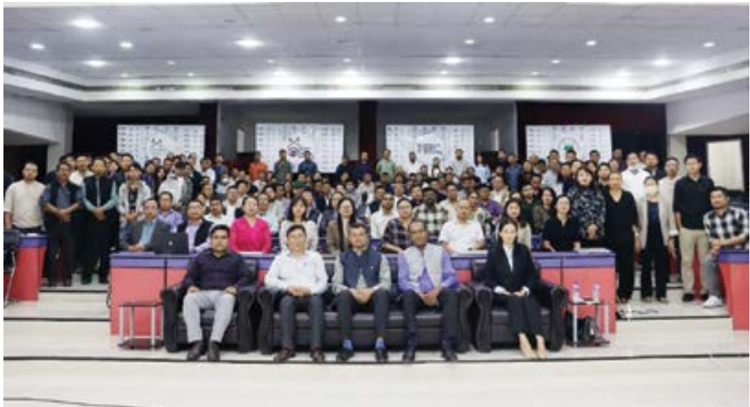
Medical Officers from Nagaland during the Two-Day Refresher Workshop on the Ayushman Bharat Pradhan Mantri Jan Arogya Yojana and Chief Minister Health Insurance Scheme (AB PM-JAY/CMHIS) held at Capital Convention Centre, Kohima on 29 th and 30 th May 2025.