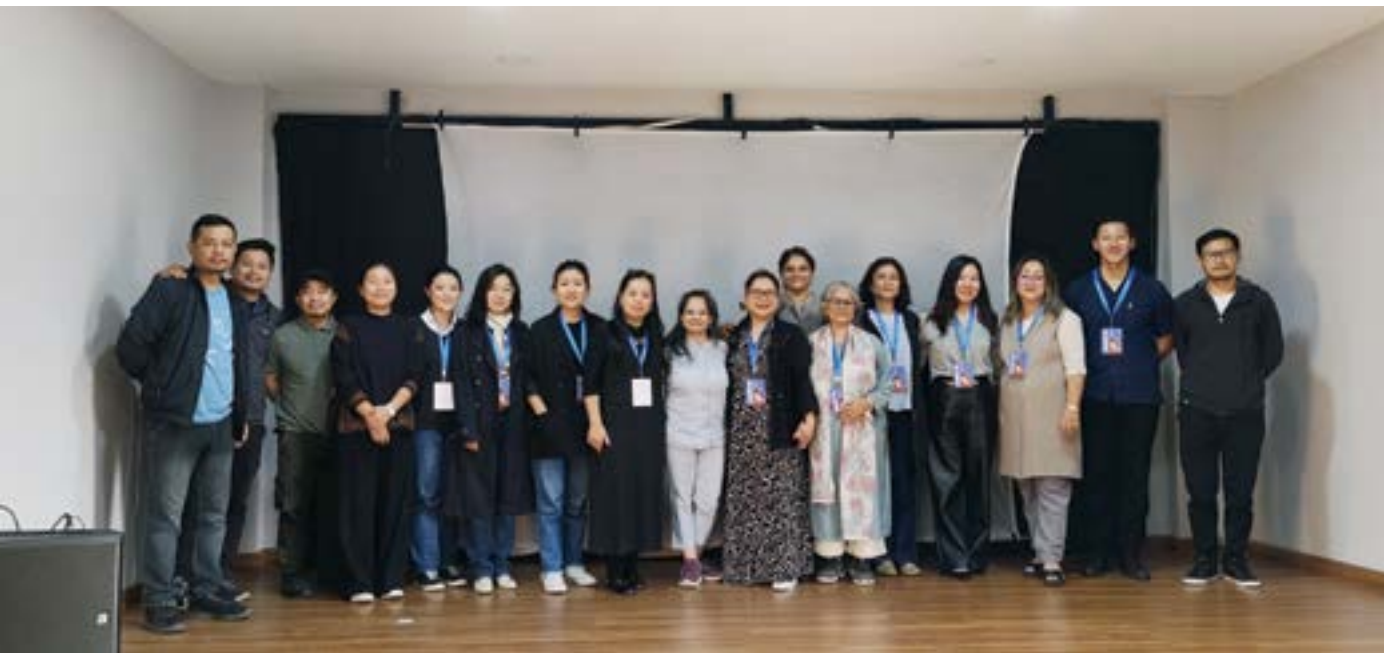
Members of Film Association of Nagaland (FAN) with Filmmakers, Directors and Managing Board Members of International Association of Women in Radio and Television (IAWRT), India during the valedictory programme of the Two-Day IAWRT Travelling Film Festival, held at the Centre of Excellence for Music and Arts (CEMA) at Old Minister's Hill, Kohima on 3 rd May 2025.