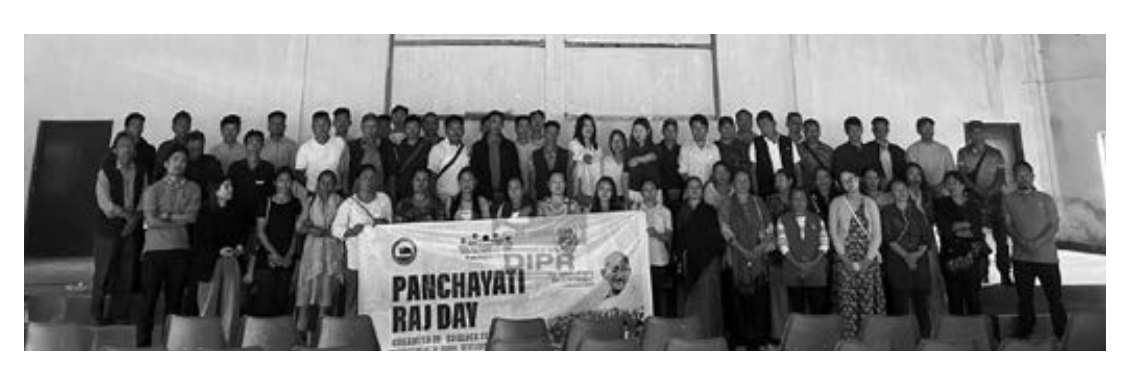
Block Level National Panchayati Raj Day was observed at the Town Hall, Tseminyu on 24th April 2025.

system, and ensuring robust implementation of various government-sponsored schemes in the district.