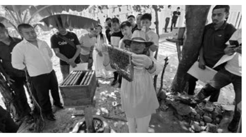
Participants engaged in hands-on experience through practical demonstrations on bee cultivation during the Residential Technology Clinic for Apiculture Sector under the RAMP programme held at the Multi-Utility Centre, NBIM, Chümoukedima on 24<sup>th</sup> April 2025.

day Technology Clinic titled "Innovations in Bee-to-Bottle: Apiculture & Honey Harvesting Solutions" on 24<sup>th</sup> to 25<sup>th</sup> April 2025, at the Multi Utility Center, NBHM, Chümoukedima.