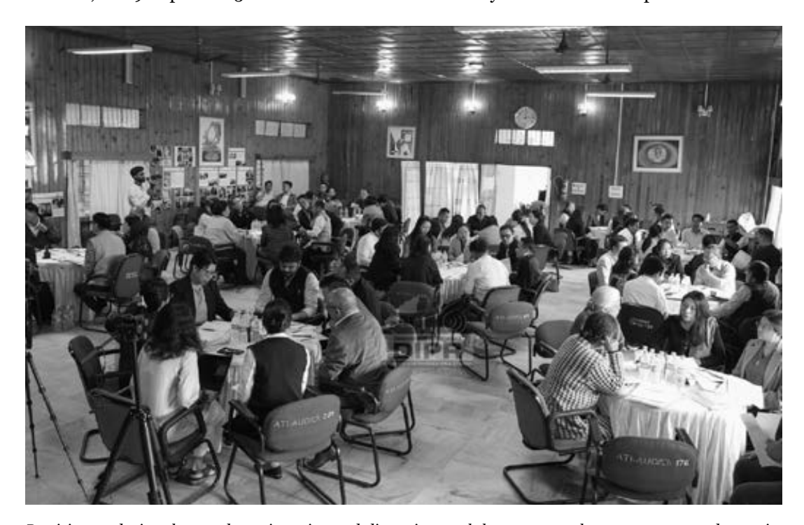
Participants during the one-day orientation and discussion workshop to strengthen governance and capacity building, held at ATI, Kohima on 29^{th} April 2025.

of knowledge sharing and coordination among all sister departments under the Department of School education and SCERT on the key initiatives and expected outcomes