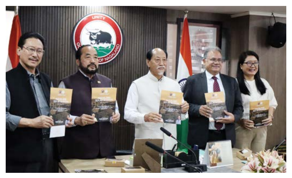
Chief Minister, Dr. Neiphiu Rio and Deputy Chief Minister, Y. Patton with other dignitaries during the launching of Nagaland Solar Mission for installation of Residential Roof Top Solar held at Chief Minister's Office, Nagaland Civil Secretariat, Kohima on 14th April 2025.