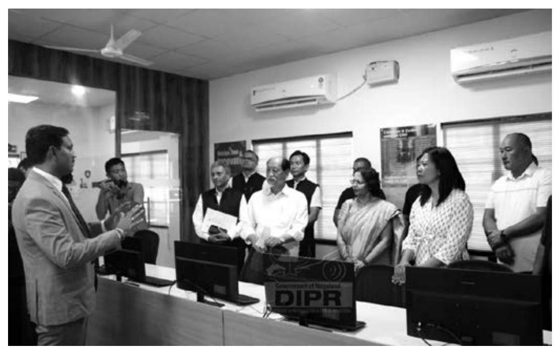
Chief Minister, Dr. Neiphiu Rio and officials at the inauguration of the Centre of Excellence Industry 4.0-Srujan at NTRTC, New Industrial Estate, Dimapur on 25th April 2025.