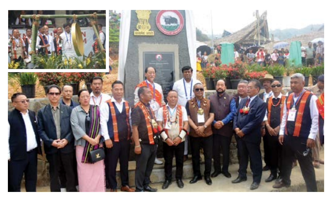
Chief Minister, Dr. Neiphiu Rio with Union Minister of State for Education & Development of North Eastern Region, Government of India, Dr. Sukanta Majumdar and other dignitaries during the unveiling of the Konyak Heritage Complex monolith at Leangha village, Mon 5<sup>th</sup> April 2025. (Inset photo: Union Minister Dr. Sukanta Majumdar banging the gong at the Konyak Heritage Complex inauguration-cum-Konyak Aoleang Monyu 2025 celebration at Leangha village, Mon on 5<sup>th</sup> April 2025).