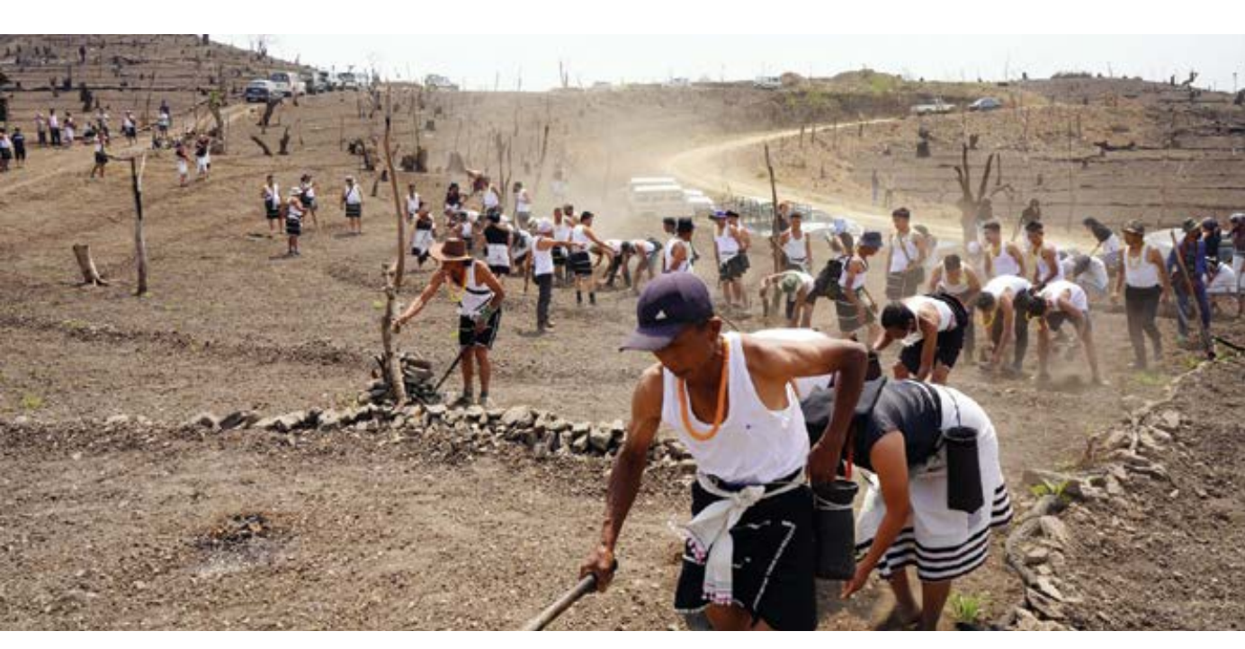
Participants from Chiechama village under Kohima district during the traditional rice sowing programme held at Chiethu, Kohima on 5^{th} April 2025.