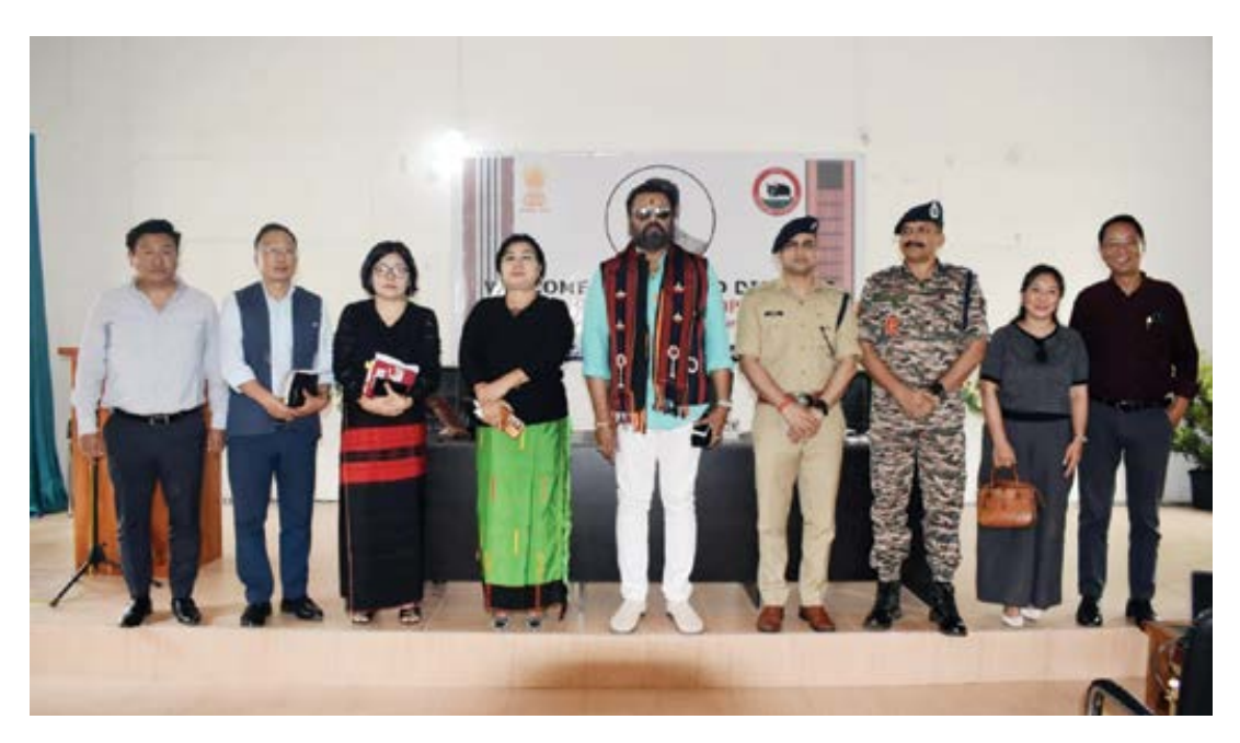
Union Minister of State for Petroleum & Natural Gas and Tourism, Suresh Gopi with Deputy Commissioner, Niuland, Sara S. Jamir and other officials during his visit to Niuland district on 9<sup>th</sup> April 2025.