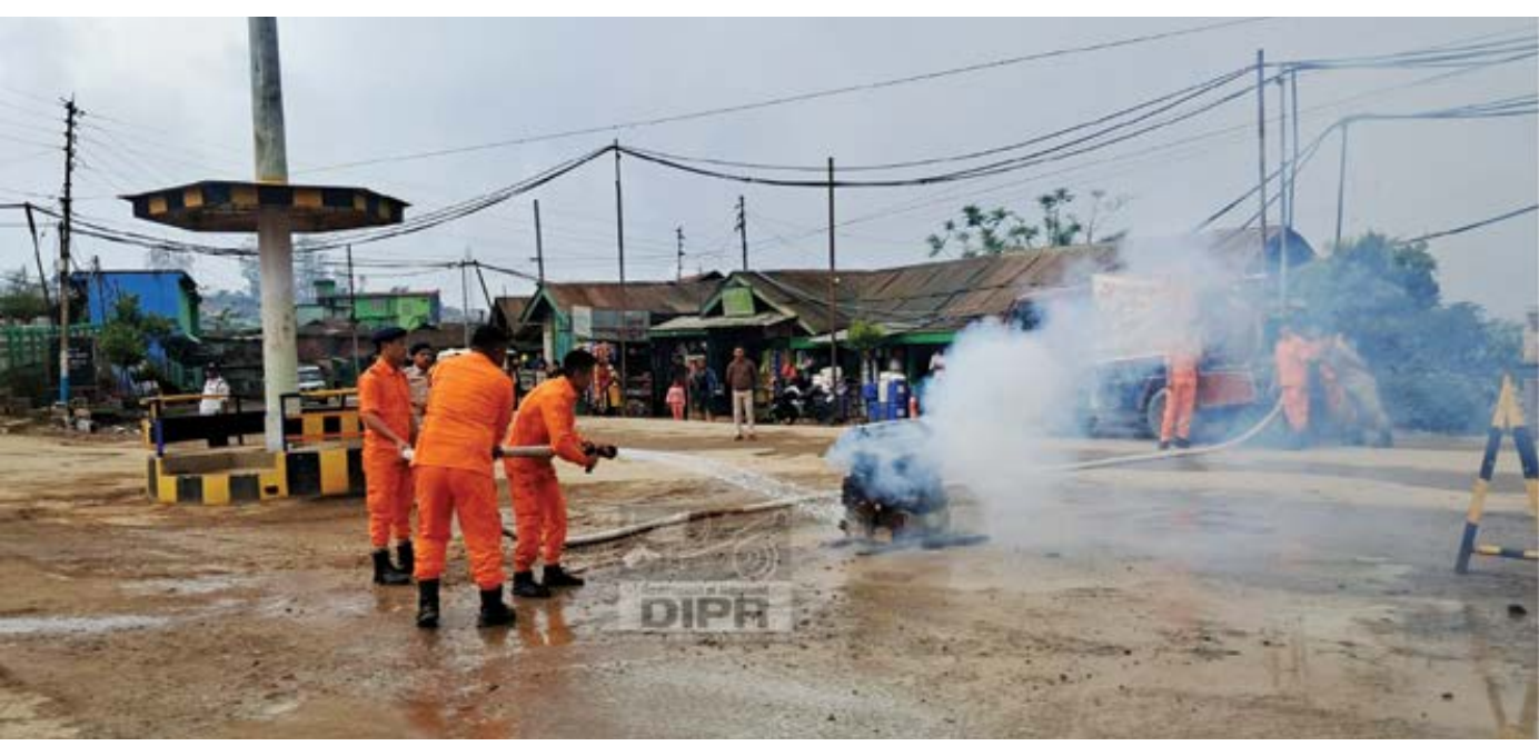
Fire & Emergency Services, Kiphire personnel conducting fire safety demonstration held at Kiphire on 17^{th} April 2025.